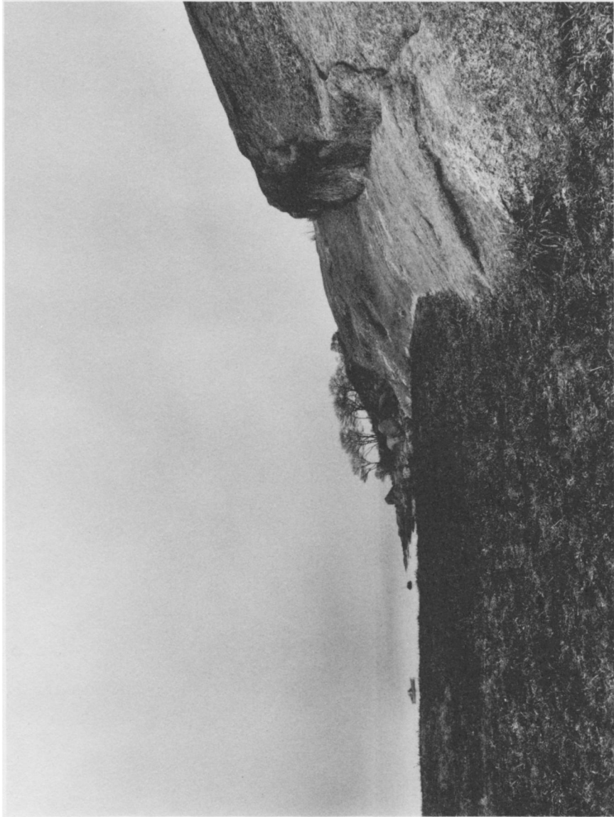
Stage Fort Park