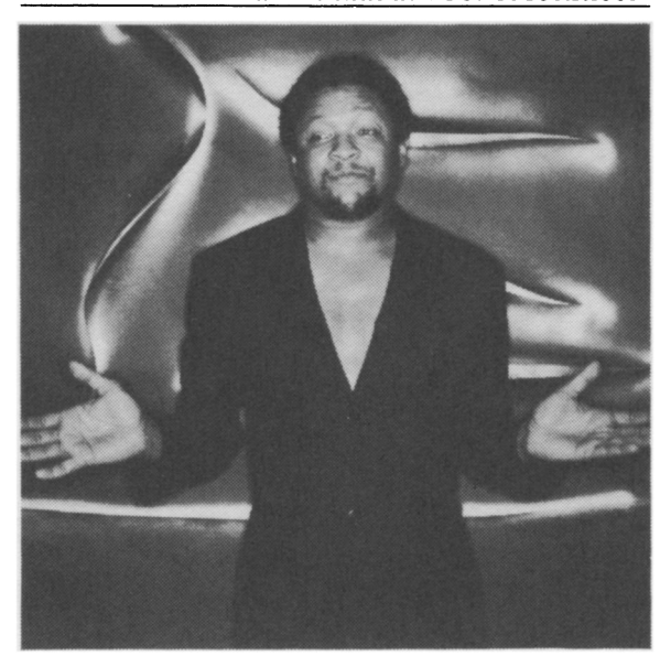
Quincy Troupe - poet - '80