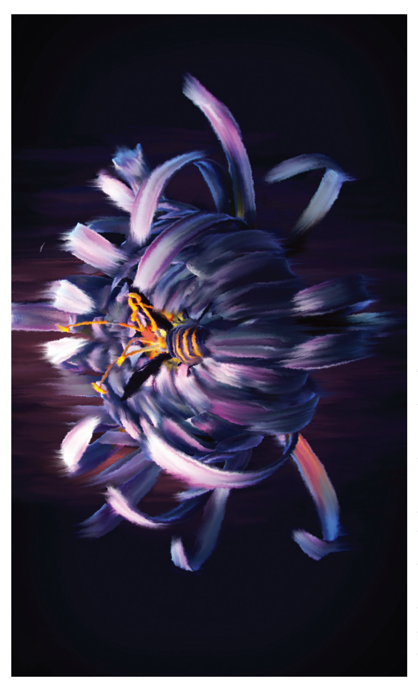
"... bend in close / to burnish a bee going down on a hosta flower..."