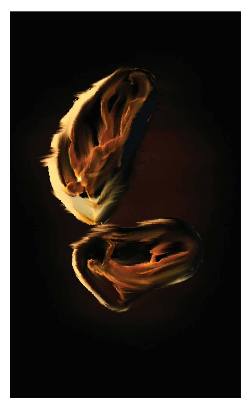
"... I think of you and think / of you as I watch the sun slip..."