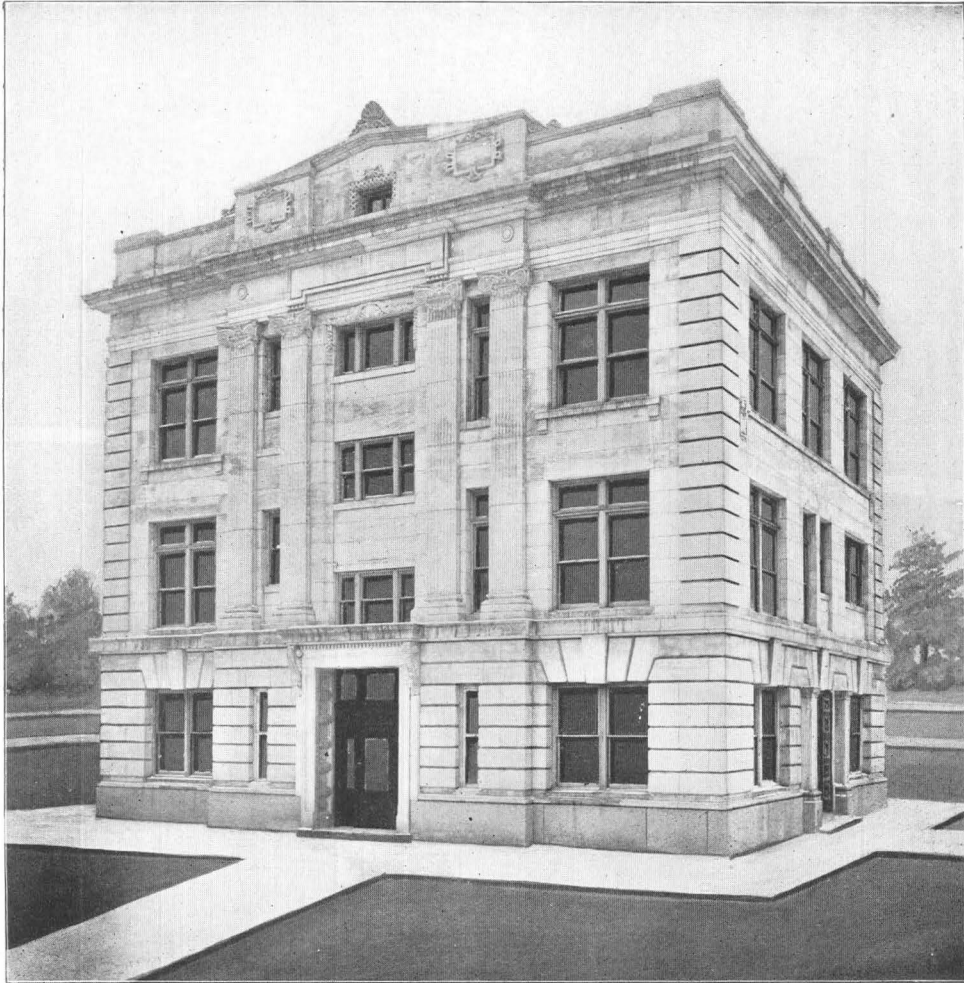
THE ANATOMY BUILDING, STATE UNIVERSITY OF IOWA