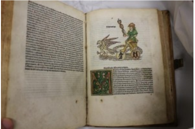
12 "New" Incunables Arrive in Special Collections - Read more of the story at: <u>http://blog.lib.uiowa.edu/speccoll/2013/06/14/new-incunables/</u>