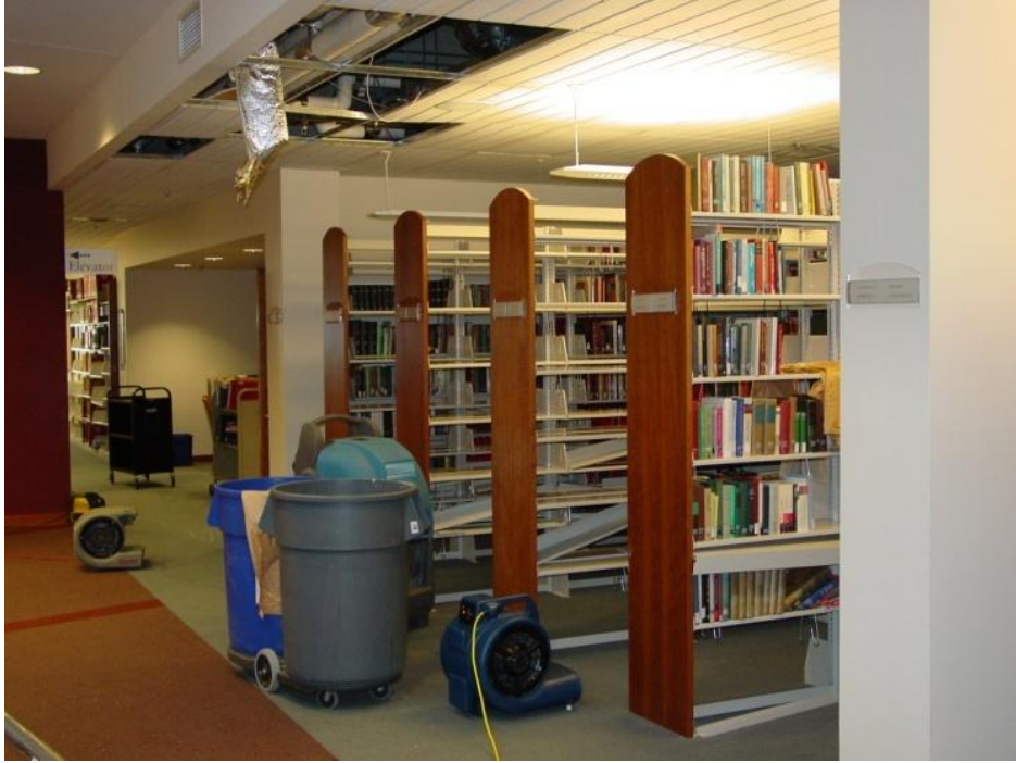
The shelves that were affected.