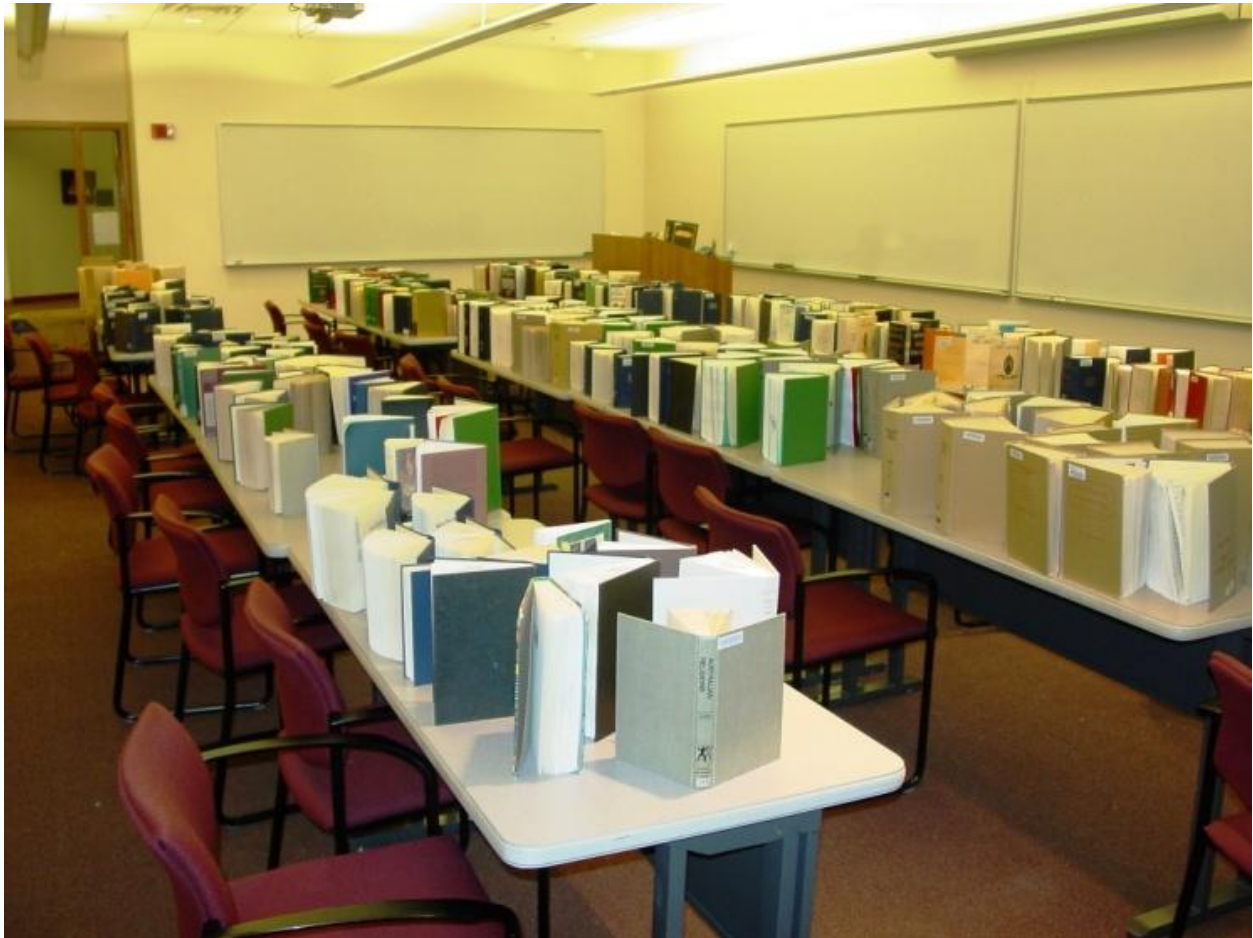
One of our drying areas.