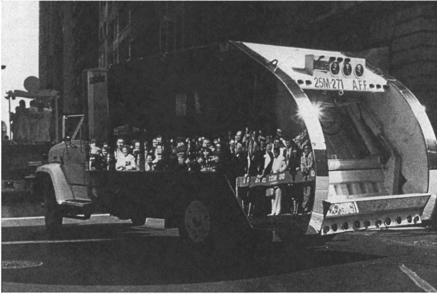
Fig. 4. Mierle Laderman Ukeles. Social Mirror . 1983. Photograph. Mirror-covered sanitation truck.

a way of making interconnection visible. In “Sanitation Manifesto!” (1984) she suggests that the sanitation system, fully and properly understood, illuminates ecological connections between people and place. She writes: