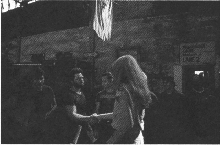
Fig. 3. Mierle Laderman Ukeles. Touch Sanitation Performance. 1979-80. With NYC Department of Sanitation.

Ukeles felt that the second wave of feminism (roughly from the late 1950s through the early 1970s) ended up limiting itself because it failed to see how the struggle for women’s rights was part of something larger. She states that the feminist movement, “like the avant-garde [...] was unconnected” (310). For Ukeles, a particular missed opportunity was the potential to “connect with other people who did a similar kind of work” (310), to connect with others who engaged in maintenance labor. Both women who worked in the home and service workers were marginalized, underpaid, and disregarded. For Ukeles, the opportunity at the DOS was a way to bring the lessons of women’s rights to broader contexts of interconnection: notably, sanitation and the role that maintenance labor plays in sustaining New York City.