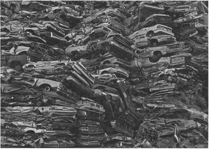
Fig. 1. Chris Jordan. Crushed Cars #2, Tacoma . 2004. Photograph.

of New York City. While he rescues these few items from obsolescence, this work is not primarily concerned with the material life and afterlife of garbage. Nor does it address the system of sanitation that binds us all socially and environmentally.