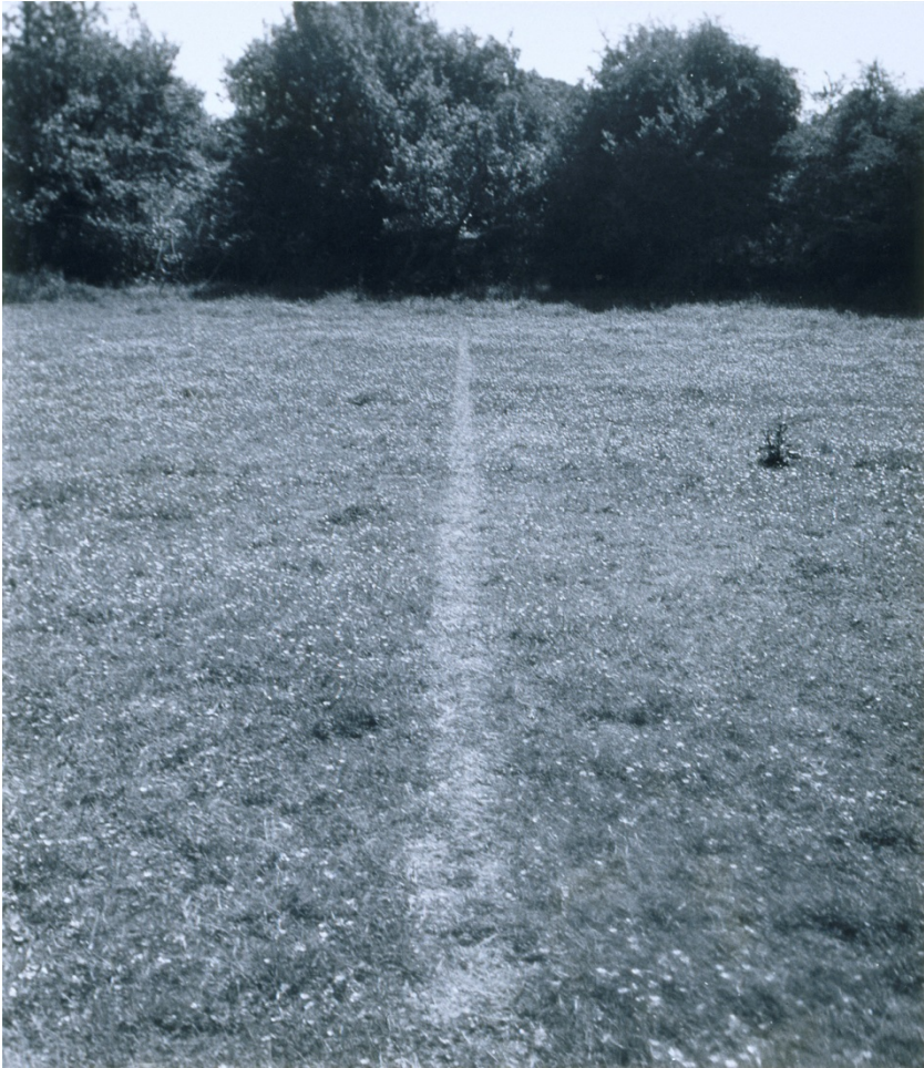
Figure 1 - A Line Made By Walking, 1967, Richard Long (born 1945). In the Tate collection.

announces his absence from the scene. This seemingly paradoxical insight extends the concept of passage beyond Long's traceable movements from point A to B, with each coming and going gesturing toward the existential. In a 1982 artist's statement, Words After the Fact , published in conjunction with a solo exhibition at the Arnolfini Art Gallery in Bristol, Long announced to the world: "My work has become a simple metaphor of life." With this highly charged statement, the artist offered up his oeuvre for thoughtful reflection; his artworks are not to be appreciated exclusively on an aesthetic level, but rather with a certain ontological attention.