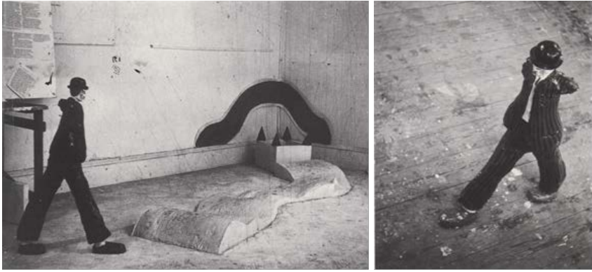
Figure 2 - Walking Man and Plaster Path (at the West of England College of Art, Bristol), 1965, Richard Long (born 1945). © Richard Long / SODRAC (2013).