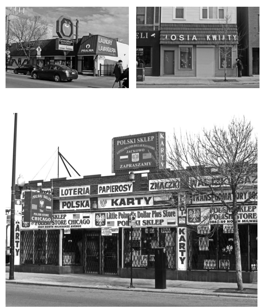
Fig. 3 - The top left picture shows the Czerwone Jabluszko Restaurant ("The Red Apple"), a long-standing Jackowo institution that offers an all-you-can-eat buffet of Polish fare. It is attached to a laundromat that is labeled in English, Polish, and Spanish. The top-right picture shows the aging storefront of Zosia Kwiaty ("Zosia Flowers"). The bottom picture shows the Polski Sklep ("The Polish Store," or perhaps "Little Poland's Dollar Plus Store" as the sign above the door would have it). Inside one can buy numerous products with Poland's colors (white and red) and the Polish white eagle insignia. The store also sells telephone cards, cigarettes, and stamps.

corner of Milwaukee and Belmont Avenues, which is the epicenter of Jackowo . This is the site where male immigrant day-laborers stand in the mornings waiting to be picked up by contractors and others who need short-term employees. Polish men wait together with men from other post-communist countries, as well as with Latinos and other immigrants. These kinds of day-laborer pick-up spots are a familiar