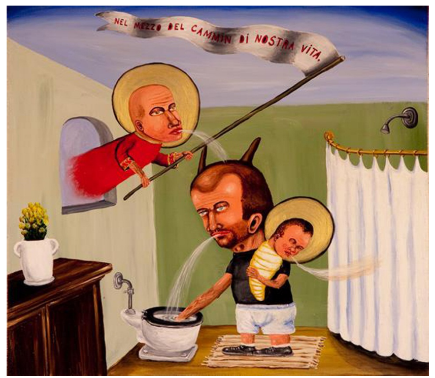
Fig. 4 - Fred Stonehouse, Untitled (1988)

comic book-inflected. But in either case I am my primary audience. First and foremost I have to entertain myself.