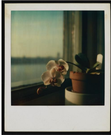
Fig. 7. Flower arrangement #2, Polaroid photograph from Ralph Ellison Collection, Courtesy of the Library of Congress.