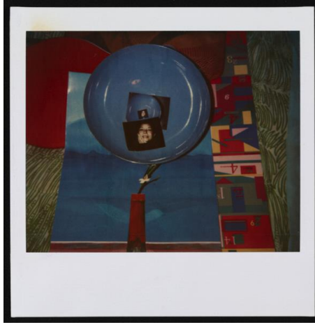
Fig. 5. Photo-montage, Polaroid photograph from Ralph Ellison Collection, Courtesy of the Library of Congress.

One can see in Ellison's Polaroid photographs these theoretical concepts at work. A burlesque of the nature photography genre, an image of a dead woodpecker [Fig. 4] both self-reflexively dramatizes the "mortifying" gaze of the camera and equates the Polaroid object of the dead bird with the dead bird itself, all the while reminding the viewer that the literal translation of "still life" in many languages is "dead nature." Such collapsing of photographic subject and photo-object continues in Ellison's photo-montage, which contains images of Fanny that have been clipped—decontextualized—from larger photographs that once contained them [Fig. 5]. Here, the human subject is not only rendered as an object, but also put into another context. Literally served upon a plate in a flattened composition, the subject of these images become an object objectively objectified; a meta-commentary not only on photo-materiality, but also on photography and death.