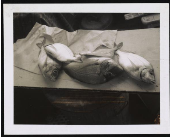
Fig. 1. Four fishes, Polaroid photograph from Ralph Ellison Collection

Just like in Chapter Thirteen of Invisible Man when the novel's unnamed protagonist stumbles upon the belongings of an elderly couple being evicted from their Harlem home, McIntyre's feeling of being confronted by a "collection of things" reveals the degree to which he is unable to process the temporal chaos that lives within the pattern of his historical certainties. To McIntyre, the heterogeneous durations and virtual temporalities represented by the objects in Rockmore's home violate his sense of majoritarian order and the history that underwrites it, hence his unconscious association of government power with whiteness and temporal order. What eludes McIntyre's conscious thought should not escape ours, however: McIntyre's dedication to identity—in this case national identity and the whiteness with which it is equated—obscures the difference that lurks behind every identity. Rockmore's "museum" is where this difference proliferates.