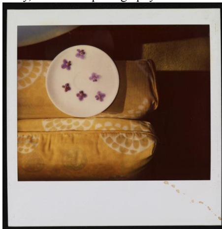
Fig. 6. Flower arrangement #1, Polaroid photograph from Ralph Ellison Collection, Courtesy of the Library of Congress.

One can see in Ellison's Polaroid photographs these theoretical concepts at work. A burlesque of the nature photography genre, an image of a dead woodpecker [Fig. 4] both self-reflexively dramatizes the "mortifying" gaze of the camera and equates the Polaroid object of the dead bird with the dead bird itself, all the while reminding the viewer that the literal translation of "still life" in many languages is "dead nature." Such collapsing of photographic subject and photo-object continues in Ellison's photo-montage, which contains images of Fanny that have been clipped—decontextualized—from larger photographs that once contained them [Fig. 5]. Here, the human subject is not only rendered as an object, but also put into another context. Literally served upon a plate in a flattened composition, the subject of these images become an object objectively objectified; a meta-commentary not only on photo-materiality, but also on photography and death.