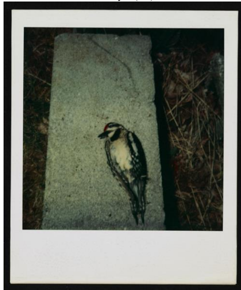
Fig. 4. Dead woodpecker, Polaroid photograph from Ralph Ellison Collection, Courtesy of the Library of Congress.

should read Ellison's collection of object-oriented Polaroids as a declaration of the multiplicity of temporalities inherent in duration. To Ellison, objects, not just subjects, are alive with vitality—a Bergsonian notion adopted by Deleuze that subtends posthumanism and object-oriented ontology alike. This vitality, which confounds both the Invisible Man and McIntyre, is inseparable from the heterogeneity of time and the process of becoming. In short, Ellison's proto-posthumanist Polaroids are the photographic equivalents of the elderly couple's belongings heaped on the curb in Invisible Man and the artifacts assembled at Jessie Rockmore's in Three Days . They force the viewer to abandon the temporality that subtends progressive history and experience instead the intensities of durational difference that emerge between him- or herself and the viewed objects—a difference that multiplies with each image and unfolds in irreversible time. They also collectively articulate an antidote to what Laura Wexler describes as “the subject/object dichotomies produced by a white power of looking” reinscribed by both McIntyre and Sunraider in Three Days (90).