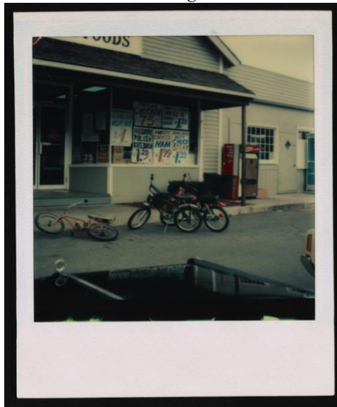
Fig. 3. Charlottesville, Polaroid photograph from Ralph Ellison Collection, Courtesy of the Library of Congress.

Reviewing Ralph Ellison’s Polaroid archive can make one feel, at first, like McIntyre plunging into Rockmore’s parlor, for what one encounters is a collection consisting of hundreds of images of things . Of the 1261 Polaroid photographs in the Ralph Ellison collection housed in the Prints and Photographs Division of the Library of Congress, all of which were taken between 1966 and Ellison’s death in 1994, fewer than 150 depict human subjects. The dearth of people in Ellison’s Polaroid compositions becomes more glaring when one considers that nearly half of the peopled Polaroids—71 to be exact—are of Ellison during those rare occasions when the camera was handed over to his wife Fanny (or rent from his hands) to document family gatherings, functions in which Ellison participated, etc. The rest were taken by Ellison himself. Unlike his early work in portraiture and street photography in which human subjects dominate, these Polaroids predominantly feature still life and abstract compositions, with occasional unpeopled landscapes and snapshots of inanimate objects (see Figs. 1-3). And then there’s the fact that the more than eleven hundred object-oriented Polaroid photographs Ellison produced are, from a photo-materialist standpoint, things in and of themselves. How does one begin to think about such a collection of things ?