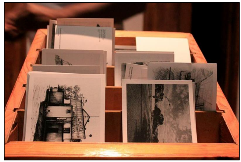
Figure 4, Image of postcards, "I wish you were here" postcards, dually exhibited at Delta Gallery in Harare, ZW (2014) and Public Pool in Hamtramck, Detroit (1013) during ZCCD's exhibit Kumusha