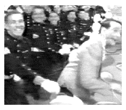
Figure 19 - Marine playfully gooses Pee-wee.

multi-sexual, polymorphously endowed company of players, who visit Pee-wee for Yuletide cheer. This singular and provocative grouping merits a brief pictorial review. It is a veritable who's who of kitschy, camp, U.S. celebrity, including Frankie Avalon, Annette Funicello, Whoopi Goldberg, Earvin "Magic" Johnson, and kd lang. Note the juxtaposition of clean-cut X-mas symbolism (each star ringed by a holly wreath) with ironic camp lurking there on the fringes - Avalon, lang, and Goldberg. The