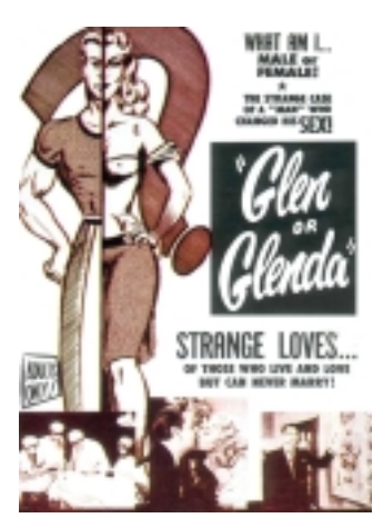
Figure 24 - Glen or Glenda?

This essay ends by reflecting upon a labyrinth of reflection: Reubens returned to the silver screen after his masturbation scandal in the role of the Penguin's evil and heartless father in Batman Returns (1992). The film, the second in the recent Batman series, was directed by Tim Burton, who also directed, more recently, Ed Wood , a bio-documentary about a famous bad filmmaker and, not incidentally, a transvestite (played admirably enough by the somewhat handsome, always half-shaved Johnny Depp). One of Wood's first feature films was Glen or Glenda , also known as I Led Two Lives (1953). The movie