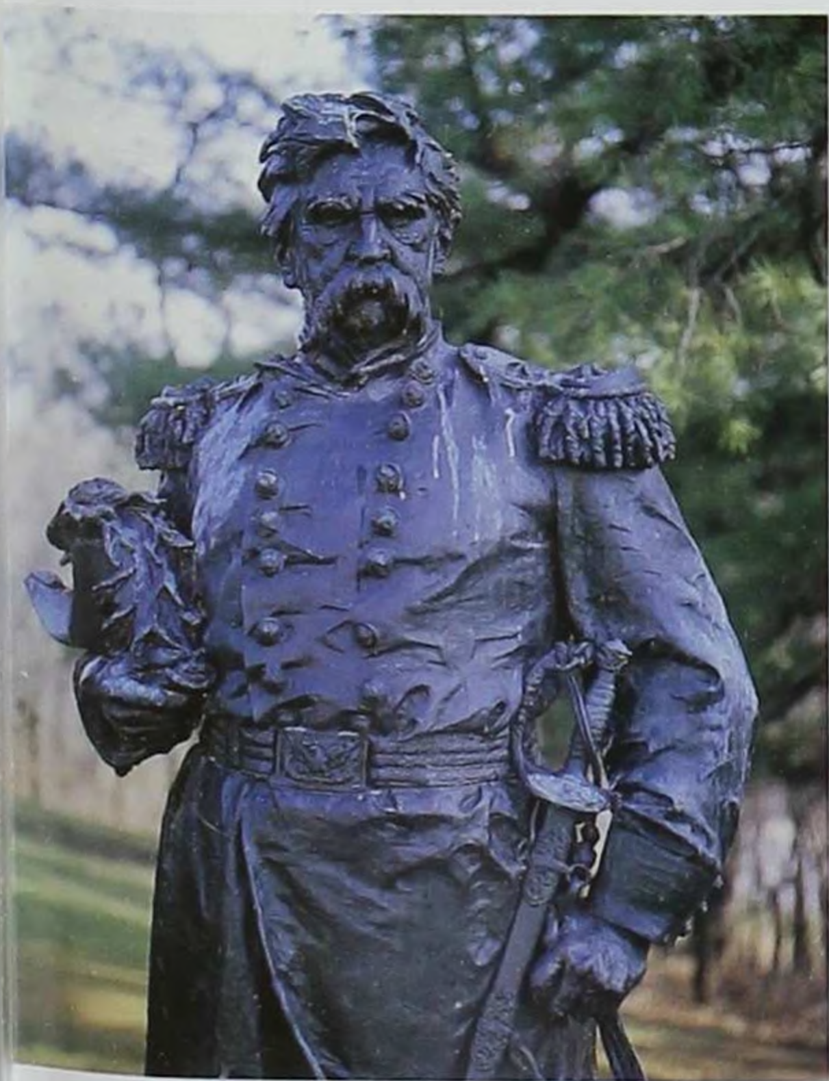
This bronze of General Grenville Dodge is one of four Civil War statues on the grounds of Montauk.

Originally these four pieces stood in front of the main façade of the Iowa Building at the exposition. (Larrabee reportedly spent more on the Iowa Building than did the state