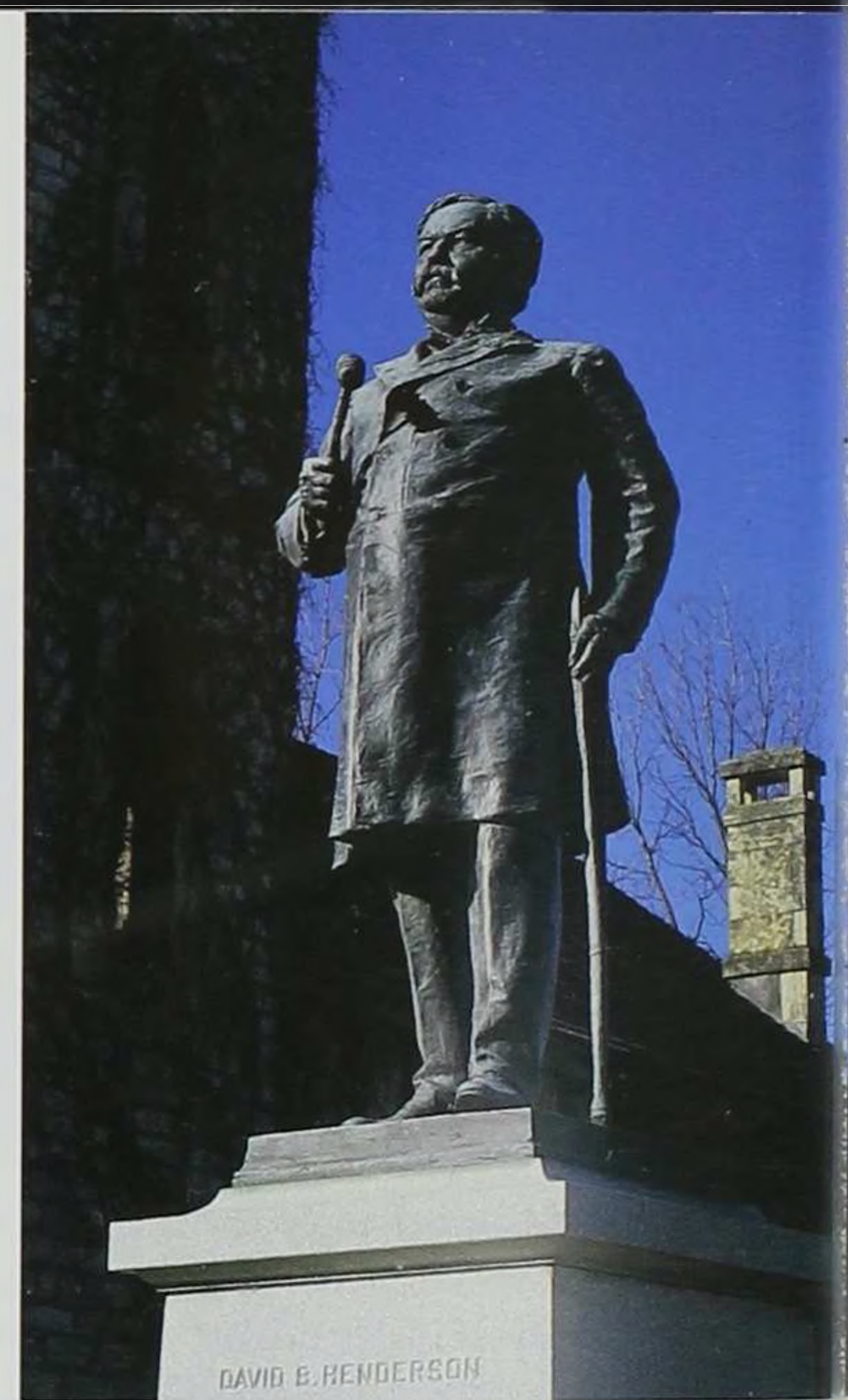
Rhind's statue of Governor Larrabee's close friend David B. Henderson (Speaker of the U.S. House of Representatives) stands in Clermont.

By the 1890s he had become a nationally recognized artist, with works in three New York City parks, the Metropolitan Museum, Boston's Museum of Fine Arts, and the rotunda of the Library of Congress. A founding member of the National Sculpture Society, Bissell was also a participating sculptor in the famous