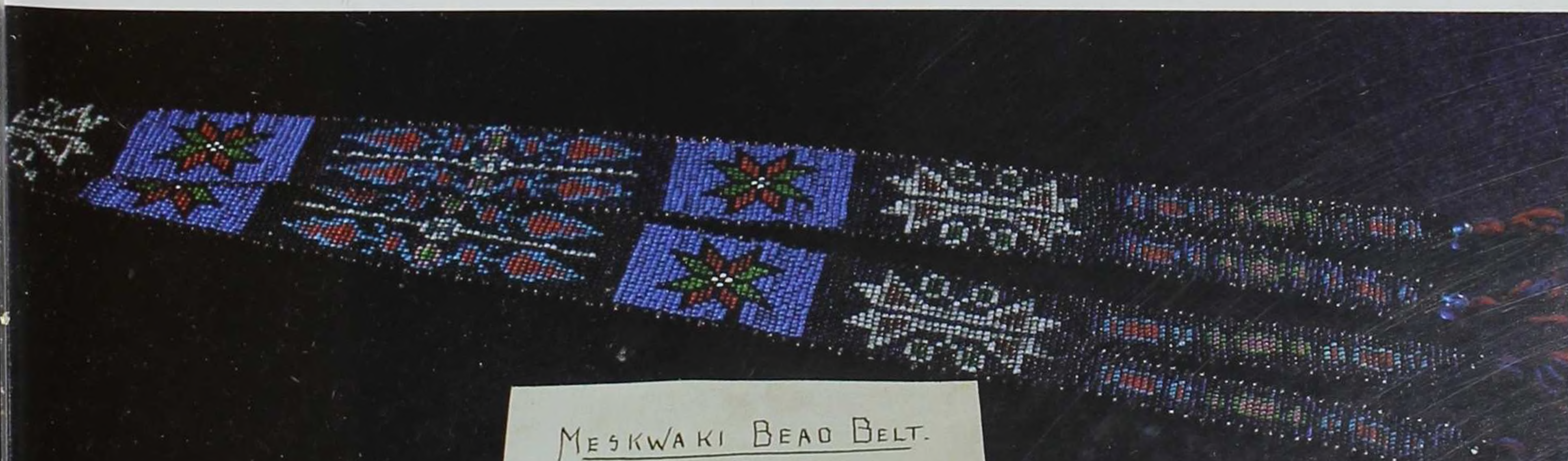
MESKWAKI BEAD BELT. MADE BY CHIHIKA [WIFE OF WHITE BREAST] OBTAINED BY DUREN J.H. WARD FOR STATE HISTORICAL SOCIETY 1905