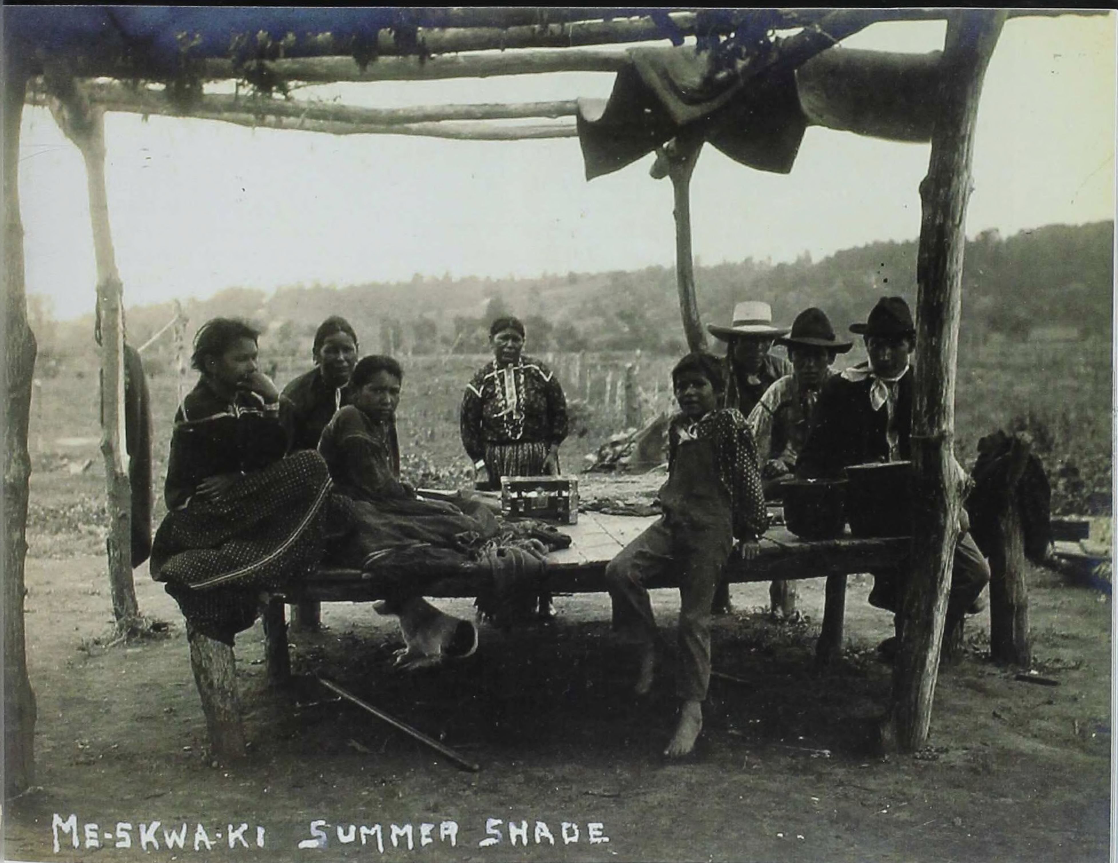
ME-SKWA-KI SUMMER SHADE

these were covered with bark, the rest constructed of rush matting. Usually from twelve to twenty-five feet in width, the wikiups could be as long as forty feet or as short as fifteen.