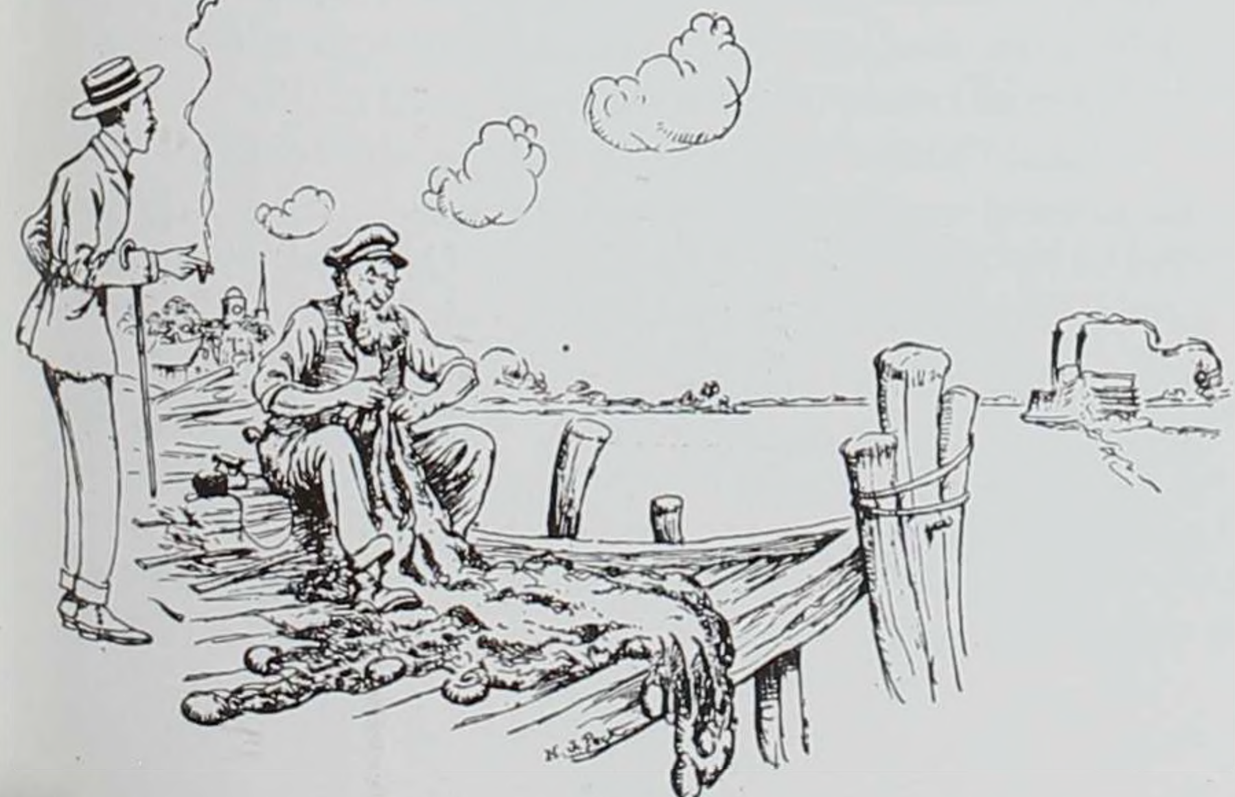
A SUN-ROUGHENED OLD CODGER SITTING ON A PILE OF LATH

"And two days after he got her opened up," said the