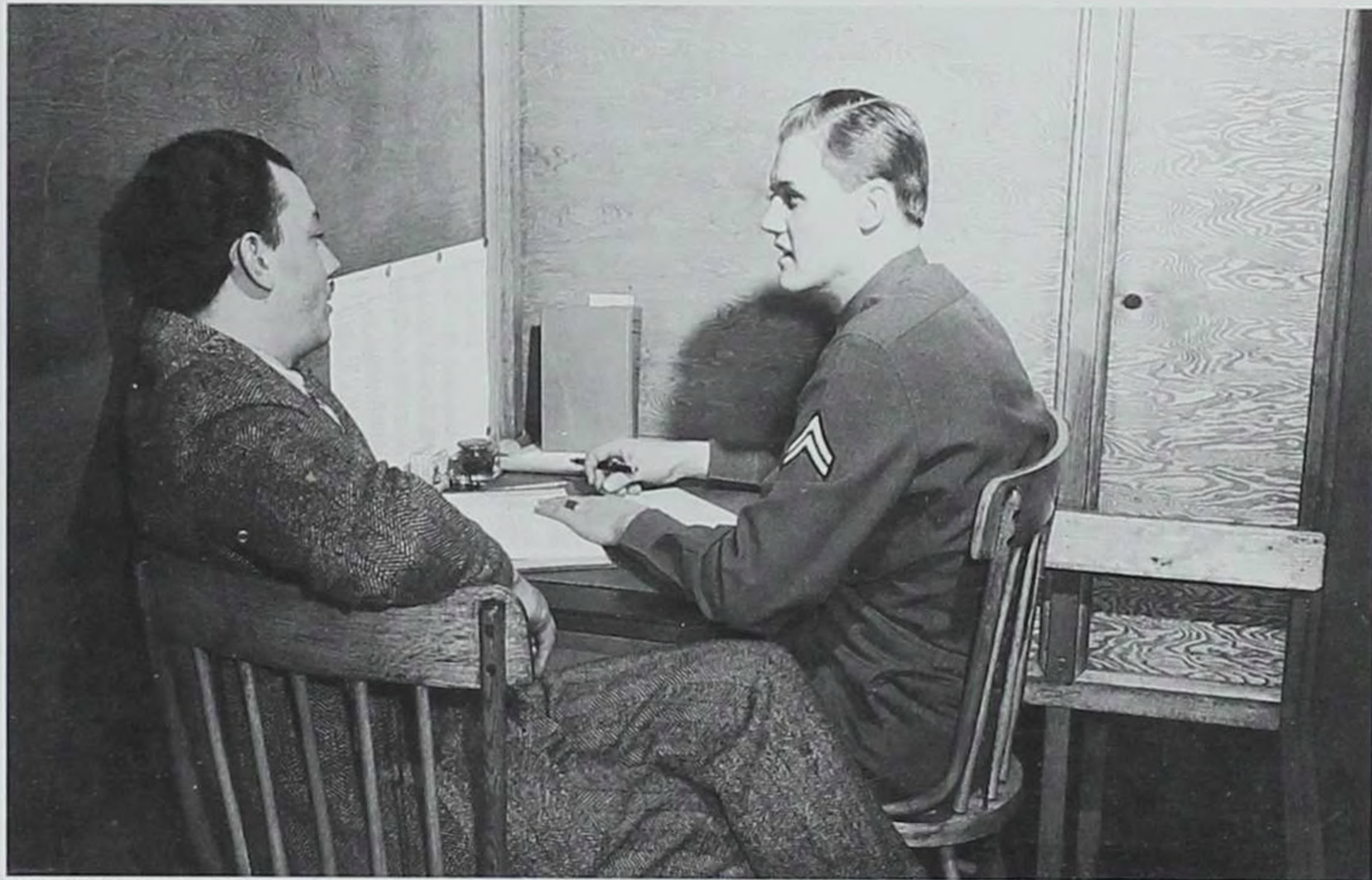
SHSI (IOWA CITY): WPA COLLECTION

February 2, 1942: New soldiers are sworn in at the induction center at Fort Des Moines.