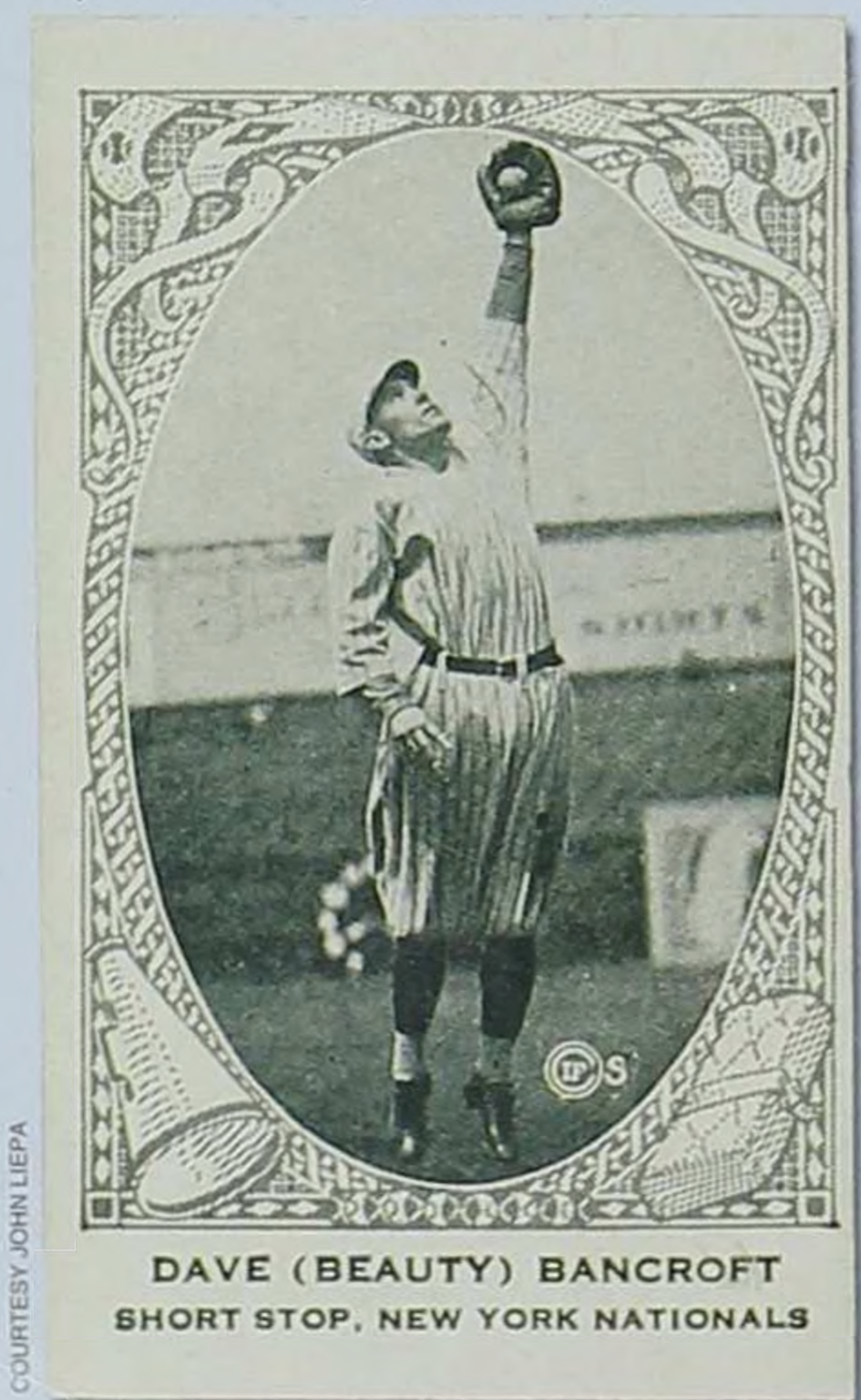
David J. "Beauty" Bancroft: b. 4-20-1891, Sioux City; d. 10-9-1972, Superior, Wisconsin. Philadelphia Phillies in 1915; then played with three other teams through 1930. Player-manager with Boston Braves, 1924-1927. Elected to Baseball Hall of Fame, 1971. (Portrayed on 1922 strip card. W573)