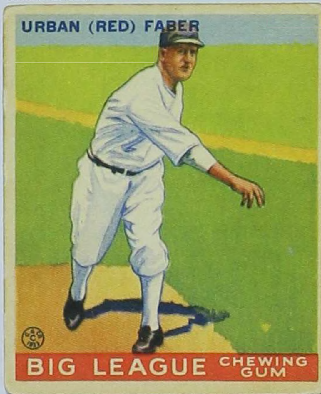
Urban "Red" Faber: b. 9-6-1888, Cascade; d. 9-25-1976, Chicago. Right-handed pitcher for Chicago White Sox, 1914-1933. Won 254 games in career. Elected to Baseball Hall of Fame, 1964. (Portrayed on 1933 Goudey Gum Co., Big League Chewing Gum baseball card. R319)