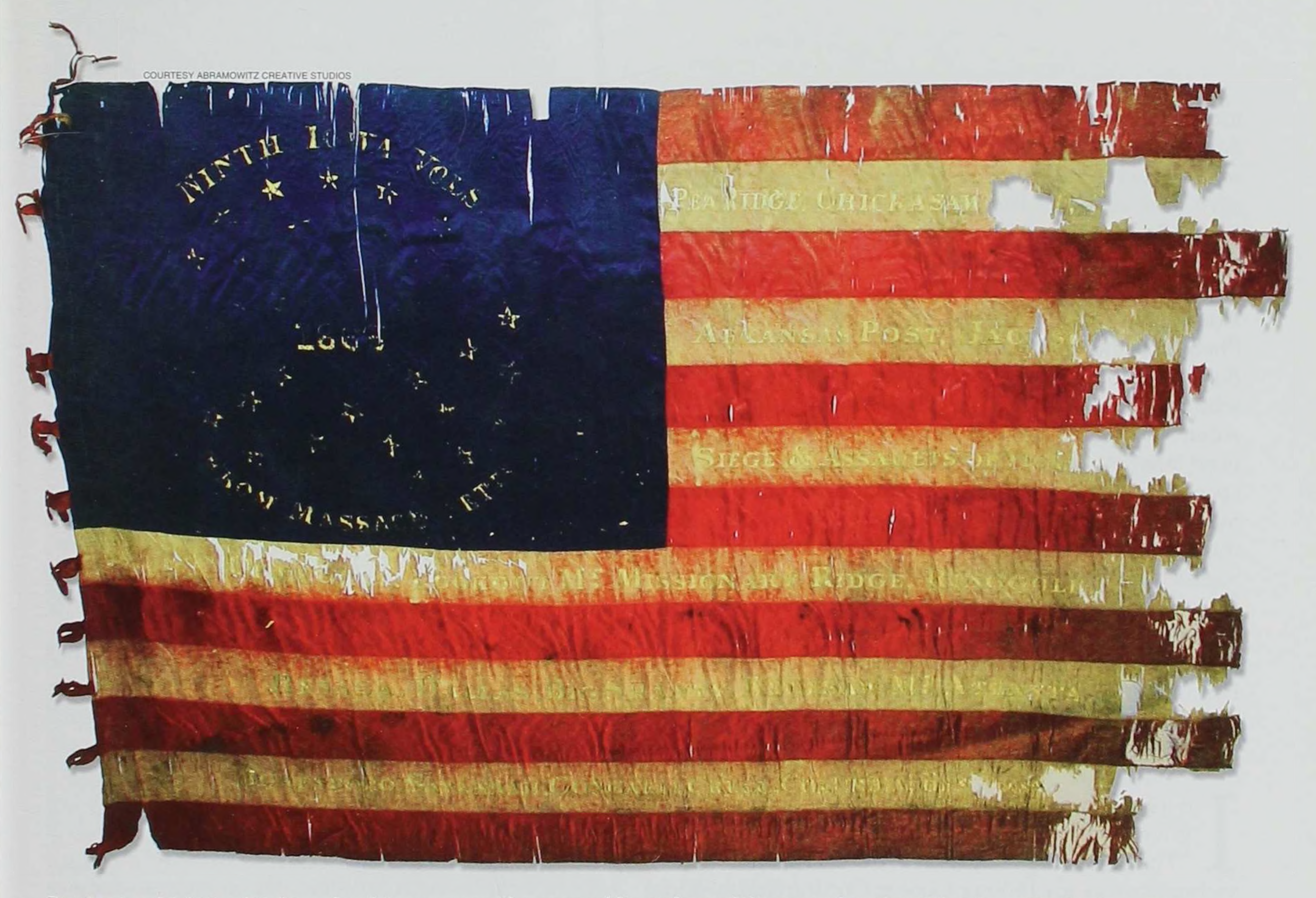
Battles in which the 9th lowa fought appear on the once white stripes of the second national flag from the Boston women.

rest. It is to us, and we trust it will be to you, the emblem of the eternal union, cemented by the best blood of patriots."