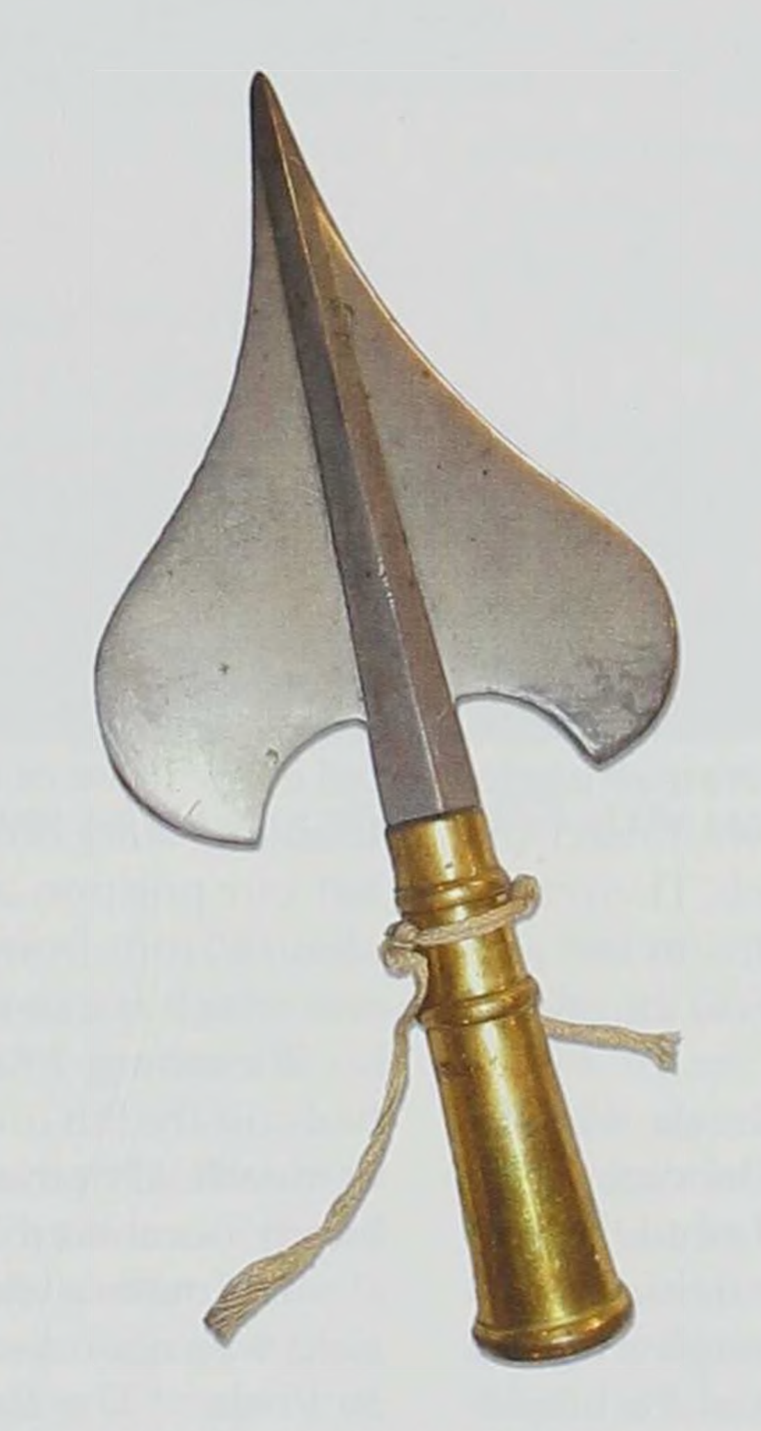
The finial from the 9th lowa's battle flag.

Adam continued, "Nothing could have had a better effect on the regiment than this gift. The men were much dispirited by their continual privations, and, as many of them, like myself, have never seen a paper in which their conduct at Pea Ridge received anything but the ordinary newspaper praise bestowed on the whole army, the poor fellows are surprised and delighted to