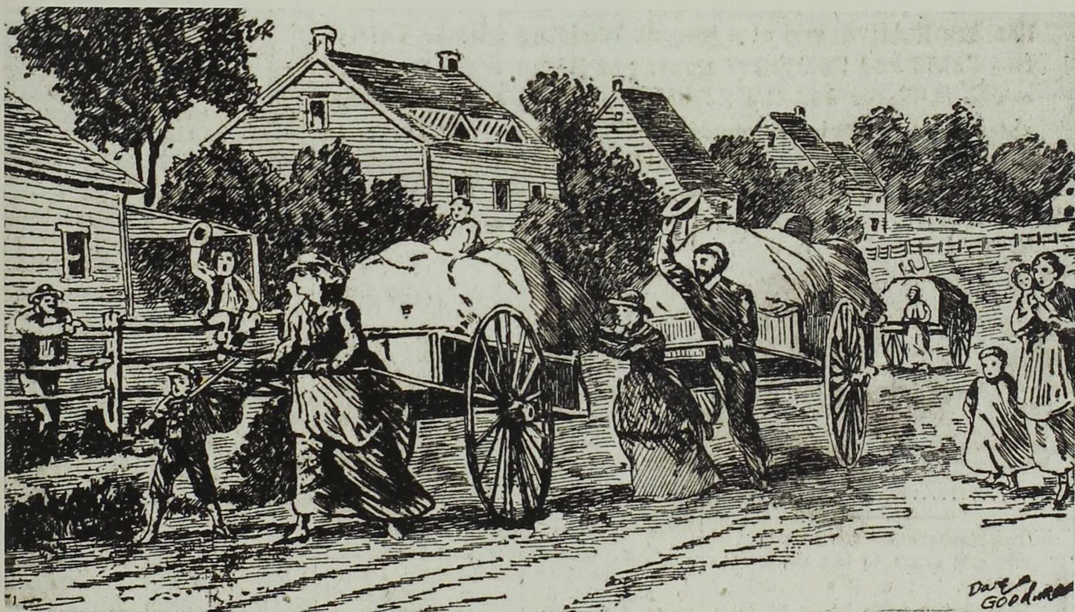
T. B. H. STENHOUSE, ROCKY MOUNTAIN SAINTS (NEW YORK, 1873)

As the handcart companies crossed Iowa, they were watched by residents; some were curious, some helpful, some hostile.