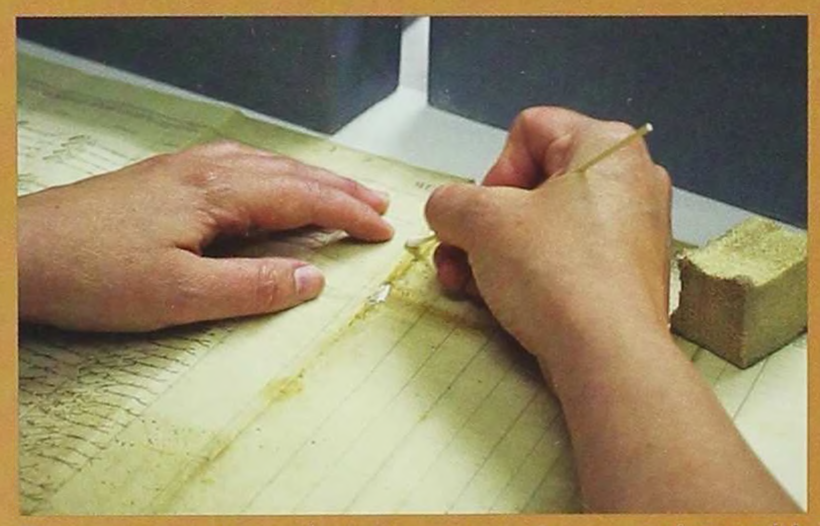
To remove creases, the conservator dampens them with cotton swaps and then weights them down.