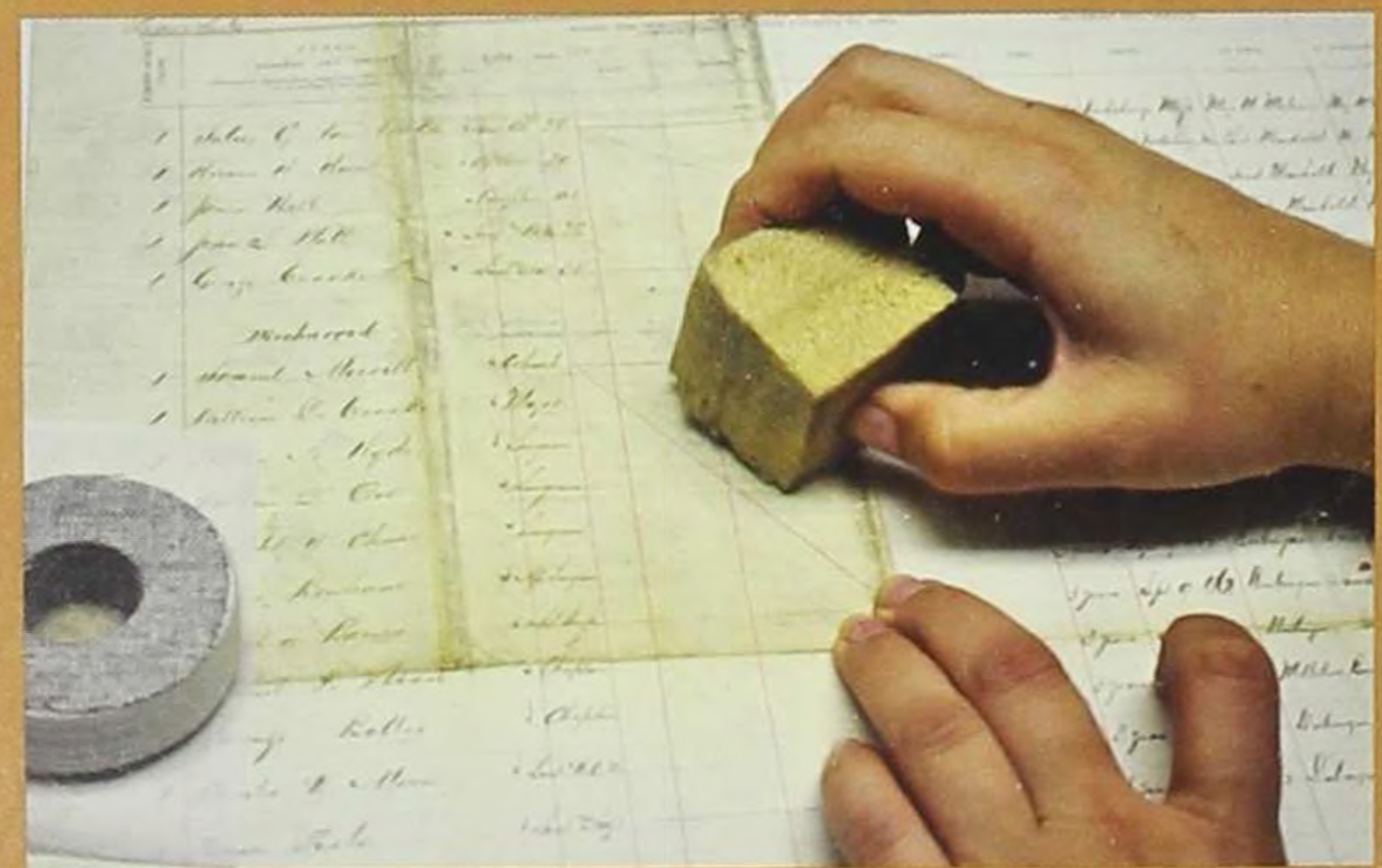
Surface dirt is removed with a dry, non-abrasive sponge made of natural rubber.