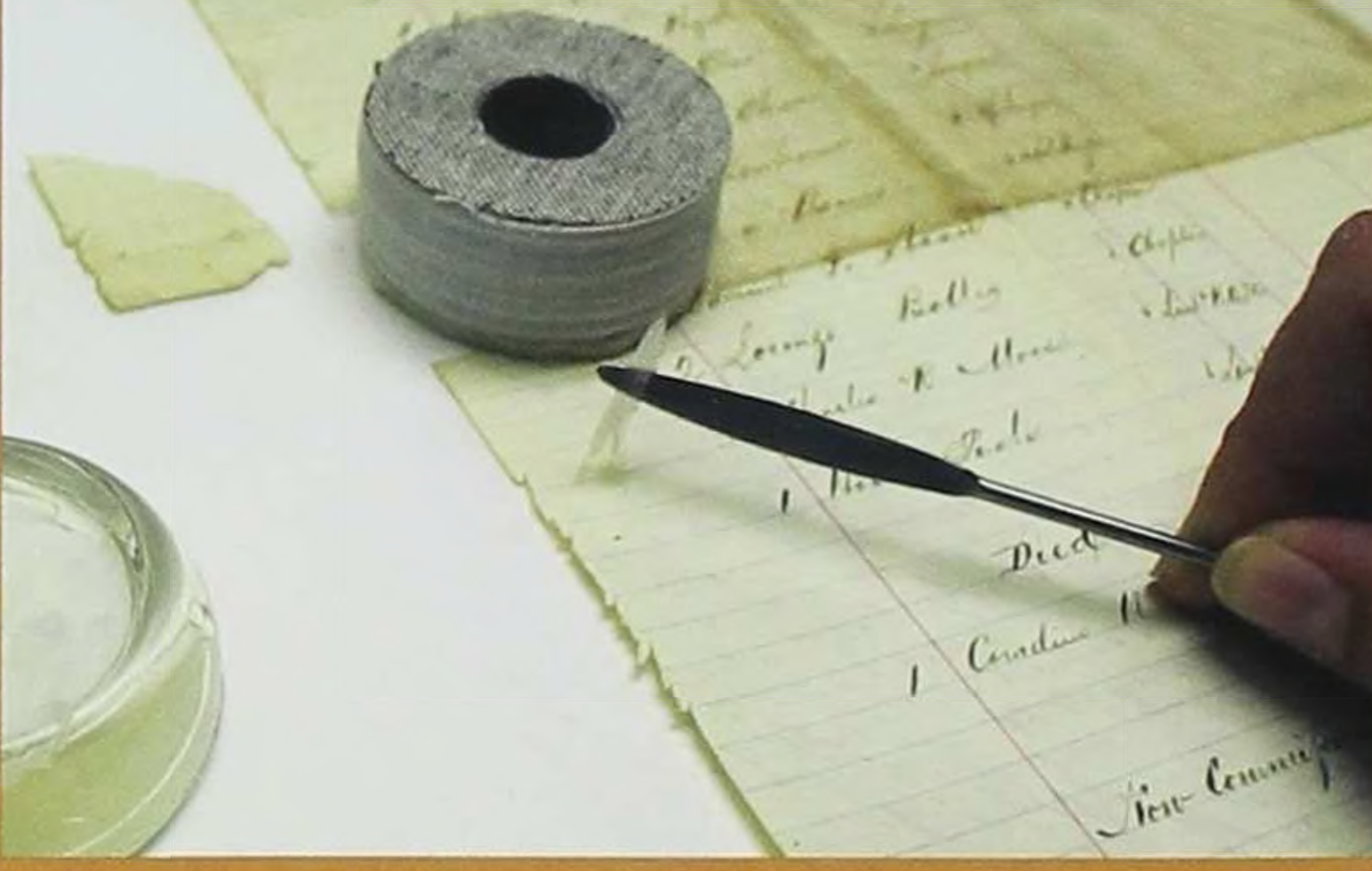
Thin but strong Japanese paper and wheat paste are used for repairing tears and reattaching fragments.