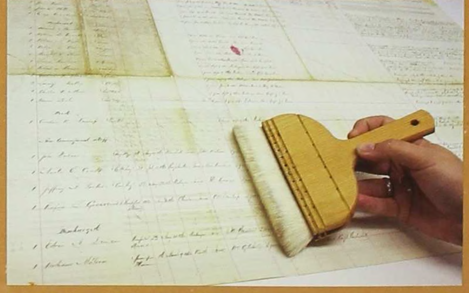
An alkaline solution is applied by brush or spray to neutralize destructive acids and extend the life of the document.