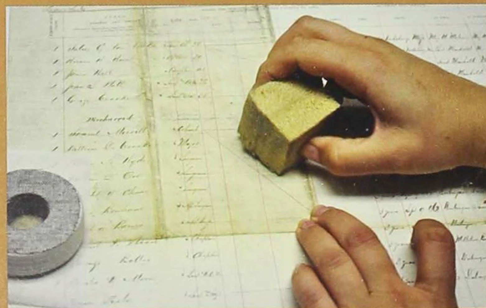
Surface dirt is removed with a dry, non-abrasive sponge made of natural rubber.