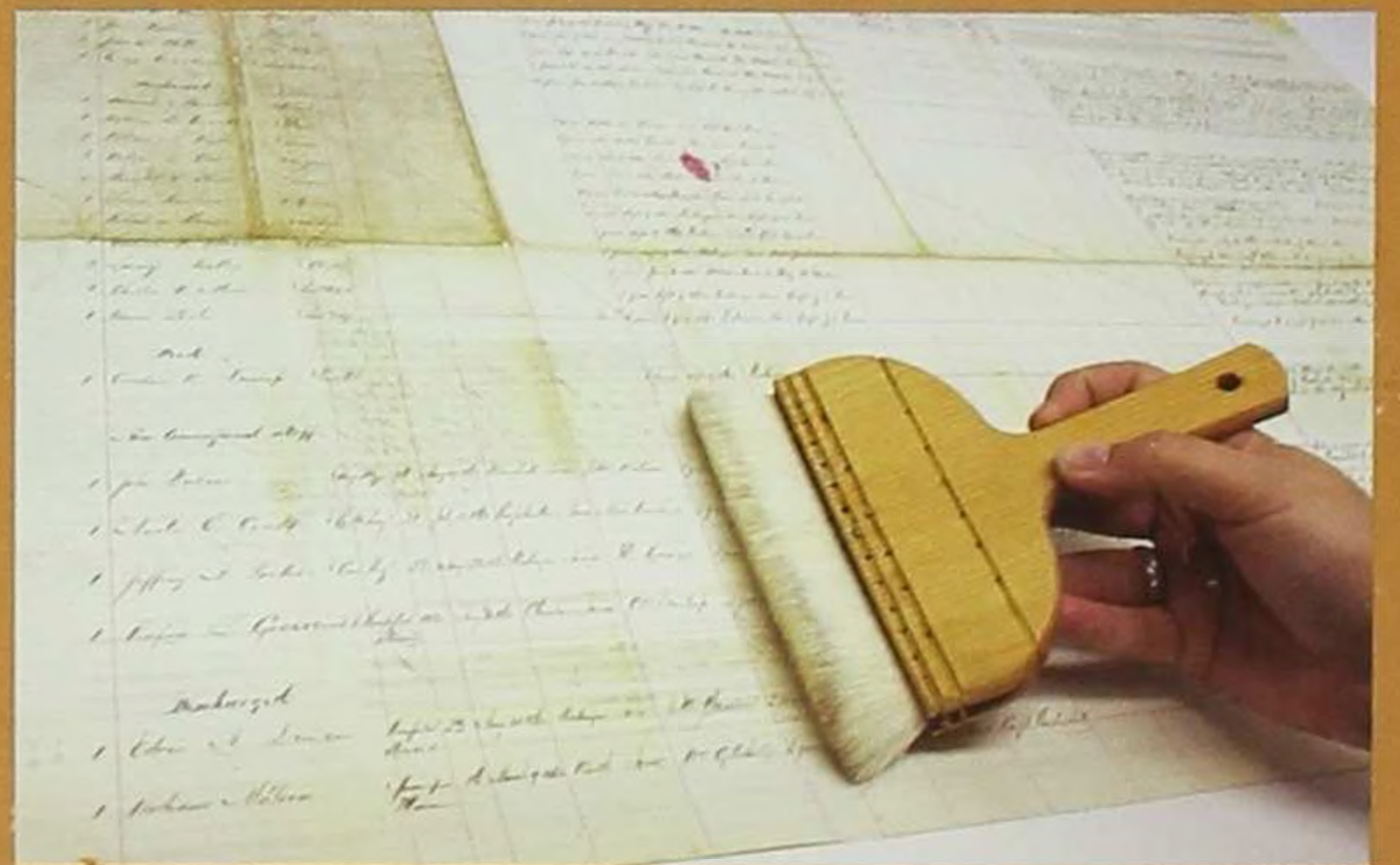
An alkaline solution is applied by brush or spray to neutralize destructive acids and extend the life of the document.