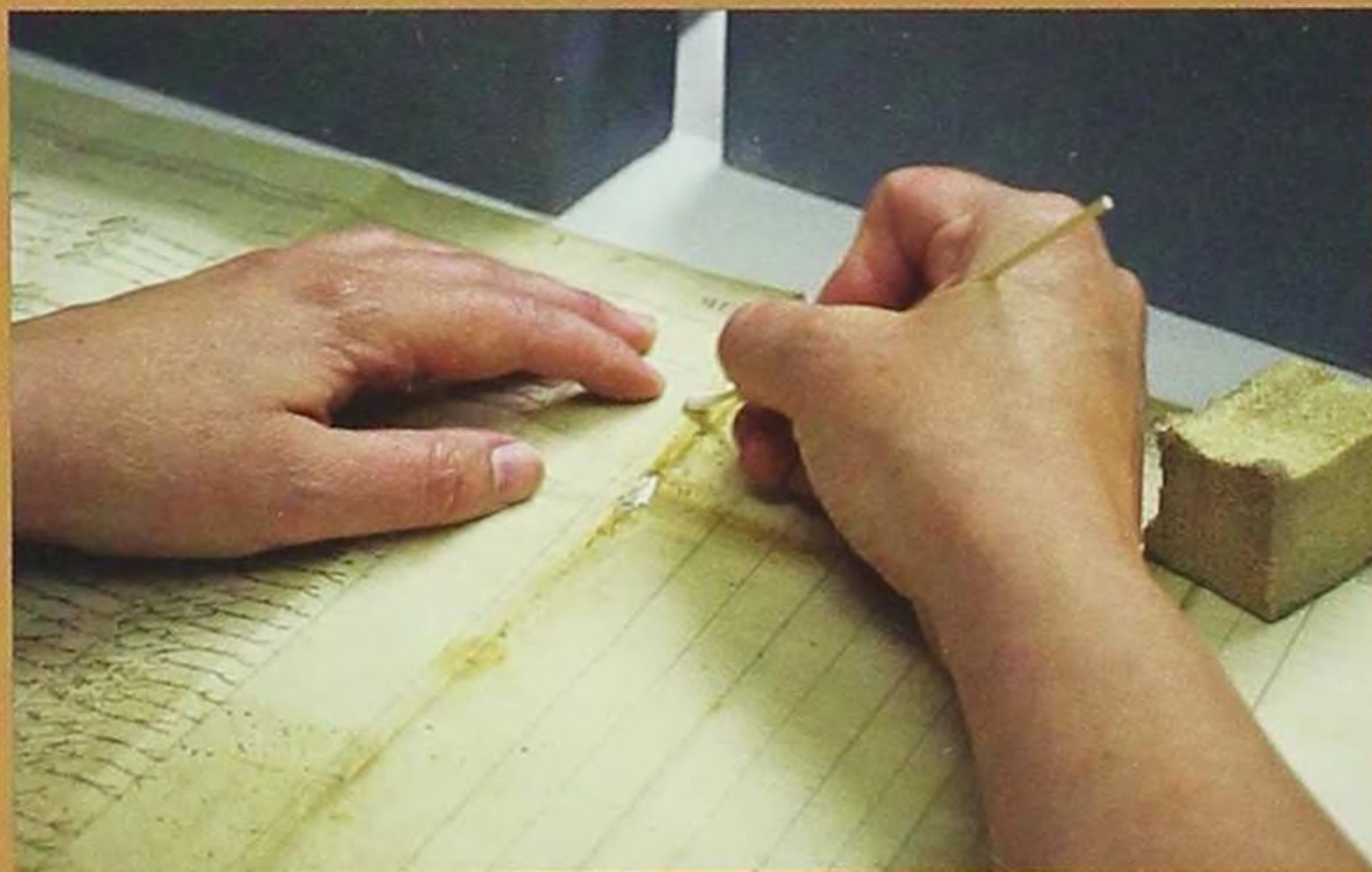
To remove creases, the conservator dampens them with cotton swabs and then weights them down.