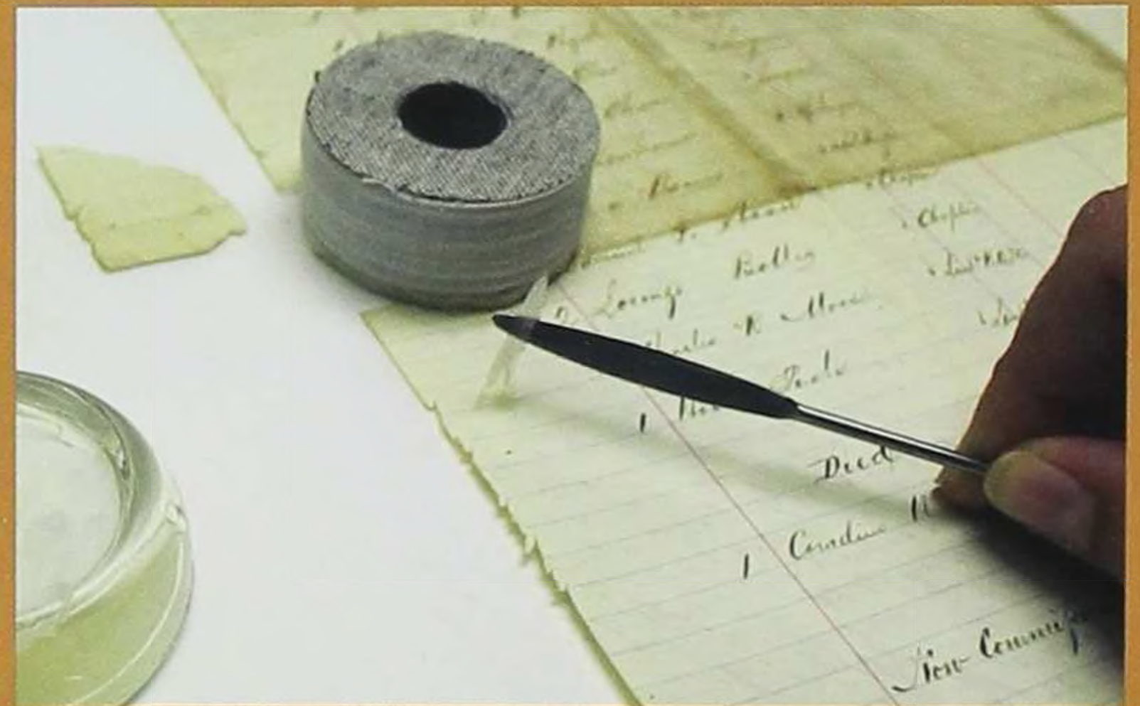
Thin but strong Japanese paper and wheat paste are used for repairing tears and reattaching fragments.