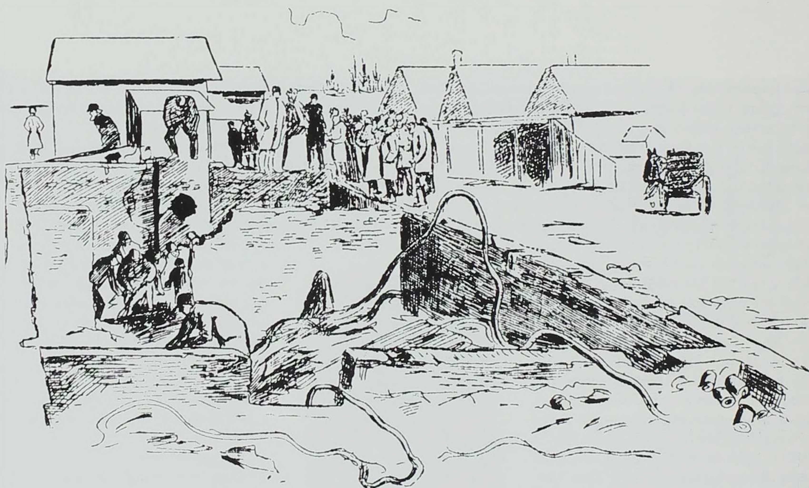
"Searching for the other body in basement ruins." Two days after the Walford store burned down, this sketch of the scene of the fire appeared in the Cedar Rapids Gazette .