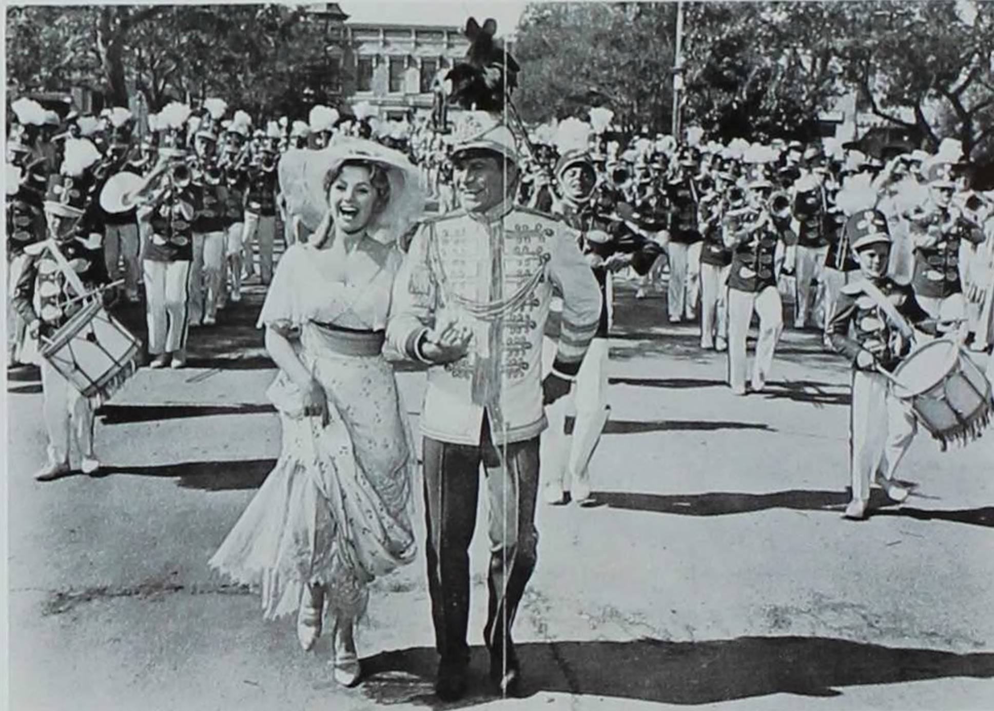
Robert Preston, Shirley Jones are Top Stars in Movie Version