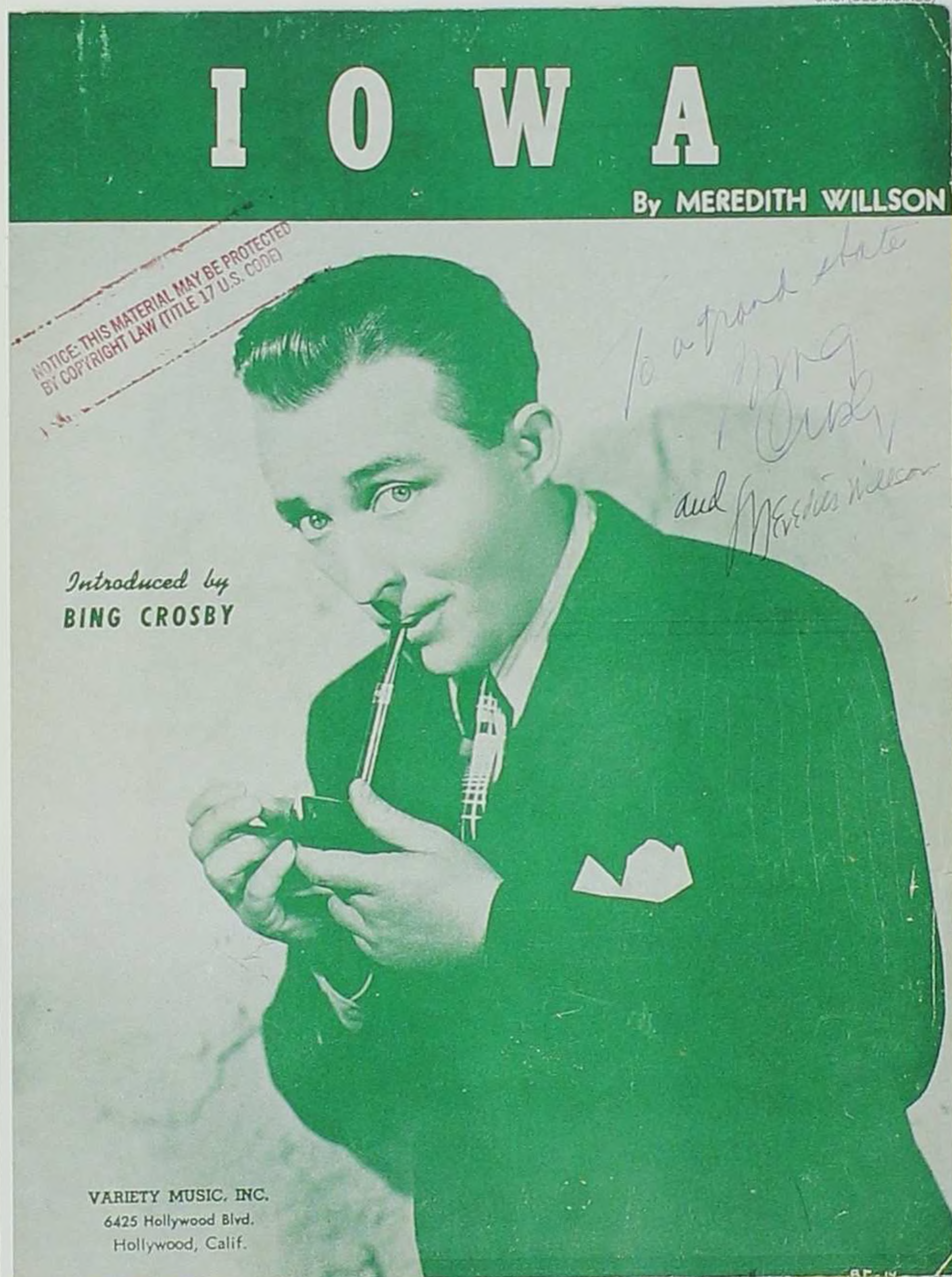
Sheet music of Willson's "Iowa" is autographed by Willson and singer Bing Crosby, who addressed it: "To a grand state."

It's the Sunday School and the old river bend; Songs on the porch after dark; It's the corner store and a penny to spend, You and your girl in the park. It's the picnic ground and the whippoorwill's call, Acorns and the dew on the lawn; It's the County fair and the Oddfellows Hall, Meeting the circus at dawn. I-o-wa, it's a beautiful name When you say it like we say it back home, It's a promise for tomorrow And a mem'ry of long, long ago. I-o-wa, what a beautiful name When you say it like we say it back home.