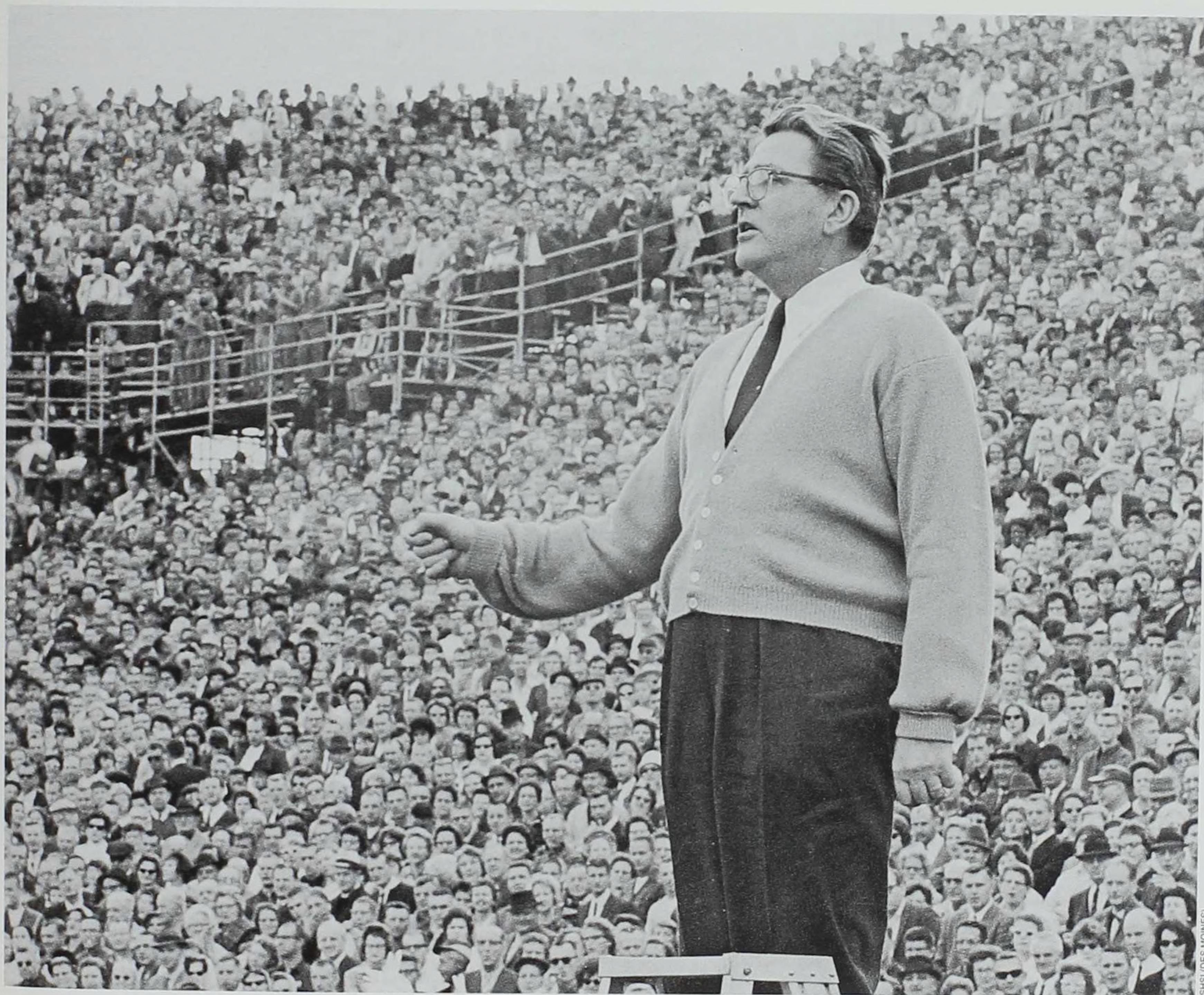
SISI (DES MOINES)