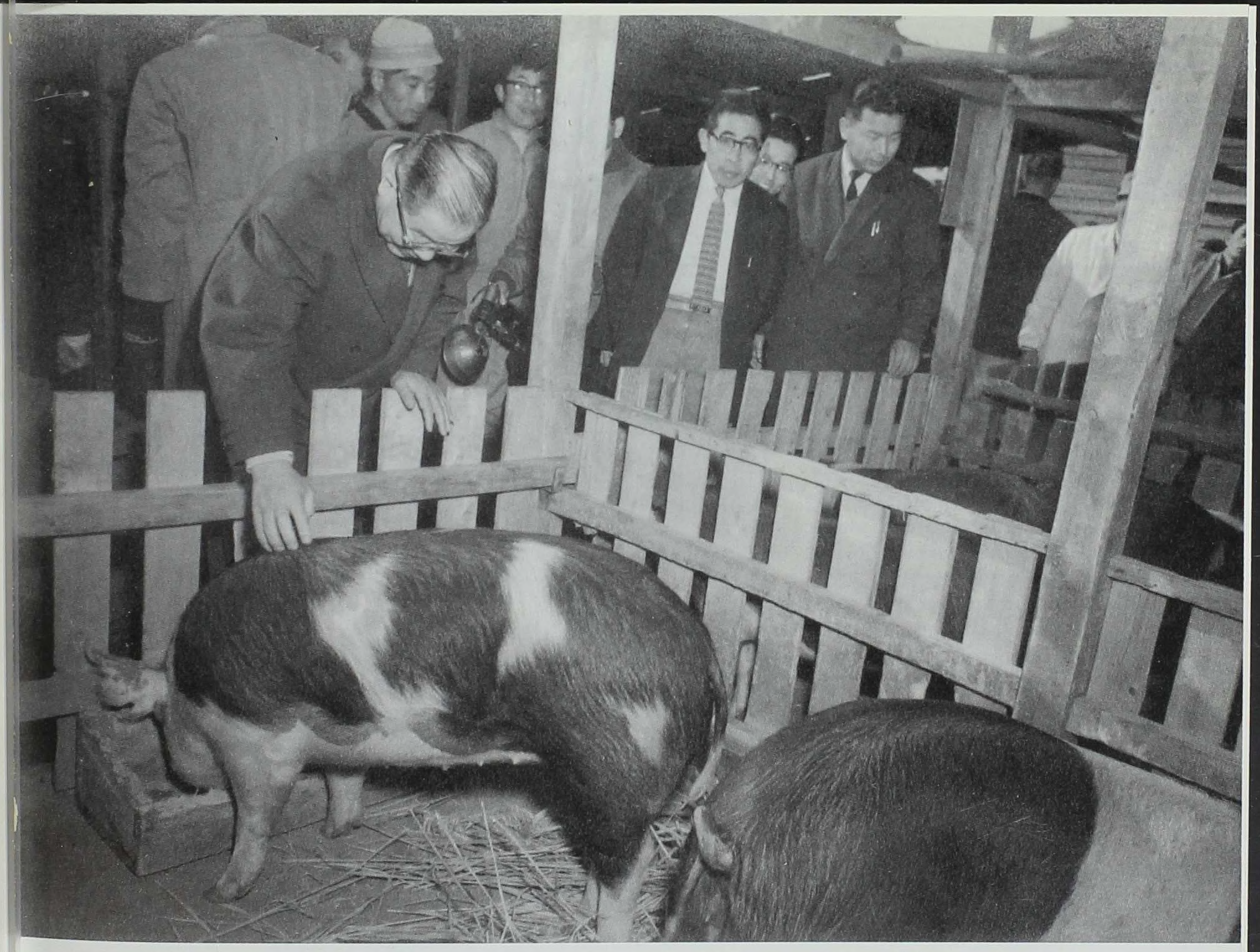
Yamanashi Governor Hisashi Amano gives a hearty pat to an Iowa hog, as dignitaries, workers, and photographers look on.

would continue to stretch across the Pacific in the years to come. That March, the Yamanashi prefectural government passed a resolution making Iowa its sister state, and Iowa followed suit later that year. The next spring, Governor Hisashi Amano visited Iowa to celebrate the relationship, and in June 1962, Yamanashi sent a gift to Iowa—also of considerable weight but of far more melodious sound than three dozen hogs. The gift was a bronze temple bell (weighing a ton and measuring four feet high) and a bellhouse (fabricated in Japan and shipped in 39 boxes for assembly here). A site south of the capitol was chosen for this "bell of friendship," as reporters called it.