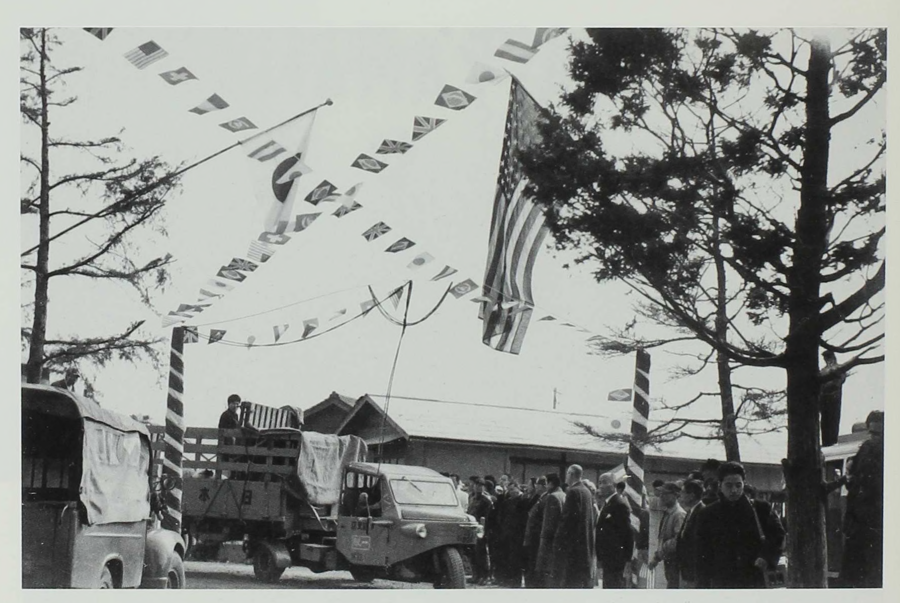
Above: Welcomed by onlookers and international flags, the Iowa hogs arrive at the breeding station in Kofu. Below: The first shipload of corn arrives in March 1960.