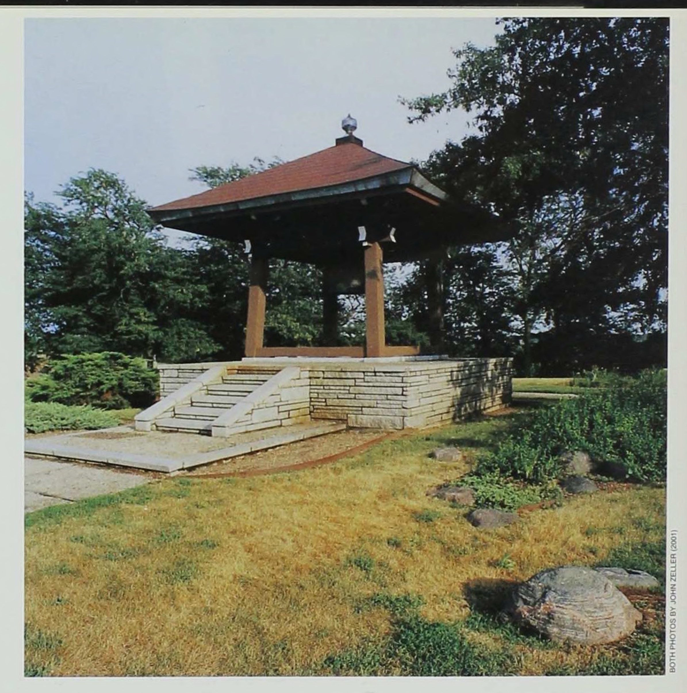
In 1962, Yamanashi sent Iowa an enormous bronze bell and bellhouse, as thanks for the 35 breeding hogs and 60,000 bushels of corn that Iowa sent the prefecture after devastating typhoons. Below: The elaborately ornamented "bell of friendship" and bellhouse were installed south of the capitol, here visible in the distance.

Ginalie Swaim is editor of Iowa Heritage Illustrated. She takes pride in her ability to use chopsticks but is still "all thumbs" at origami.