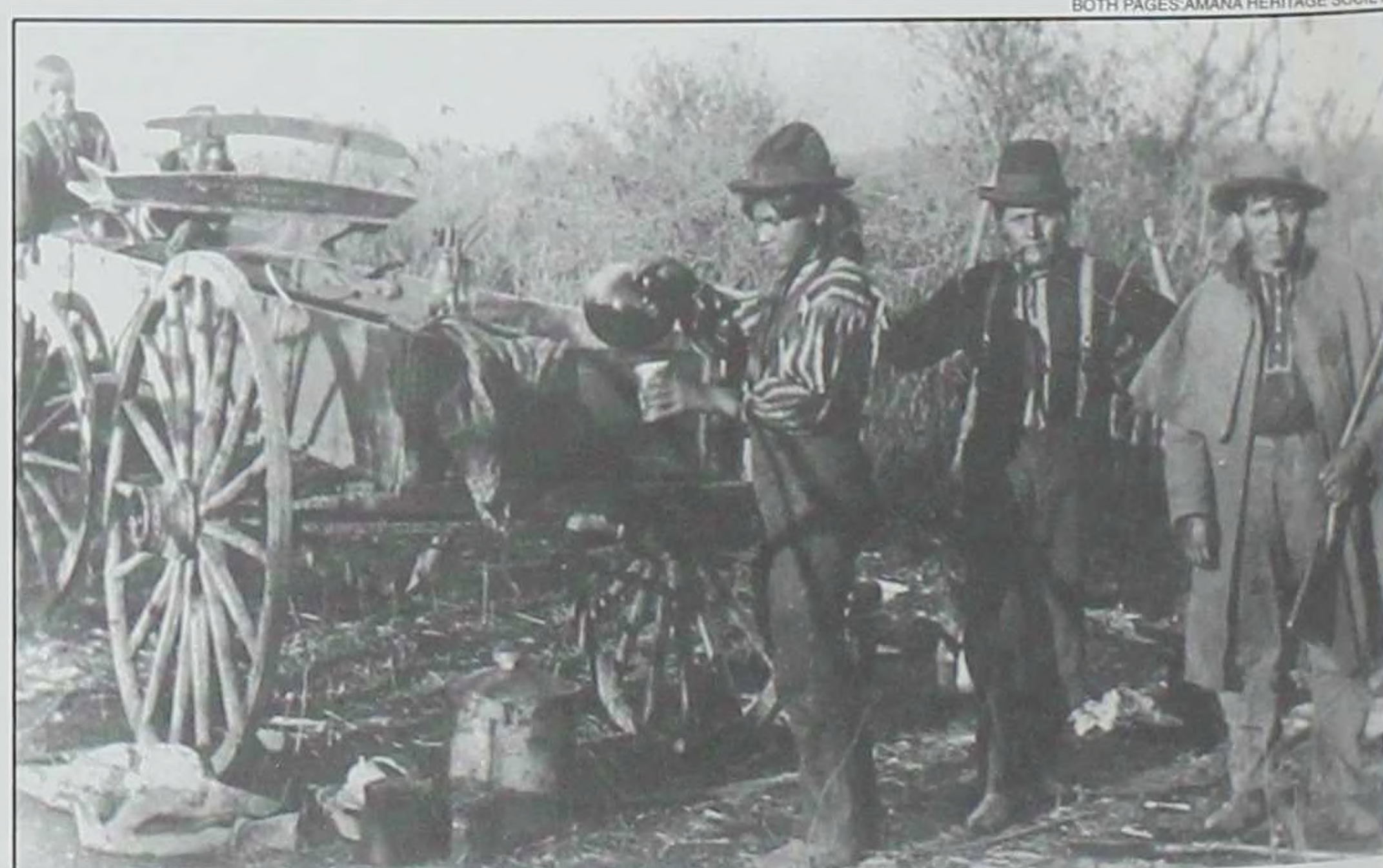
Above and right: Both the Meskwaki and Amana people relied on the land by hunting, fishing, harvesting timber, and gathering wild edibles.

T he Iowa land that the Inspirationists bought was already known to the Meskwaki; they had hunted, fished, and gathered food from the prairies, woods, and waterways as they moved into the interior of Iowa as a result of land