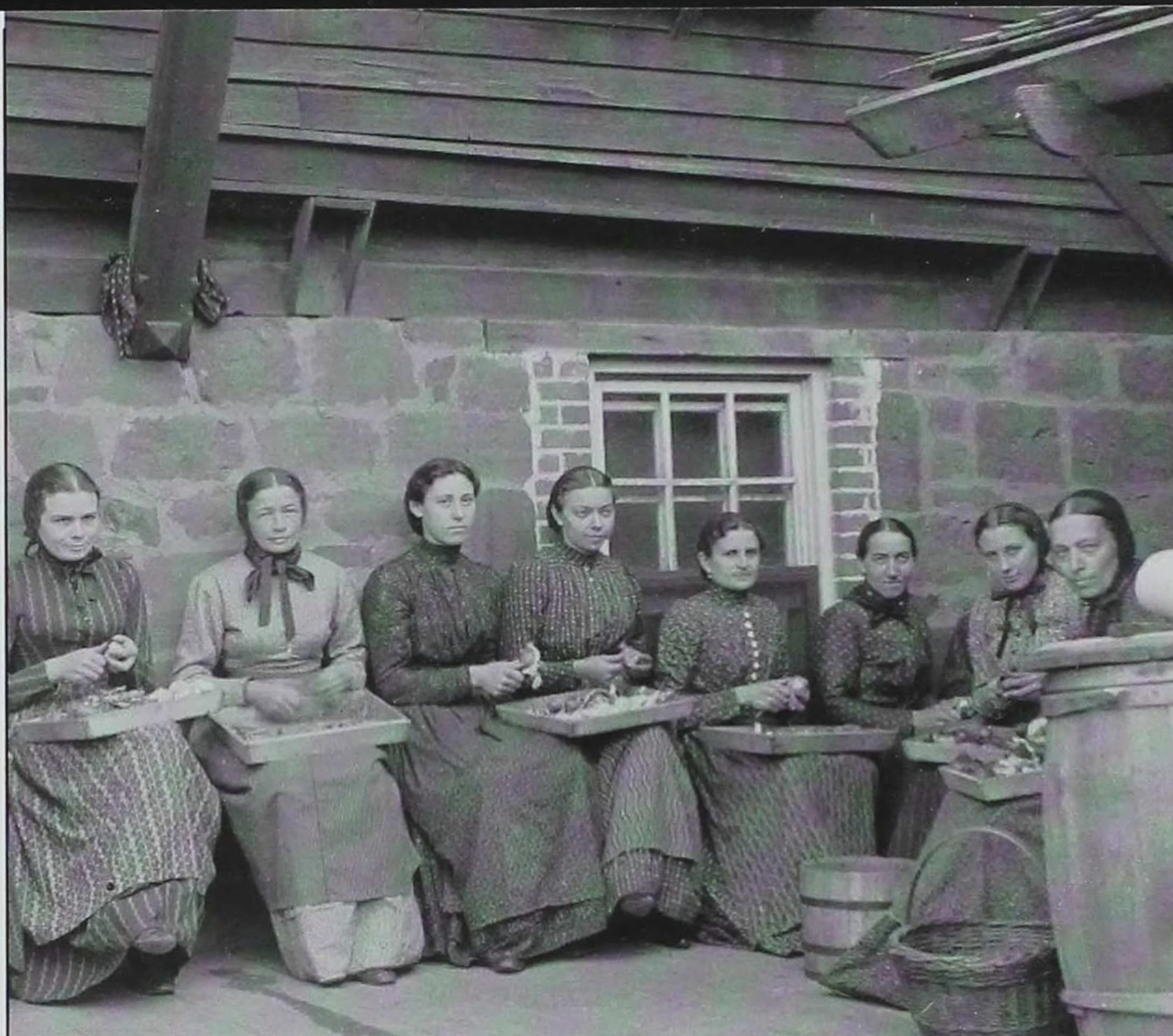
Amana kitchen workers preparing vegetables. Meskwaki and Amana women often interacted at the many kitchen houses in the villages.