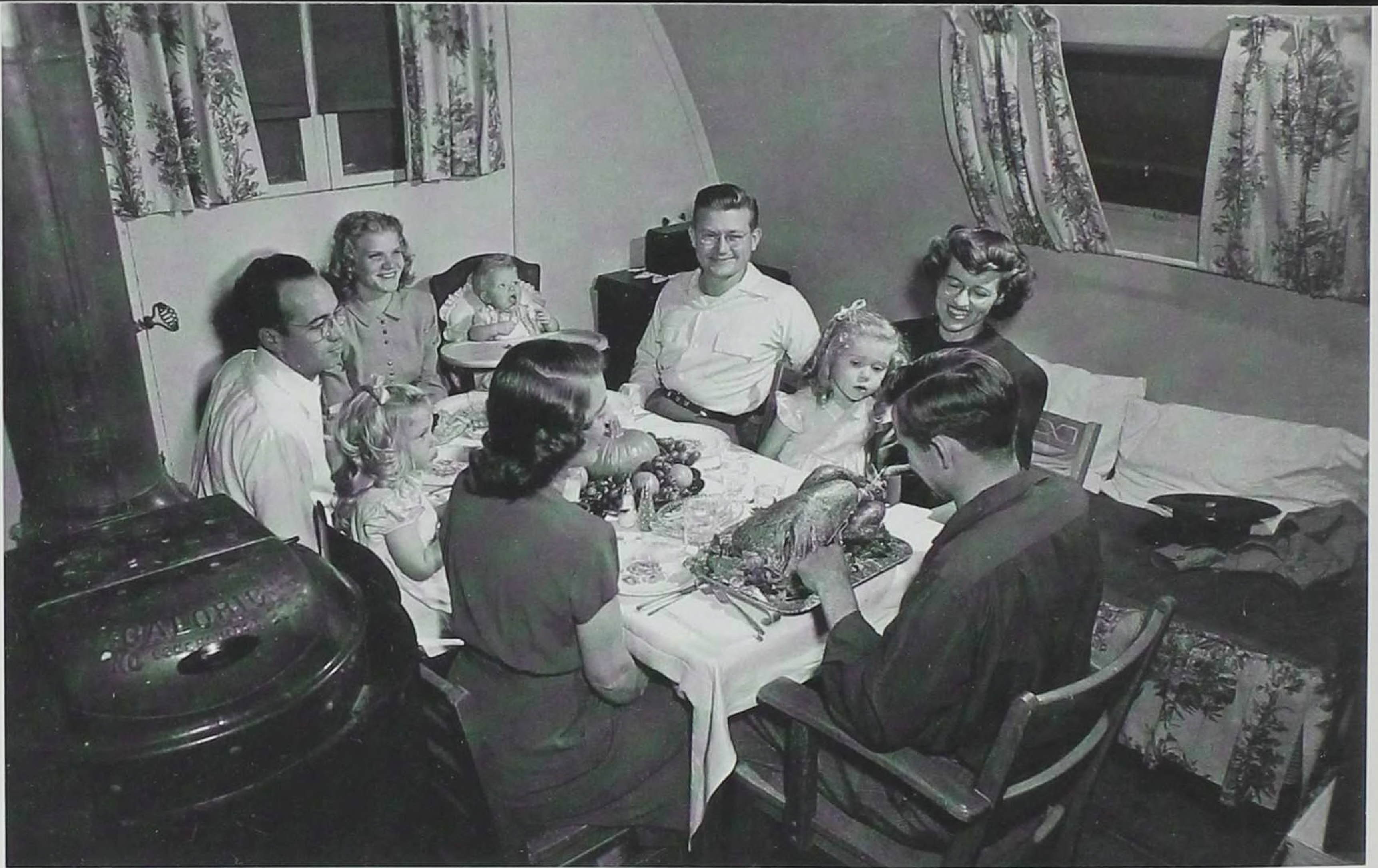
Married veterans juggled academics, families, and other demands as they established a strong sense of community in Pammel Court. The pony ride (below) was part of the May Daze activities in the spring of 1947 and was covered by Look magazine.