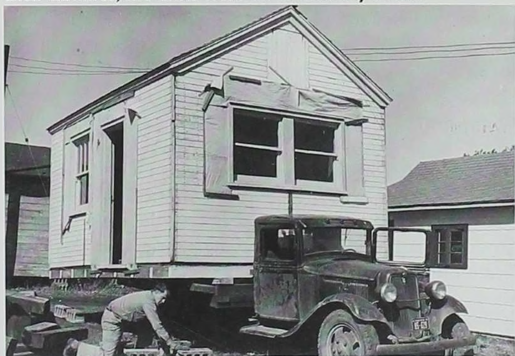
Below: Despite a variety of housing units for veterans and their families, the units were all undeniably small.