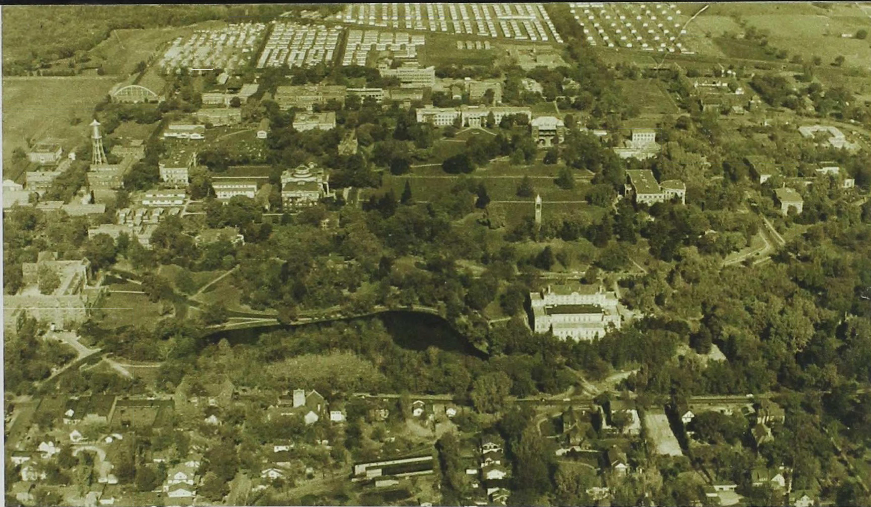
AMES HISTORICAL SOCIETY