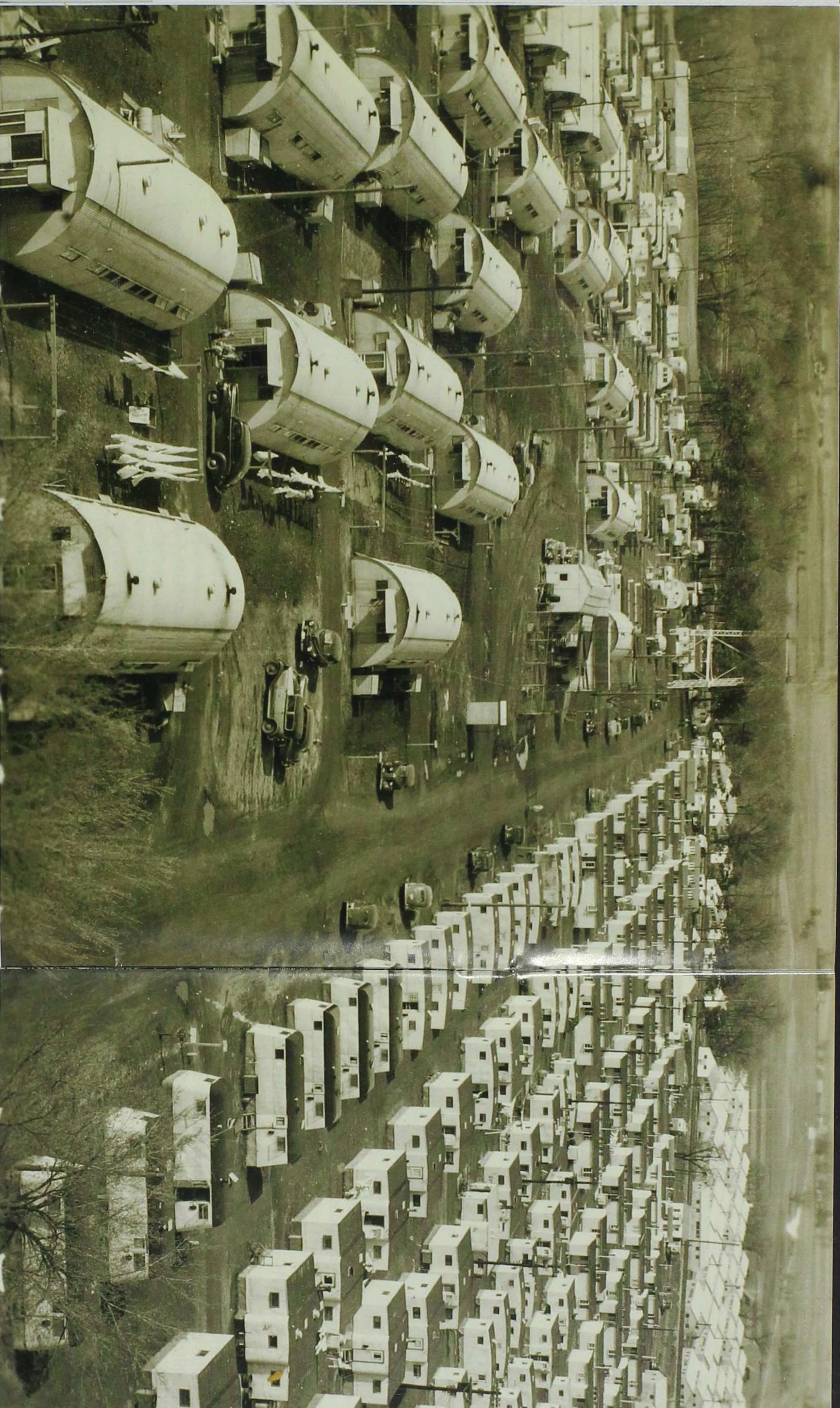
AMES HISTORICAL SOCIETY