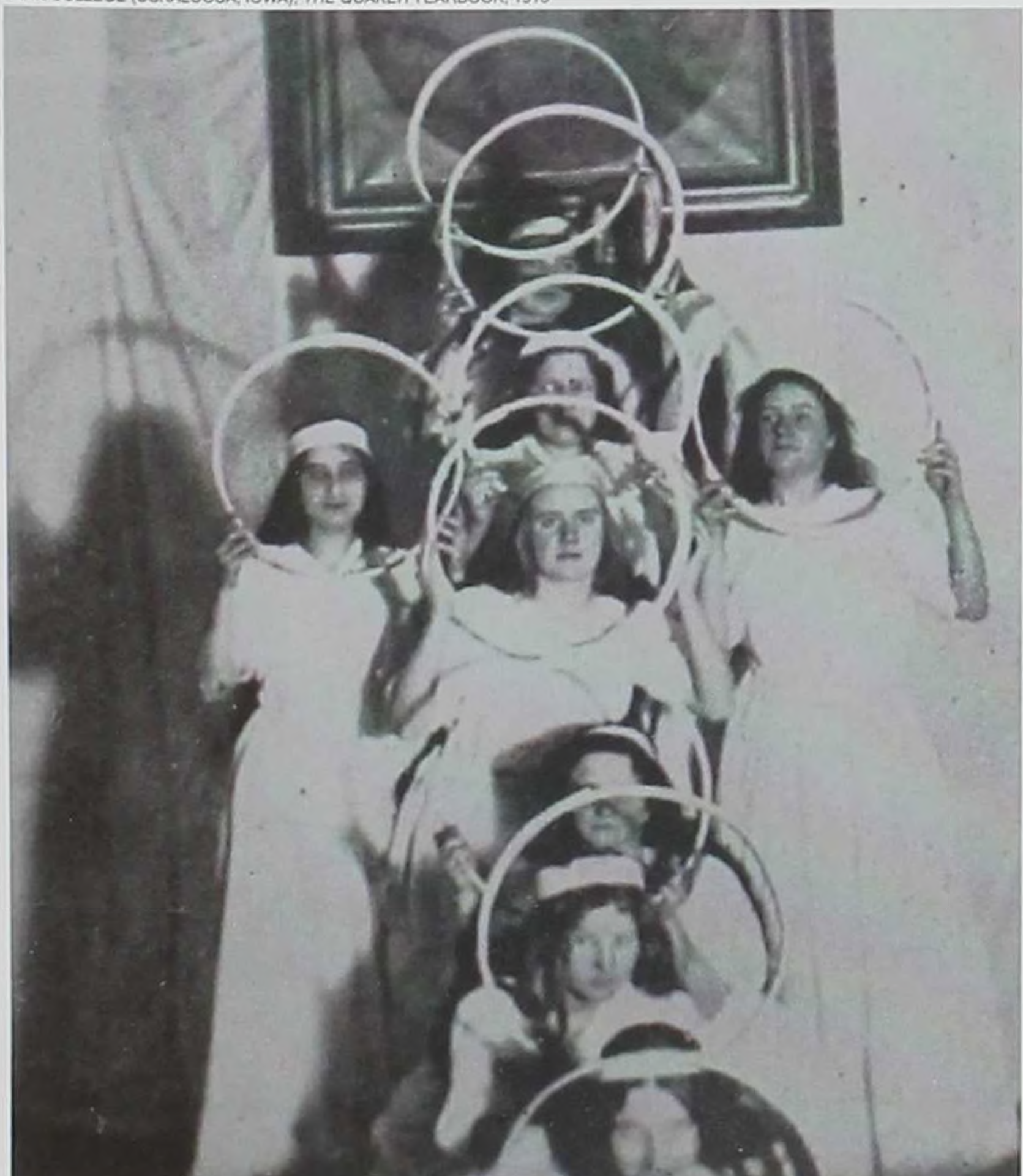
The Lowell Literary Society of Penn College's Academy in Oskaloosa performs the popular Delsarte drill "Revel of Naiads" in 1913. The tableau would have been accompanied by slow waltz music.