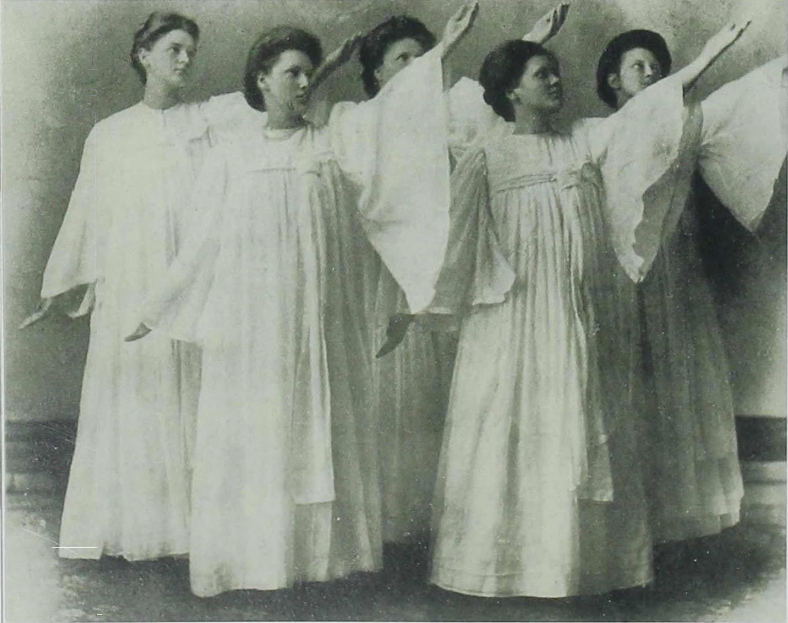
LEANDER CLARK COLLEGE (TOLEDO, IOWA), CARDINAL YEARBOOK, 1911

Well-loved songs, especially hymn tunes, were the most frequent musical accompaniment for posing. Here, students perform "Nearer My God to Thee" at Leander Clark College in Toledo, 1911.