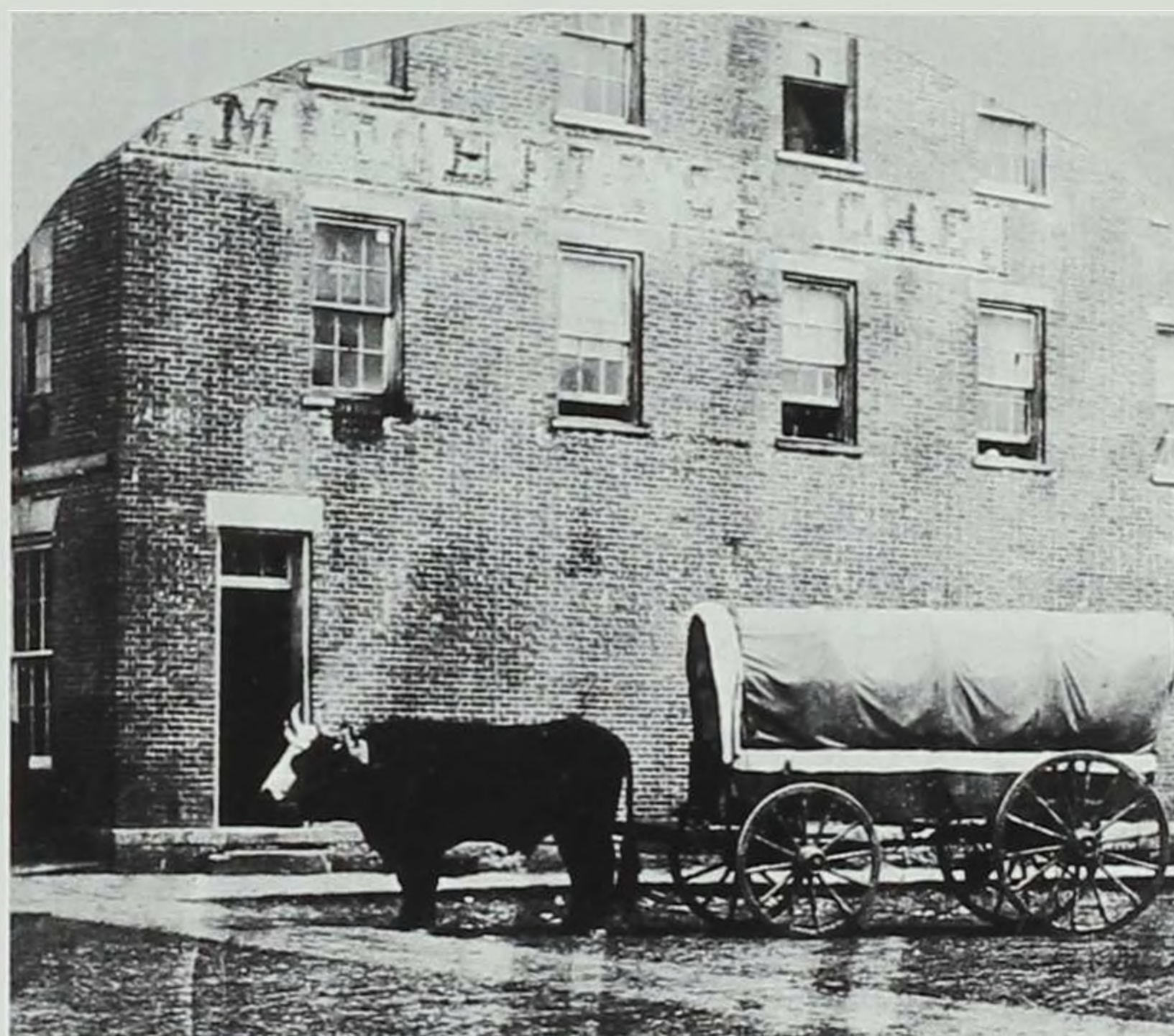
C overed wagons pulled by oxen served as both shelter and transportation for thousands of emigrants like Kitturah and George Belknap. Above: Wagon and ox in Maquoketa, Iowa.

Monday, April 9th, 1848. I am the first one up; breakfast is over; our wagon is backed up to the steps; we will load at the hind end and shove the things in front. The first thing is a big box that will just fit in the wagon bed. That will have the bacon, salt and various other things; then it will be covered with a cover made of light boards nailed on two pieces of inch plank about 3 inches wide. This will serve us for a table, there is a hole in each corner and we have sticks sharpened at one end so they will stick in the ground; then we put the box cover on, slip the legs in the holes and we have a nice table; then when it is on the box George will sit on it and let his feet hang over and drive the team. It is just as high as the wagon bed. Now we will put in the old chest that is packed with our clothes and things we will want to wear and use on the way. The till is the medicine chest; then there will be cleats fastened to the bottom of the wagon bed to keep things from