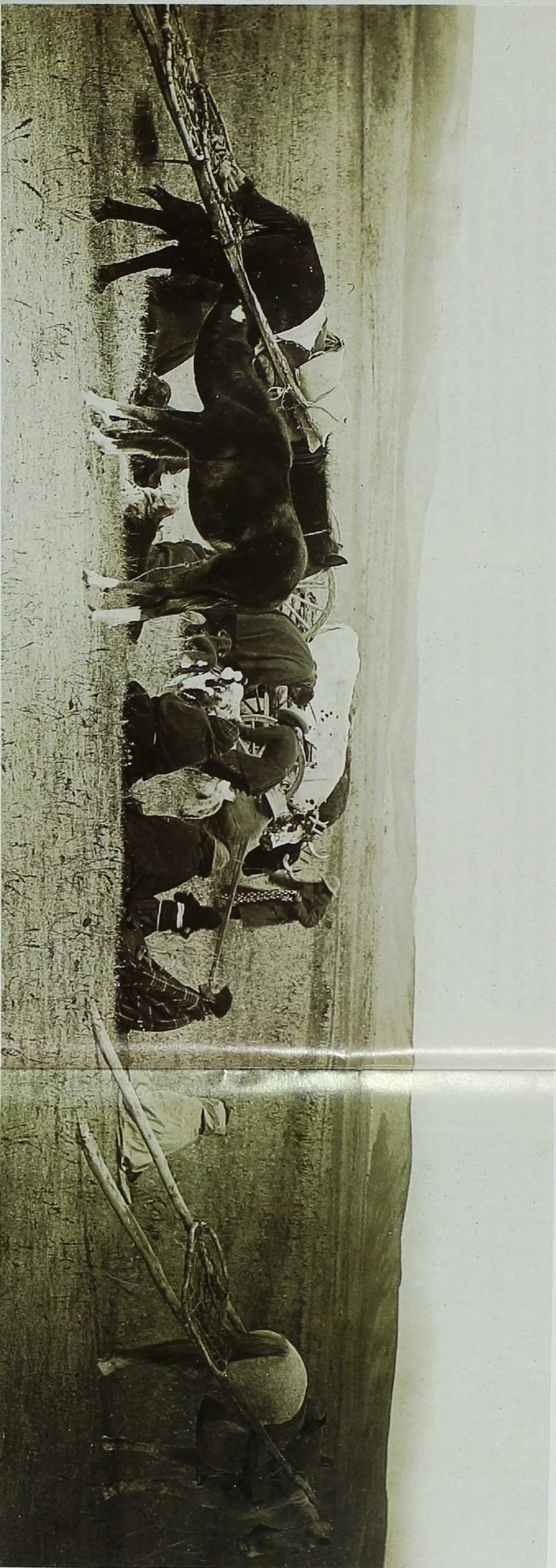
Eliza Ann McAuley writes often of encountering American Indians on her journey to California. The western migration exposed emigrants and Indians alike to different ways of living. For moving across the plains and following bison herds, Plains Indians had developed simple methods to transport their few material belongings. One method was the horse-drawn travois, as shown in this late 19th-century photograph of a group of Sioux. In contrast, most midcentury emigrants crossing the West in wagons ended up discarding possessions to decrease the load pulled by their weary teams. In later years, emigrants would ship their goods by railroad. (Note the oxen and wagon in the center of the photograph.)