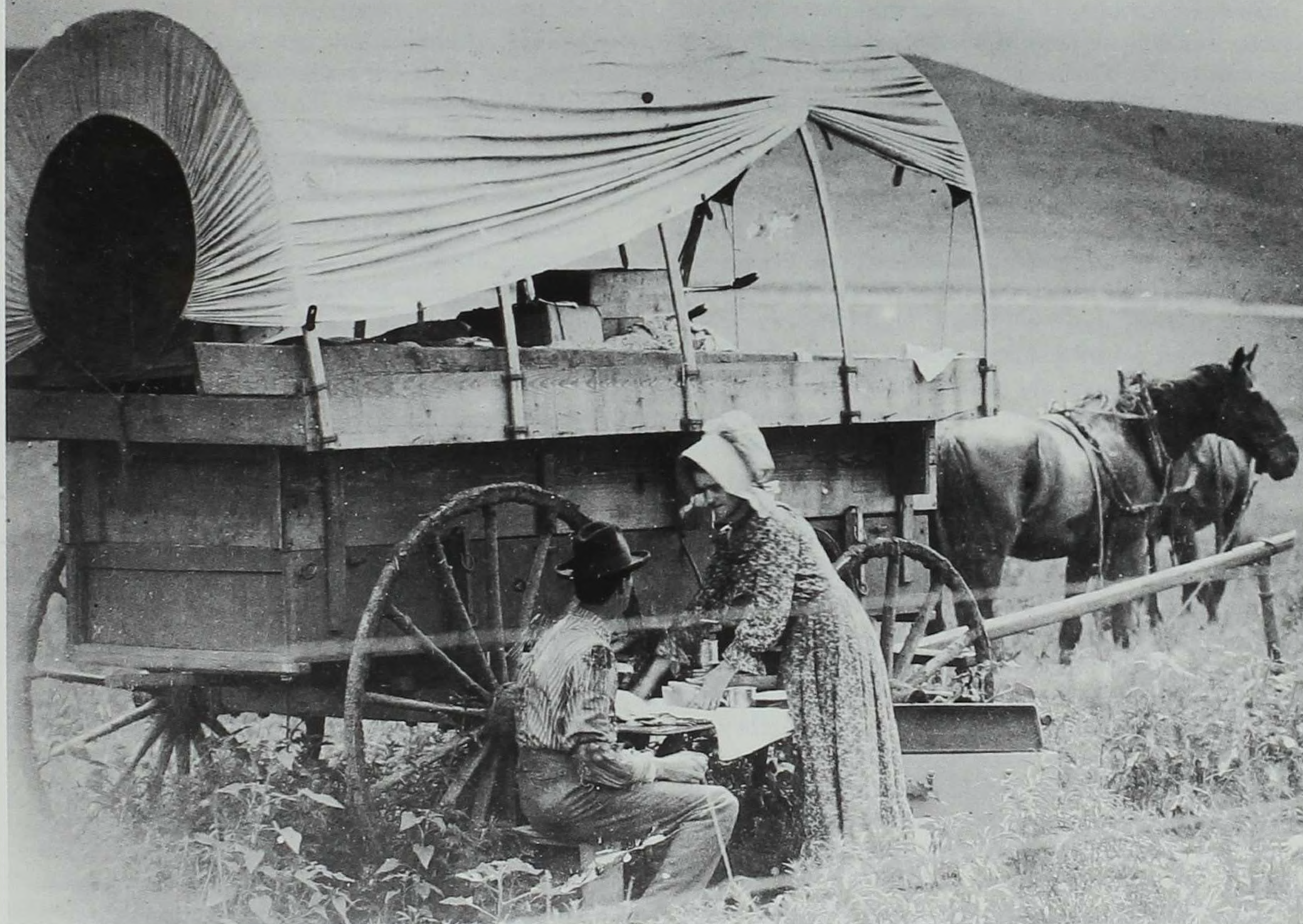
Guidebooks often advised emigrants about what provisions should be taken along. Deer and buffalo meat supplemented the staples. Some diarists complained of the monotony of the same foods; others described making jelly, cookies, and pies.

one hundred and twenty to one-hundred and fifty yards wide, rising from the level plain, entirely isolated and independent of any other rock or hills. It is almost covered with the names of emigrants, chiseled in the rock or painted on its surface, with the date of their arrival. We saw the names of some of our friends, who had passed here in 1849 and 1850.