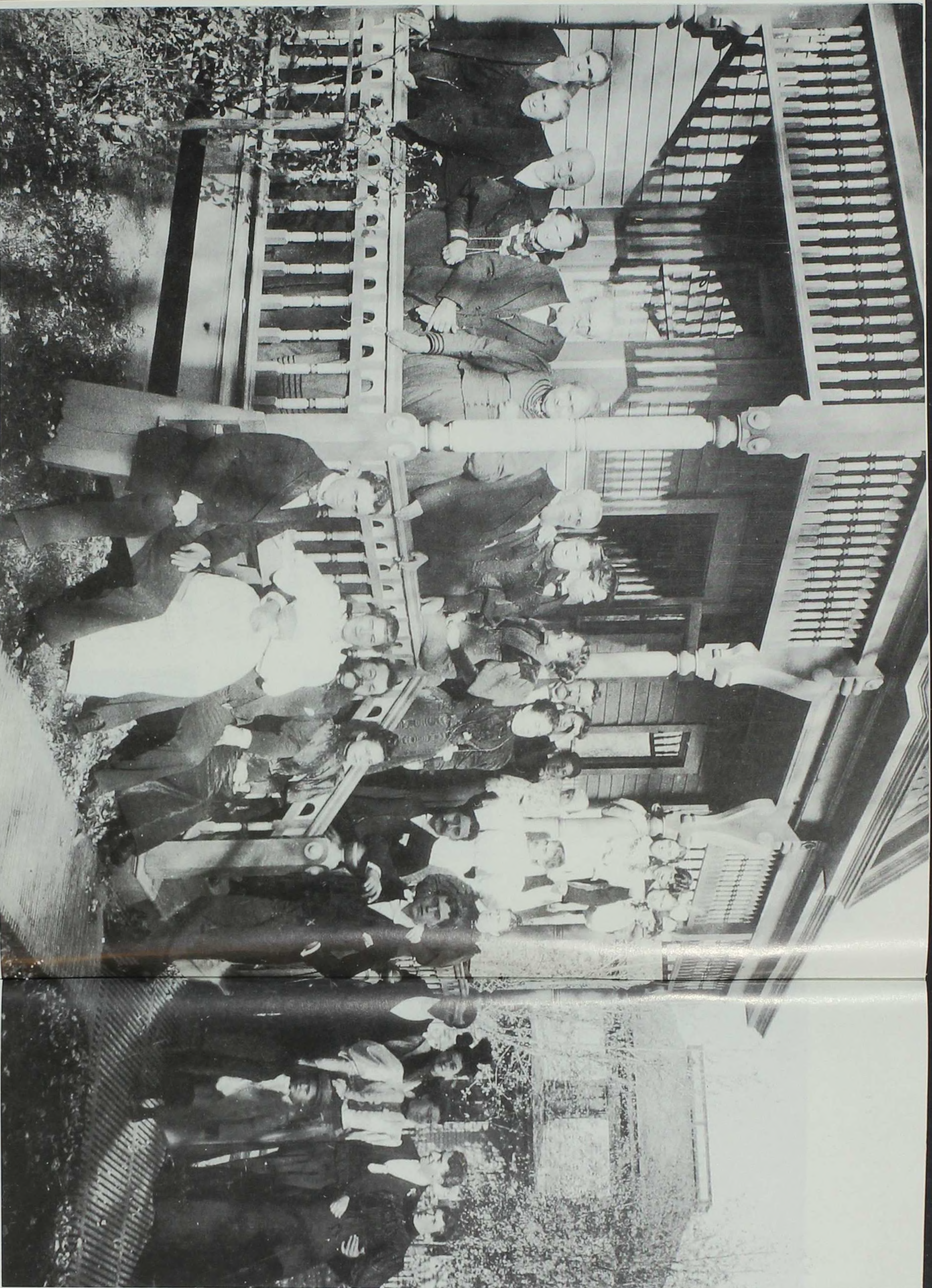
SHSI (IOWA CITY)