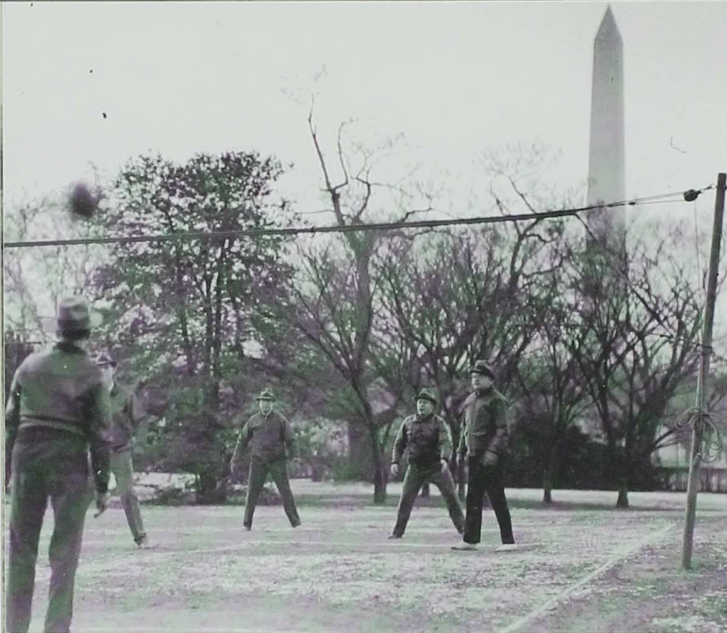
On a chilly day at the White House, President Hoover (right) plays his daily game of Hoover-ball with his White House staff. The president's doctor developed the game. The hefty medicine ball weighed five pounds.

the journalistic diatribes would be overlooked today.