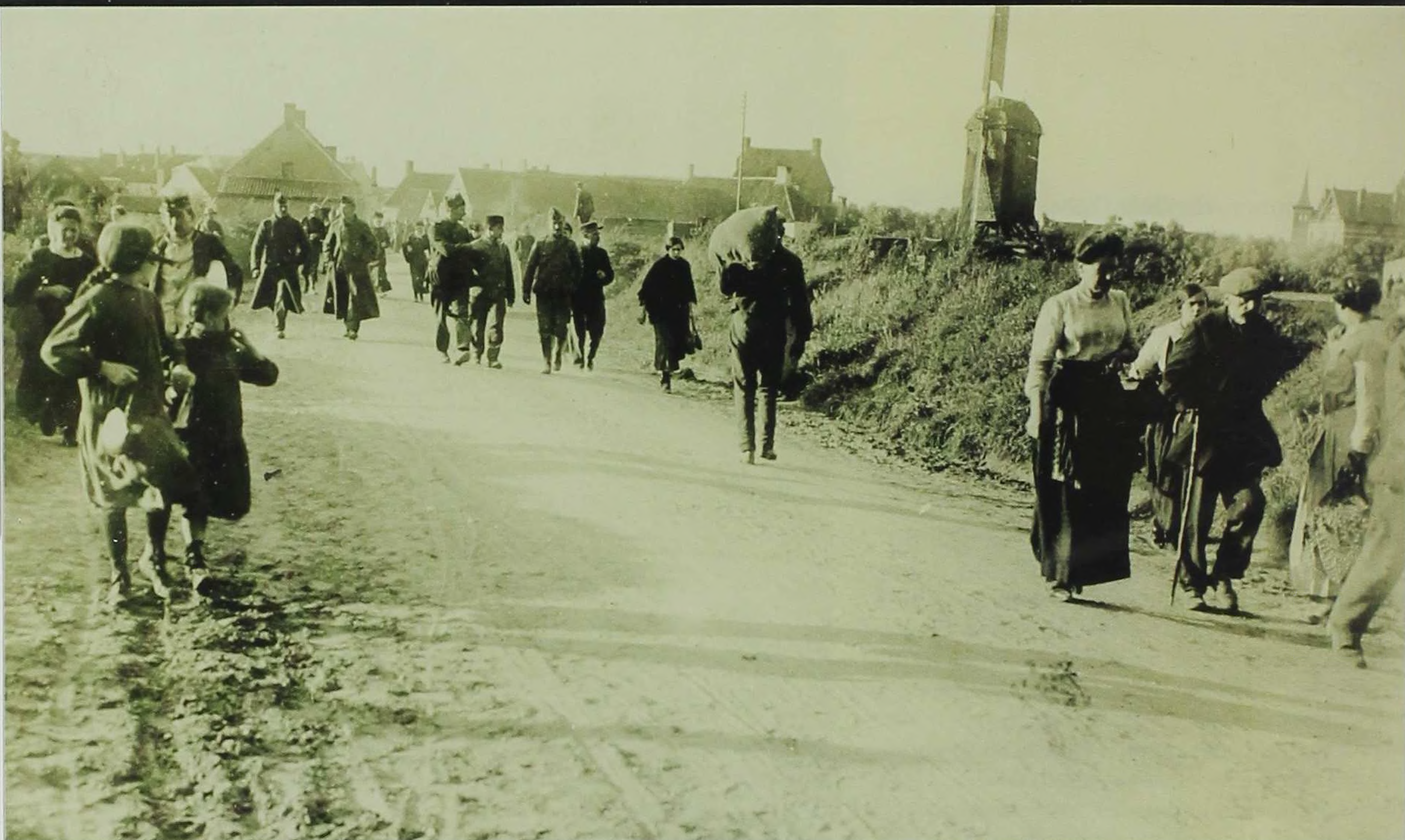
An American Expeditionary Forces photograph shows “the evacuation of a Belgian hamlet during bombardment.” As head of the Commission for Relief in Belgium, Hoover marshaled massive, international resources for the Belgian people.

gian people. As leader of the Commission for Relief in Belgium and as a private citizen of the most powerful neutral nation, Hoover leveraged world opinion.