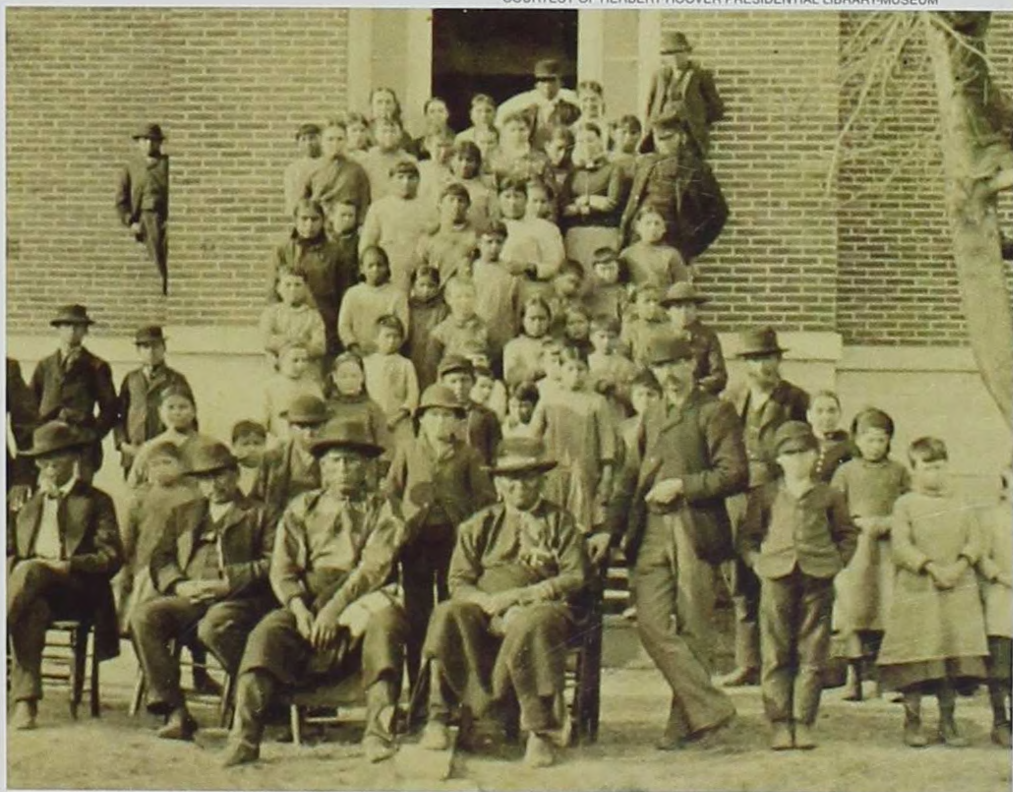
A child who loved the outdoors, Hoover played with some of the Osage children who boarded at the Indian Industrial School in West Branch, founded by his mother's relatives.