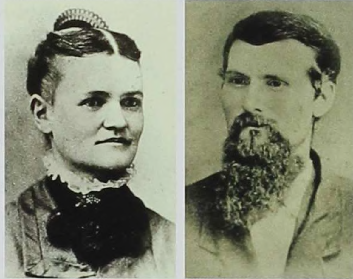
Hoover's parents, Hulda and Jesse, in 1879.