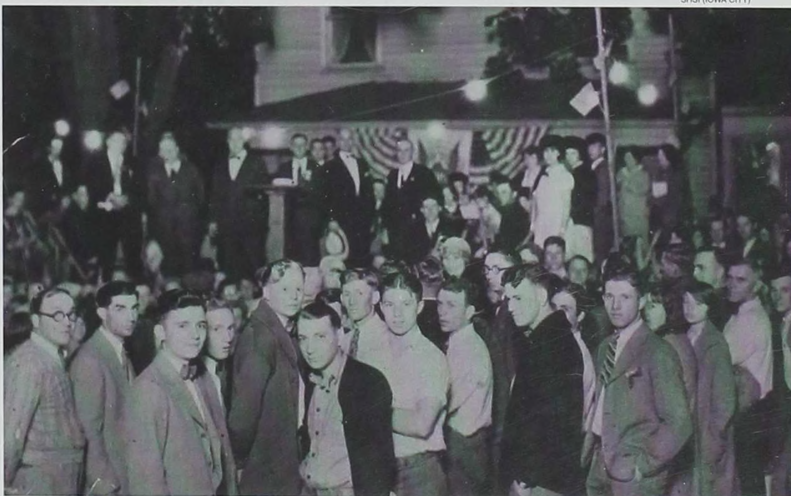
Citizens of Hoover's hometown of West Branch gather for the news of his nomination for the presidency in 1928.

Even Harding and Coolidge had received far more favorable press coverage. Comparing his press clippings when he was savior of Belgium and secretary of commerce with those when he was president, one would think journalists were writing about two different people. If the depression had ended on Hoover's watch, as the Civil War did on Lincoln's,