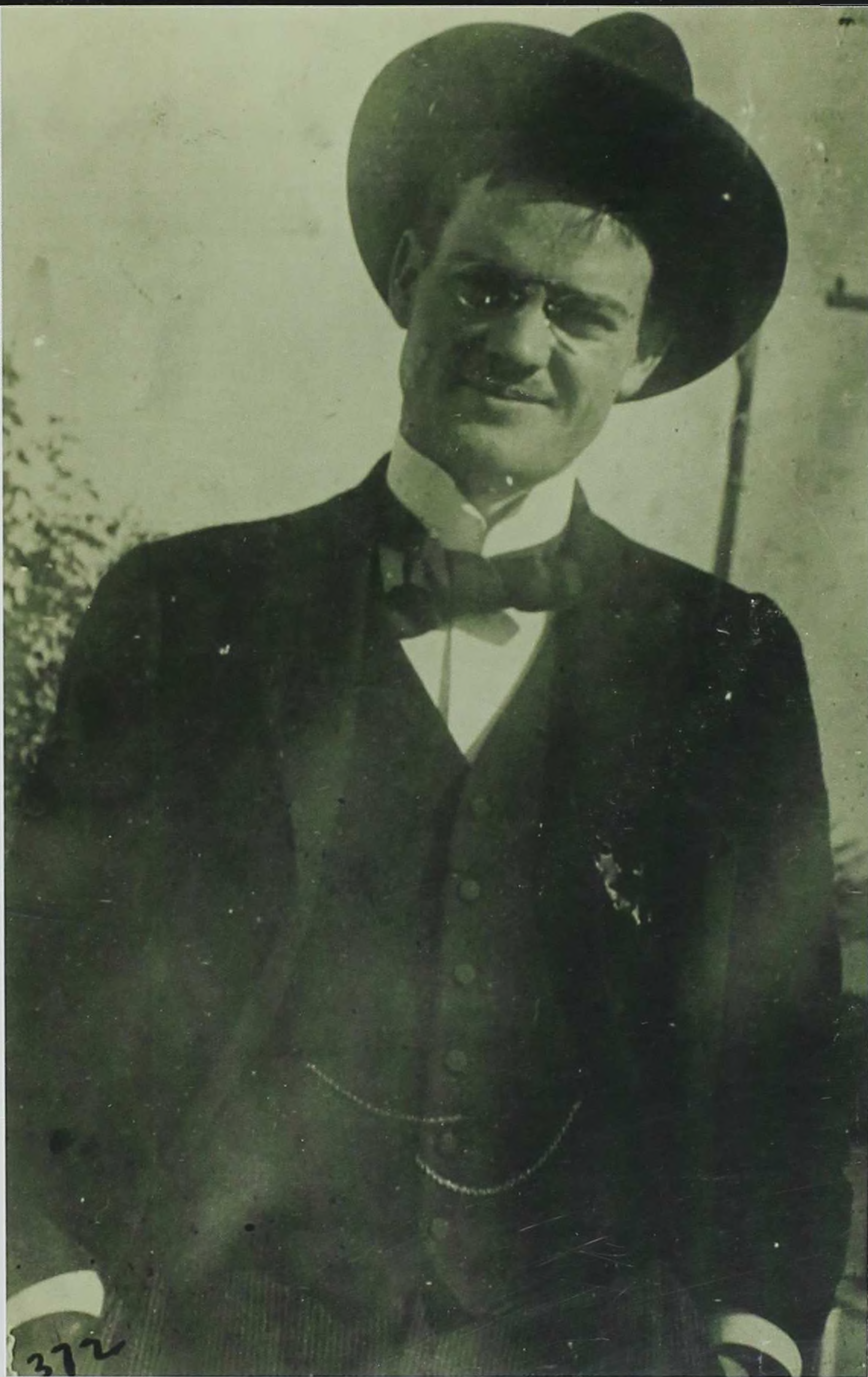
Hoover at the time of his wedding to Lou Henry in Monterey, California, 1899. Both were 24

Competitive by nature, Hoover enjoyed testing his mettle in business, and by the eve of World War I he had amassed a potentially enormous mining empire.