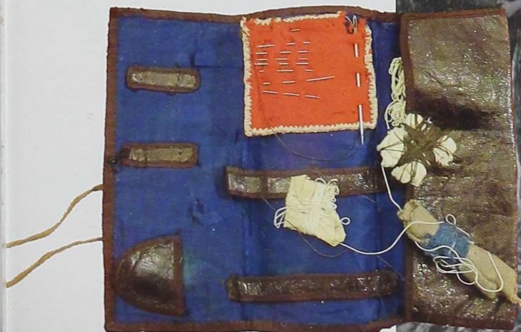
SEWING KIT: SHSI (DES MOINES).

Because repairing uniforms was part of a soldier's life, women fashioned small sewing kits called housewives (below) for them. "Never came anything so handy, Iowan Cyrus Boyd wrote in his diary. "It contains needles, pins, buttons, thread and just what every soldier needs. In it the needles do not rust and are always in good shape." Another soldier wrote, "The admirable little housewives sent by our Dubuque ladies elicited three hearty cheers for their senders, and one containing a lock of golden hair is a bone of contention. . . . Whose sheeny tress is it? The lady who put it there had better write to the one she wishes to have it, or else a dozen duels may result."