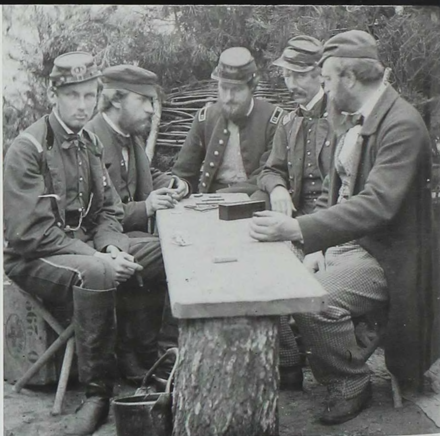
Cards, dominoes, and other games filled spare hours. So did letter writing, reading, playing music, singing, and general horseplay.