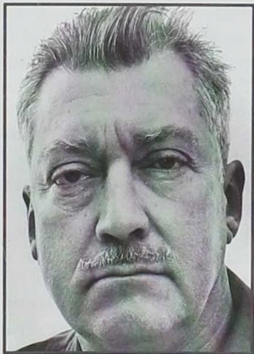
Iowa author MacKinlay Kantor

Unfortunately, the two major scholarly journals of American history, the Mississippi Valley Historical Re-