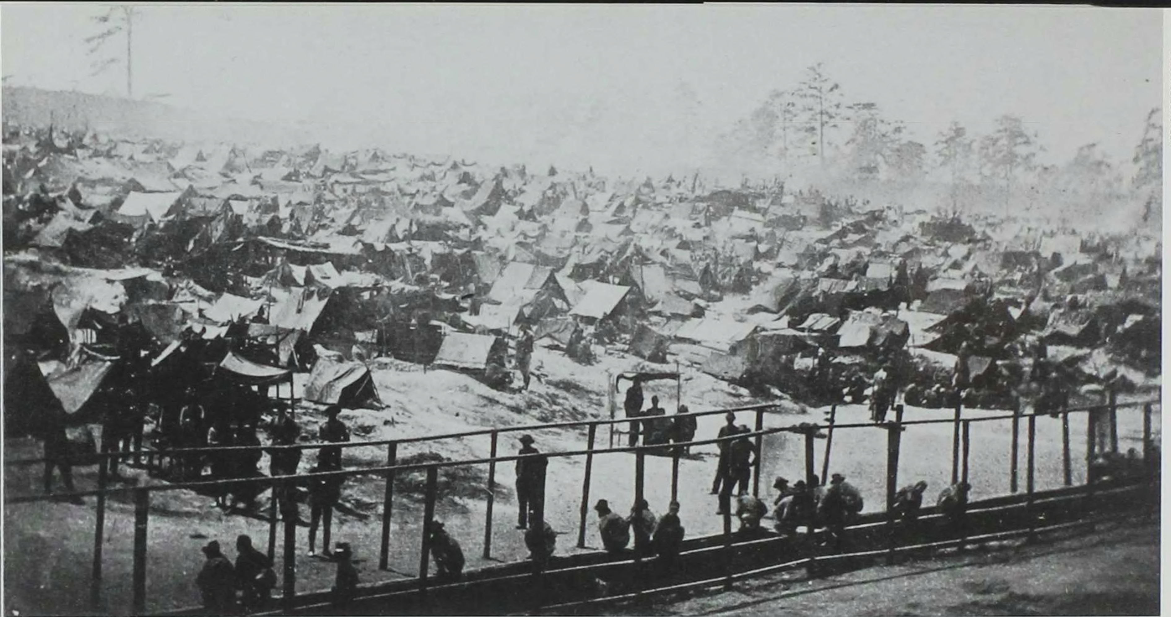
A rare photograph of Andersonville, August 17, 1864. On a morning decades later, Kantor walked the site before dawn.

view and American Historical Review , did not review his book. To be fair, it is not clear if review copies were sent to these journals. It is quite possible that World Publishing never gave much thought to reviews by academic journals.