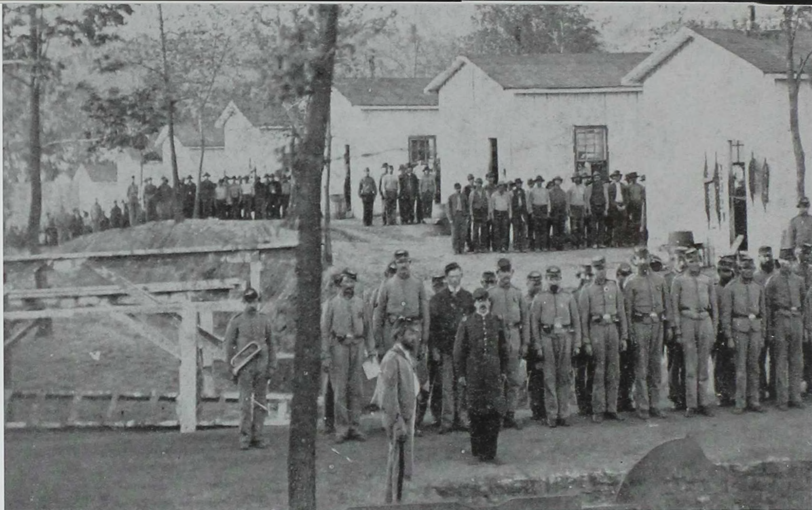
ROCK ISLAND ARSENAL MUSEUM