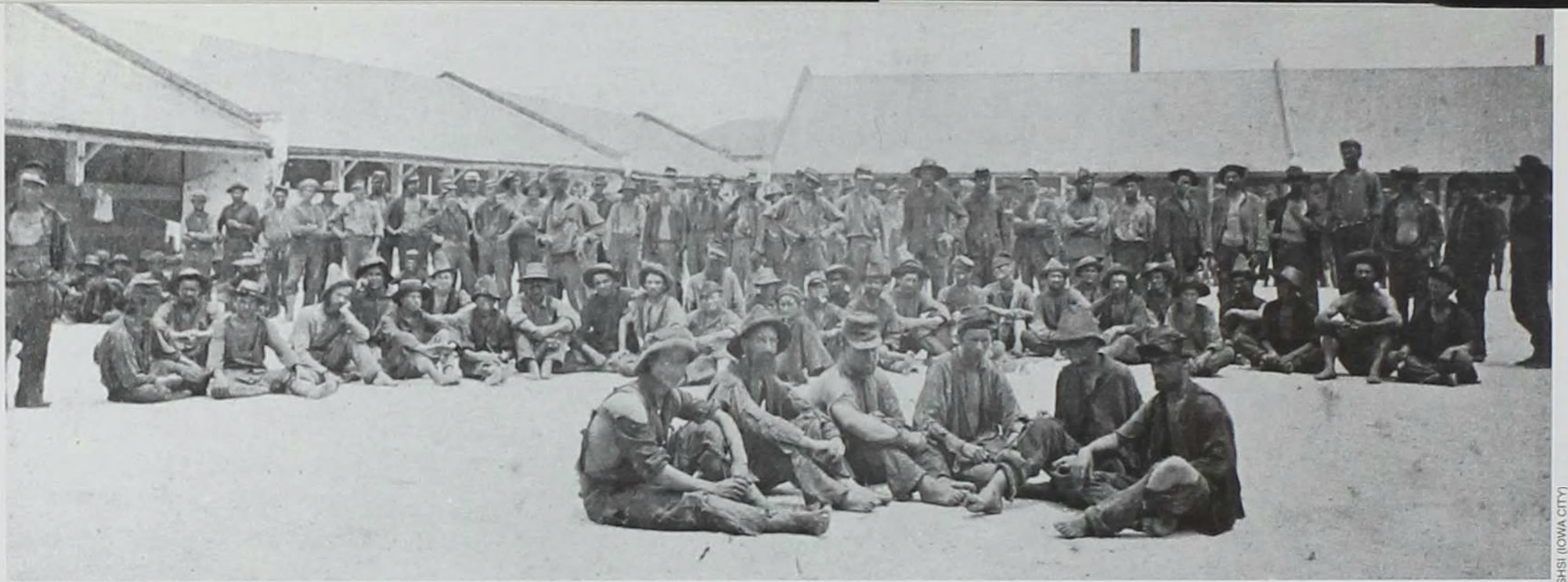
Men of the 19th Iowa Infantry in New Orleans on July 24, 1864, shortly after their release from the stockade at Camp Ford near Tyler, Texas. The prison stockade covered 16 acres. The largest Confederate prison camp west of the Mississippi, it had one of the lowest mortality rates of any Civil War prison.

of resistance in an Alabama prison. On July 4, prisoners celebrated Independence Day, complete with speeches critical of the Confederacy. When ordered to end the insubordination, the prisoners rushed up to the front and and shouted three cheers for the Red, White and Blue. "Thus ended our Fourth of July celebration," wrote Van Duzee, "in a rebel prison, in the heart of the Confederacy, in 1862."