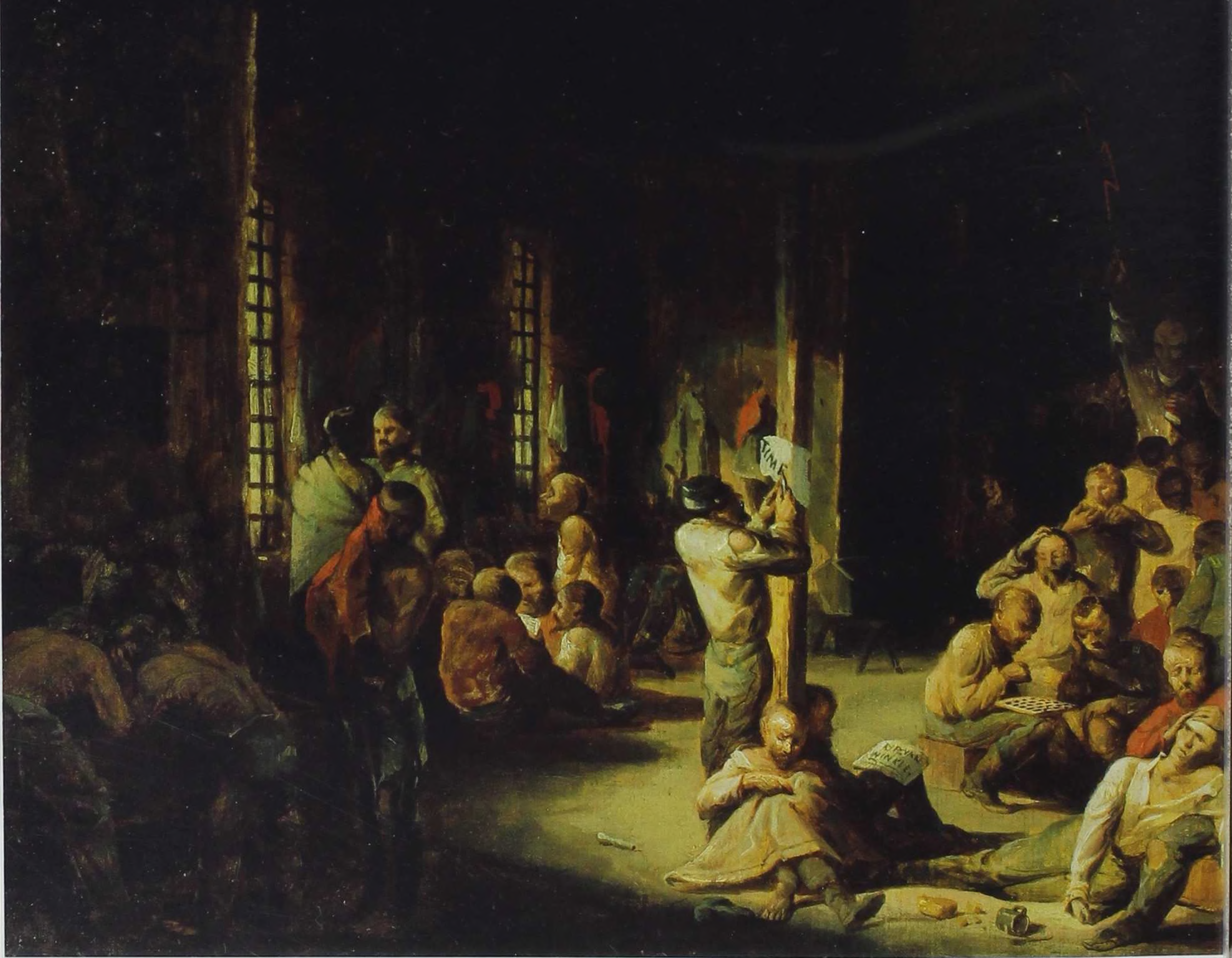
Libby Prison, 1863 (oil on canvas), by David Gilmour Blythe. Iowa troops were held captive in this Confederate prison.