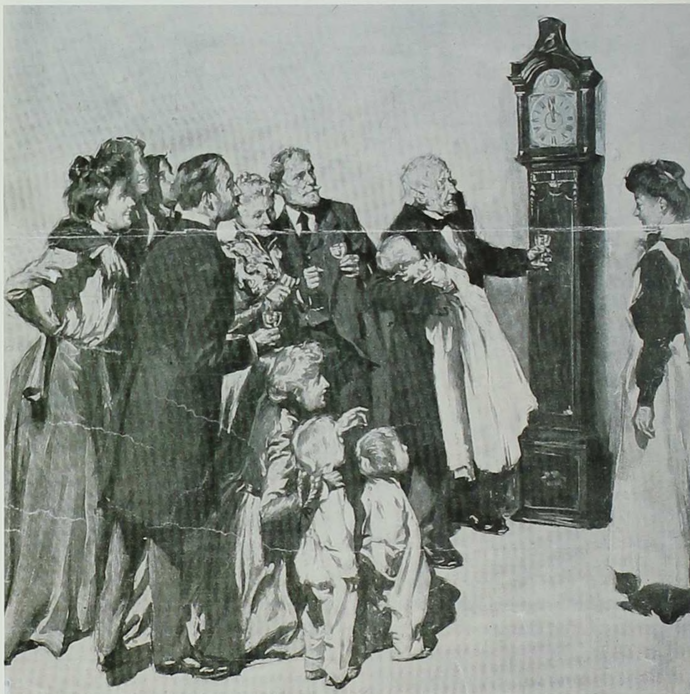
A party watches for midnight in this Harper's Weekly illustration (January 1901).

special "watch night" services. The evening of prayer, sermons, addresses, and hymns began at eight or nine and ended at midnight. In the Page County village of Coin, for instance, "Watch night was observed at the Methodist church Sunday evening. The service commenced at nine o'clock with a song and prayer service; next came the sermon and then, a testimony meeting. Promptly at midnight the church bell was tolled, once for each century. Quite a number stayed to watch the old year out."