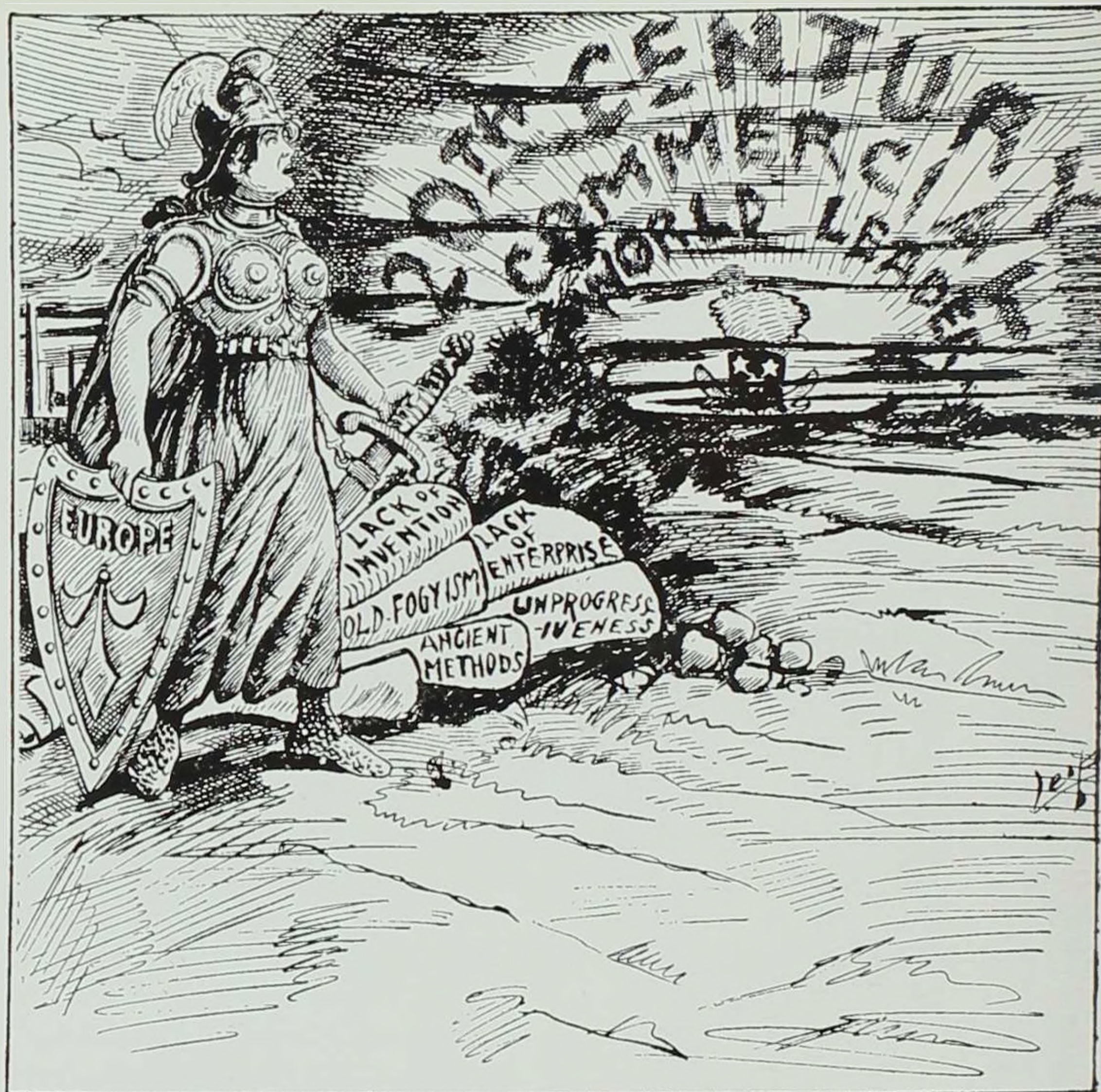
Captioned "Dawn of the Twentieth Century as it Strikes Europe," this cartoon appeared in the Detroit News-Tribune and the Literary Digest (January 5, 1901).

The next day's newspaper also listed a few Burlington citizens on the police docket who had disturbed the peace or "miscalculated the amount of liquor that he could carry easily and gracefully."