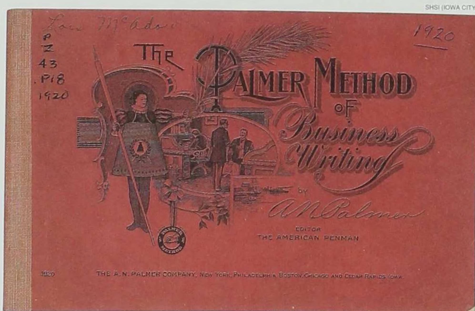
Palmer's "red books" became standard instruction manuals for his method of practical penmanship. Below: a few lessons.

Although Palmer used the magazine—renamed The American Penman in 1907—to promote his method,