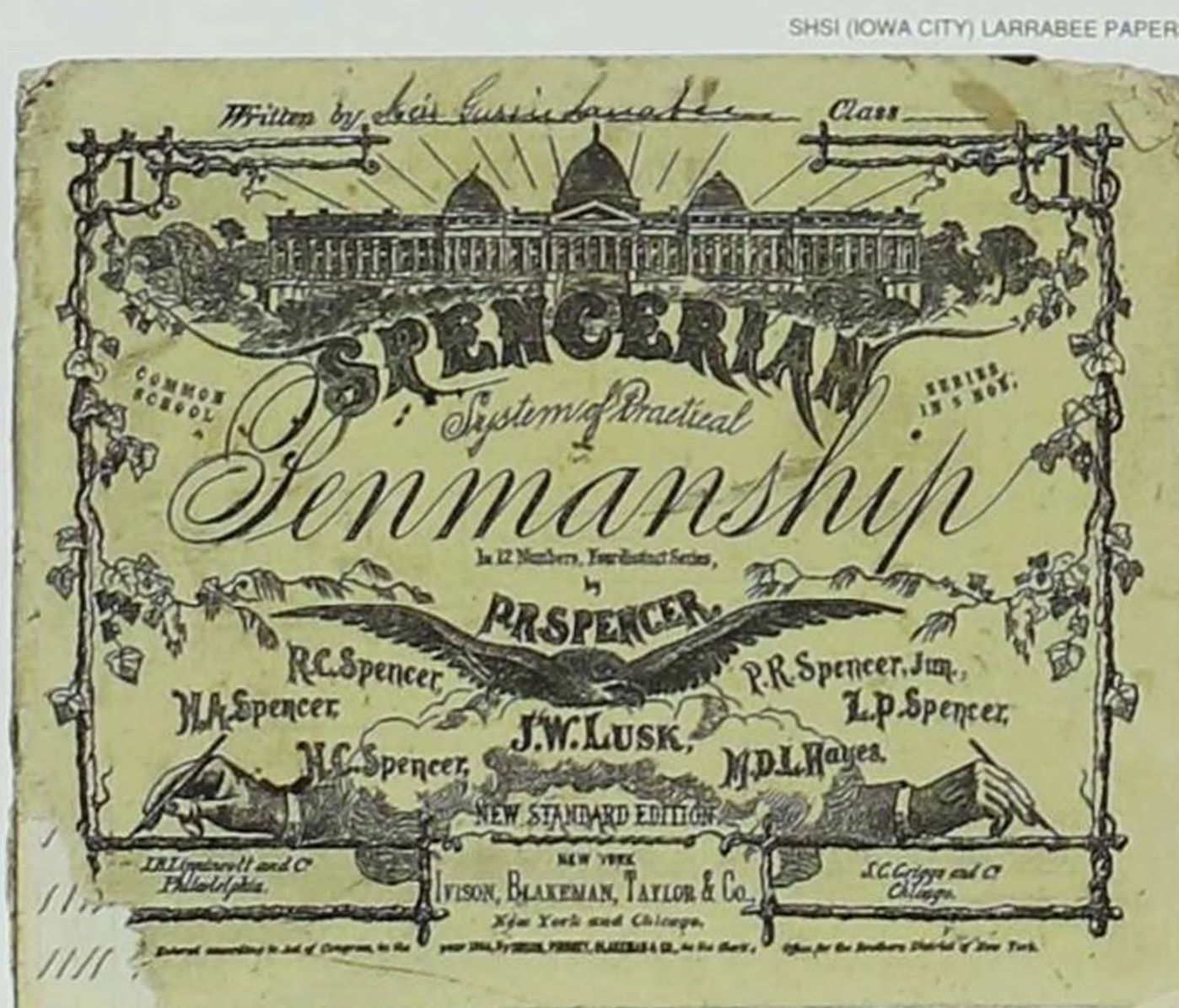
P latt Rogers Spencer first published his Spencerian system of penmanship in copybook form in 1859.

writer for an insurance company, for in those days such documents were handwritten. This experience impressed on him the value of writing fast, tirelessly, and yet legibly. "I thought that I was an expert penman at the beginning of my office experience but I soon learned that I was not even a good business penman," Palmer recounted. In the following years, he would remedy that situation by developing the Palmer Method of handwriting and promoting it from Cedar Rapids.