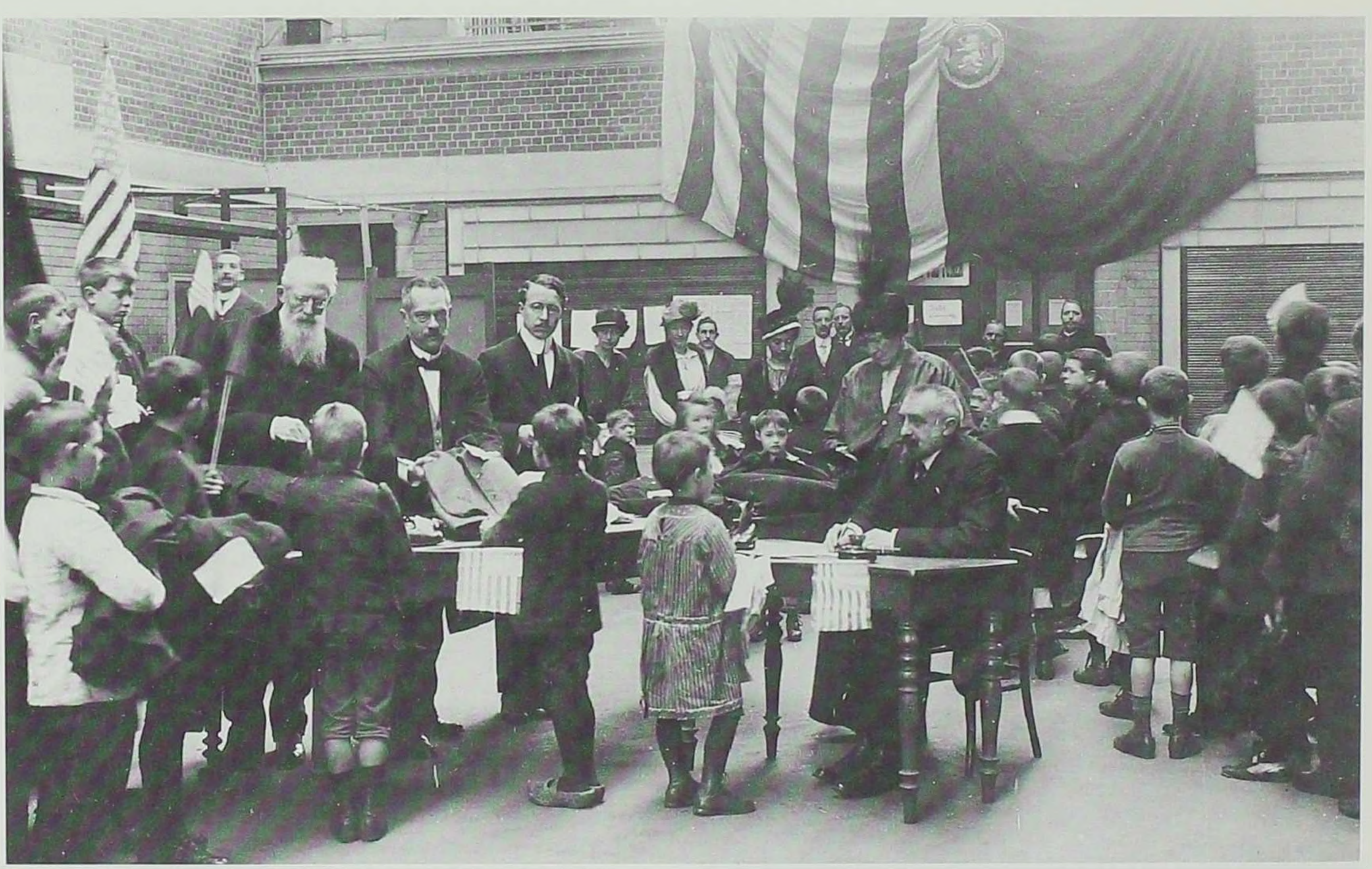
Belgian orphans find shelter and food in London in 1914 (above and right). Stapp forwarded Go-Hawks funds to the Belgian Relief Committee there. (War orphans were defined as children who had lost one or both parents.)

pennies to buy shoes and stockings for 200 of these children.