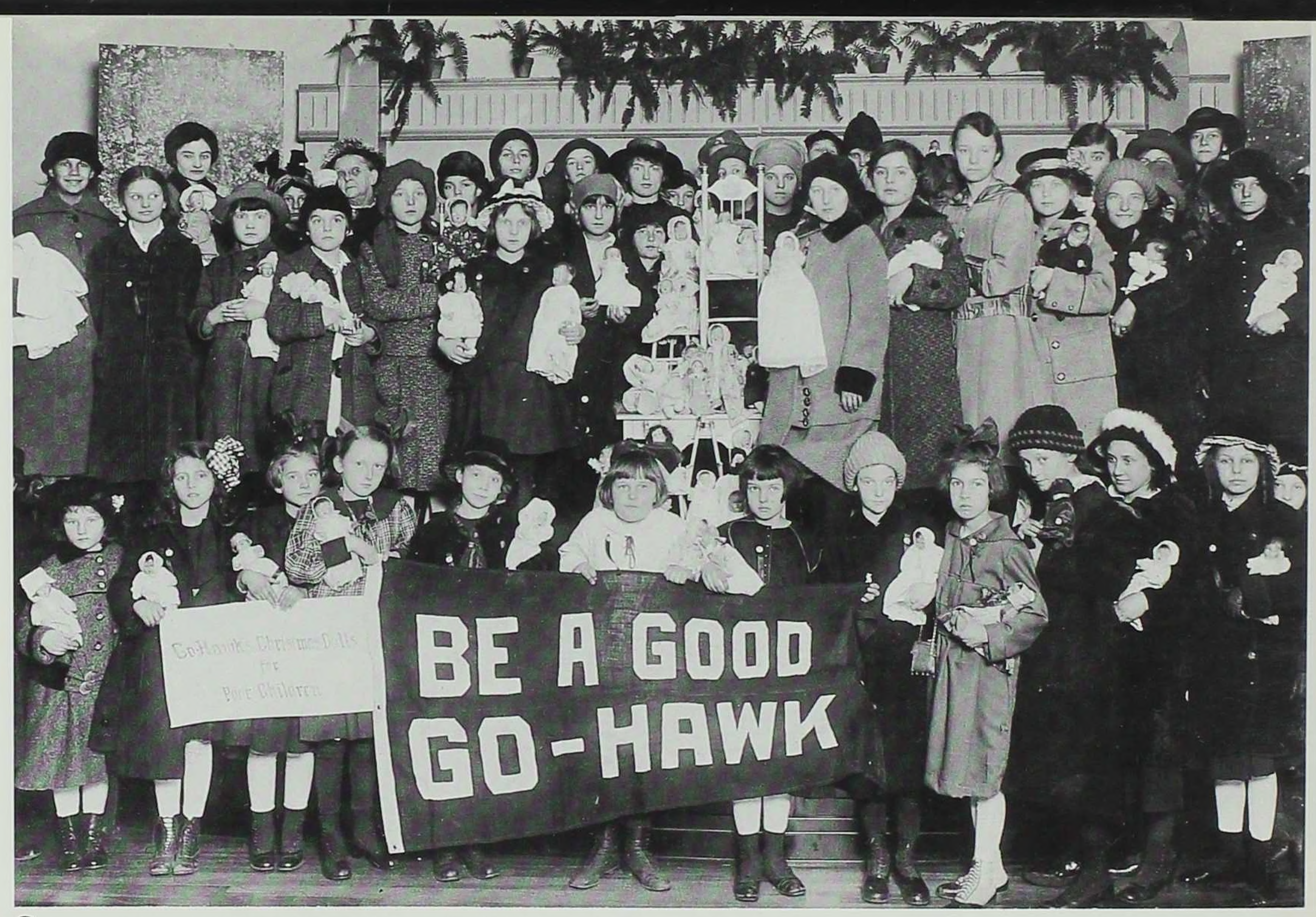
Stapp distributed dolls to lowa girls and asked them to dress them and then donate them to the poor. This photo, from Stapp's scrapbook, is captioned: "We each dressed a doll for a little poor child at home."

facts prove that Happy Tribes flourish in one part of a city as well as another."