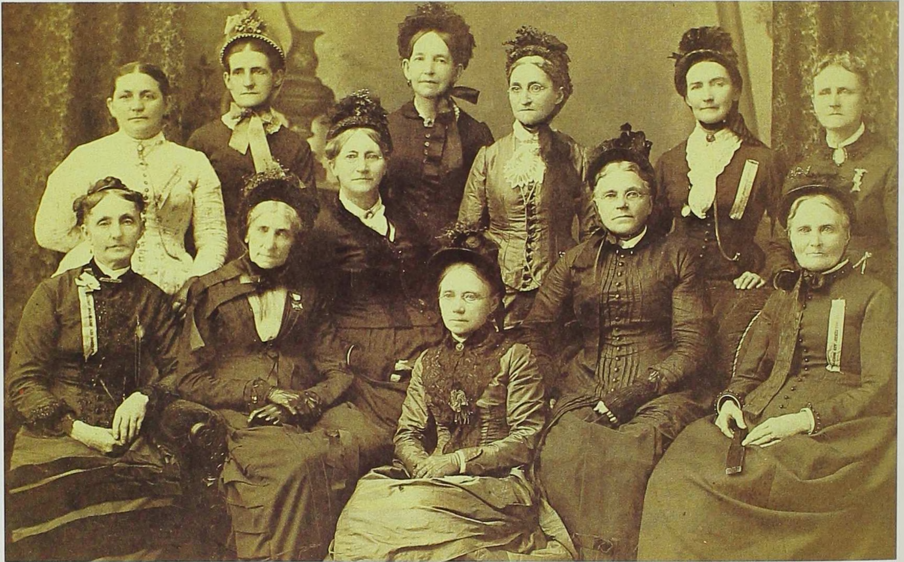
Some years after the war, 12 members of the "Iowa City Soldiers Aid Society of the Civil War" posed for this picture. In 1862 the group of about 52 women sent supplies out of state and to Camp Pope in Iowa City. That September they recorded: "The new call from Secretary of War for Lint gave a new impulse, and the company all engaged in picking or scraping it." Scraped from linen, soft and absorbent lint was often applied wet to wounds. Yet even if scraped from clean cloth, it wasn't aseptic.

tive to women doing work outside the home, and by giving women the confidence, experience, and skills for the huge task of soldiers' aid.