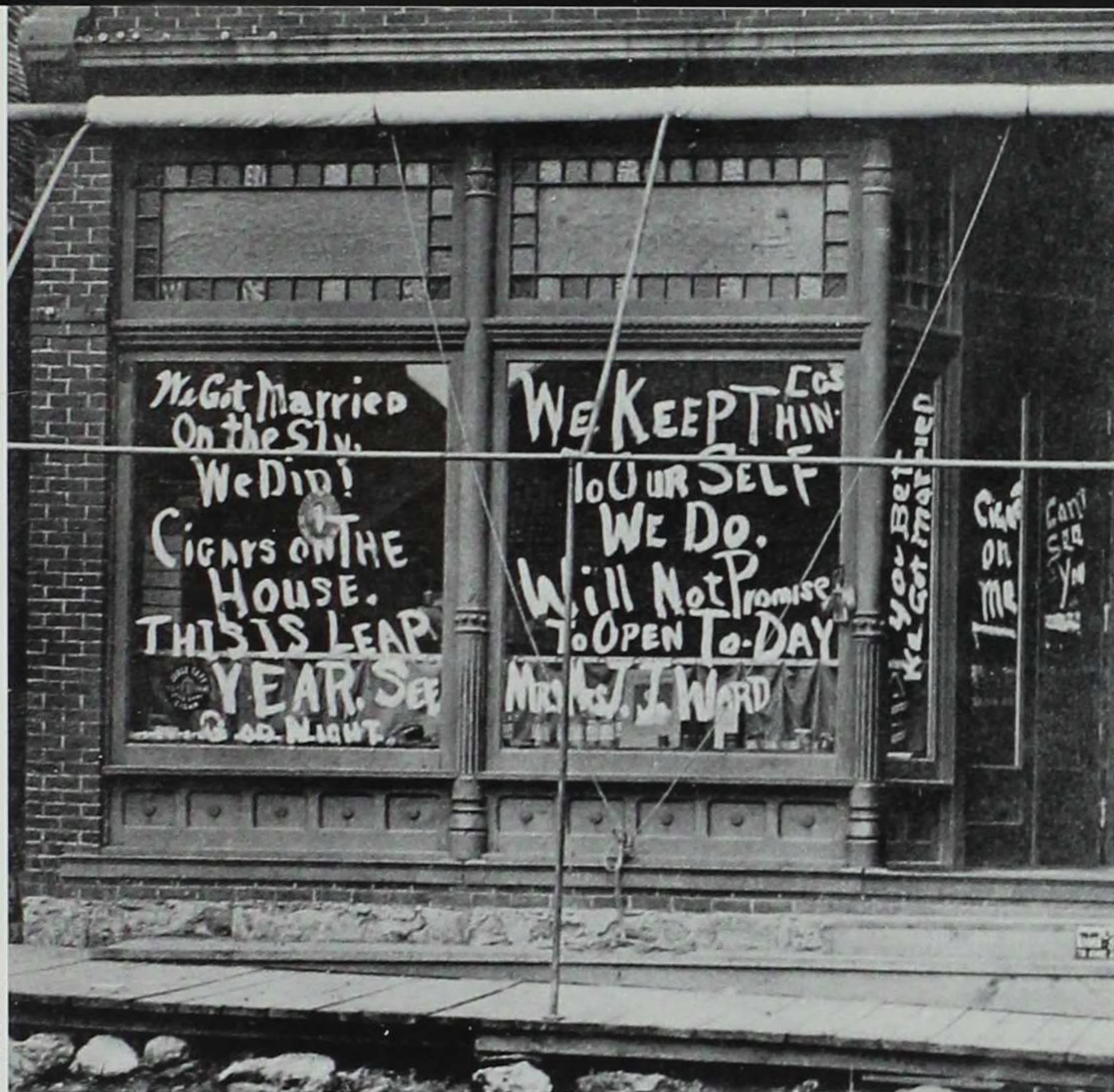
SHS (IOWA CITY)