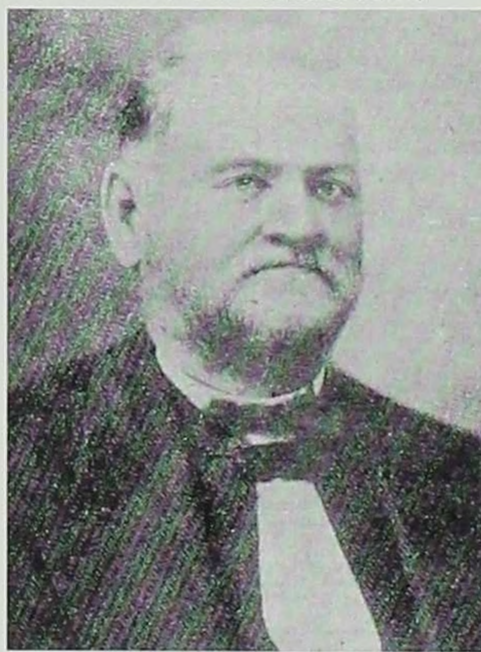
As Mormon elder and newspaper editor, Orson Hyde wielded considerable power in Kanesville and the surrounding Mormon settlements.