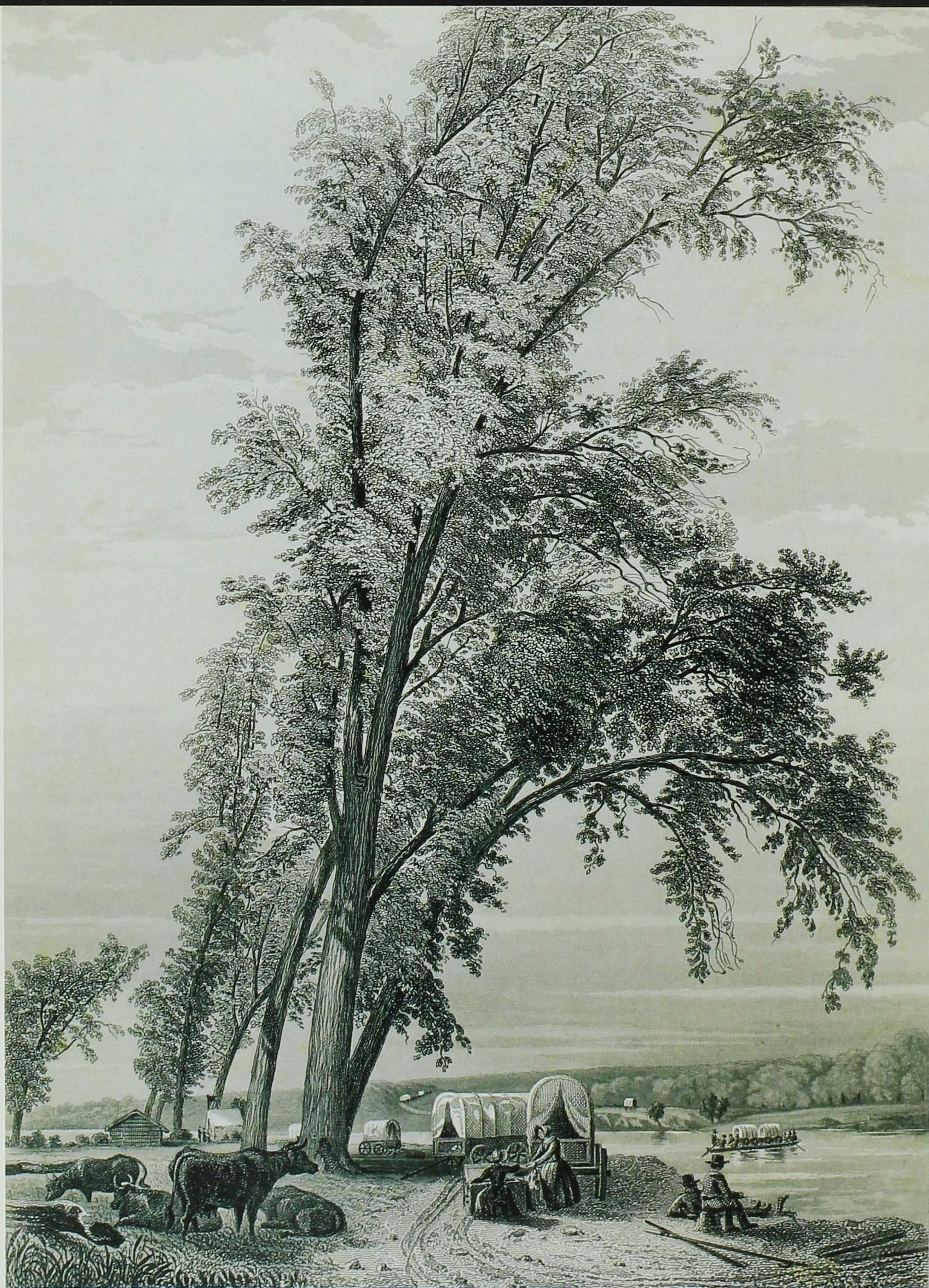
SHSI (IOWA CITY). FROM ROUTE FROM LIVERPOOL TO GREAT SALT LAKE VALLEY, ED. JAMES LINFORTH (1855)