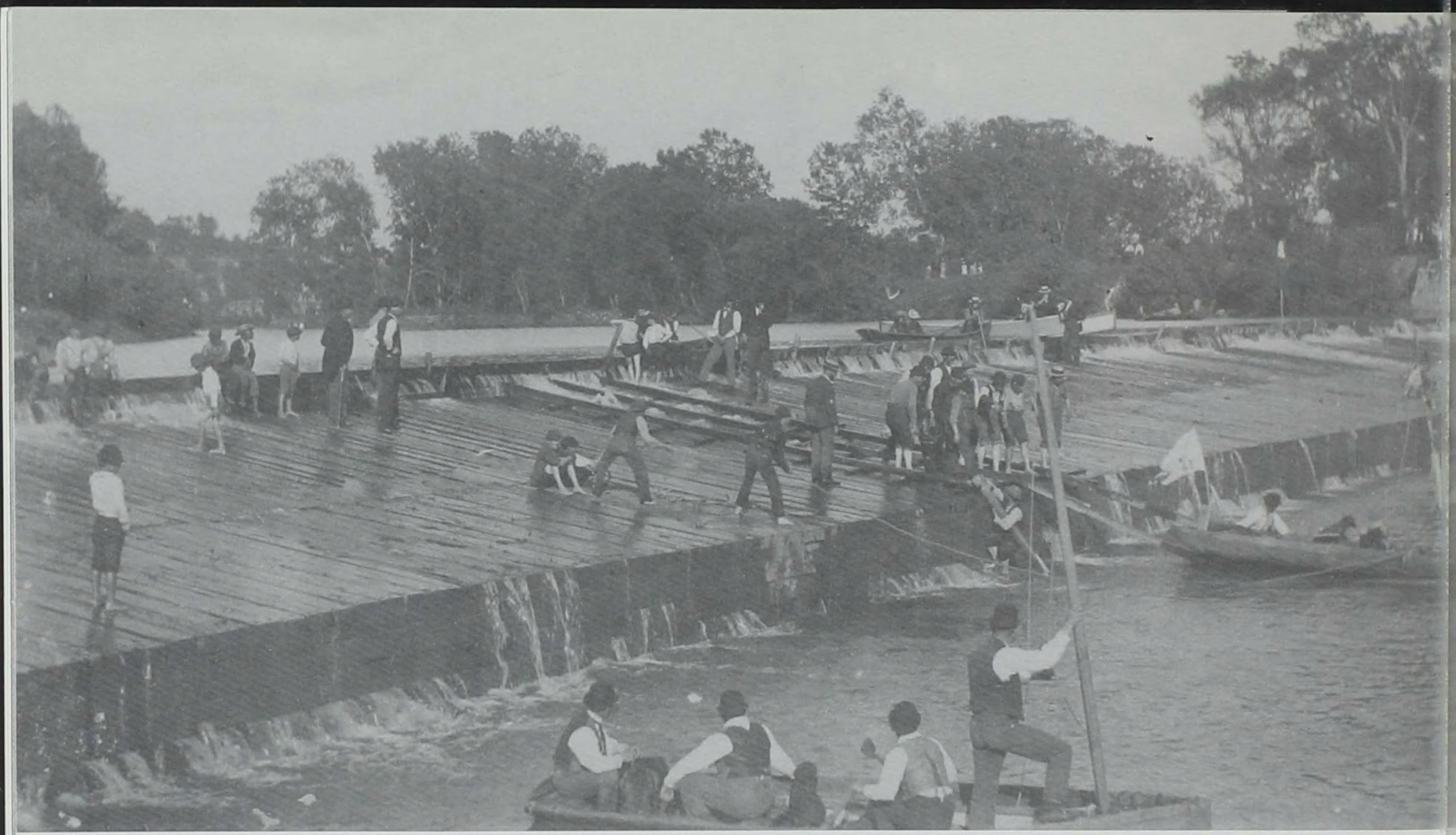
Young boys help men from Kelly's Army ease flatboats across a dam at Ottumwa, as the flotilla heads to Keokuk.