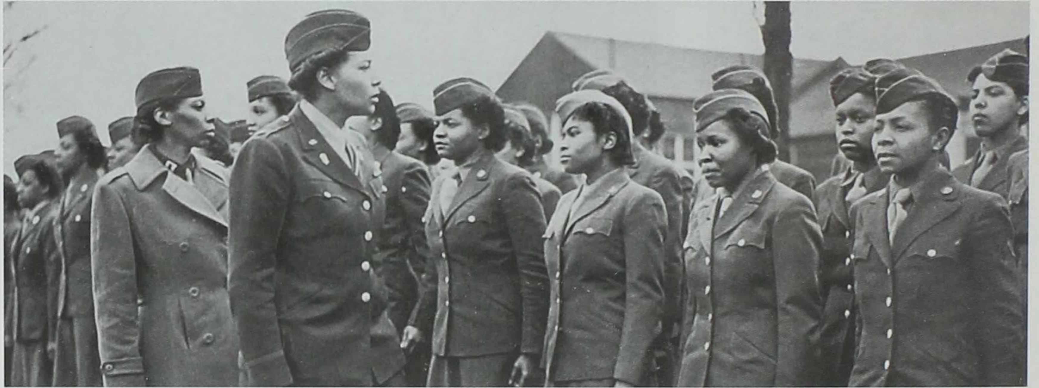
Women's Army Corp trainees stand ready at Fort Des Moines during World War II.

the Ku Klux Klan in Iowa during the 1920s were reminders of the distance that remained. Not until President Truman's 1948 executive order banning segregation in the armed forces and the U.S. Supreme Court's 1954 decision outlawing "separate but equal" schools would federal government agencies begin taking action on behalf of black civil rights in the United States.