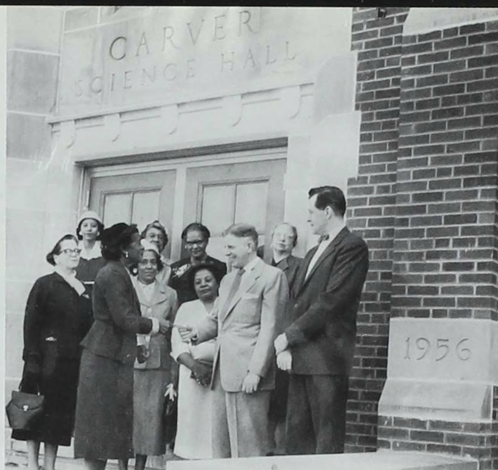
Federation members present a $5,000 donation to Simpson College for the George Washington Carver Hall in 1956.

Like many Iowa women's clubs, the state association has reached its century milestone—"having started