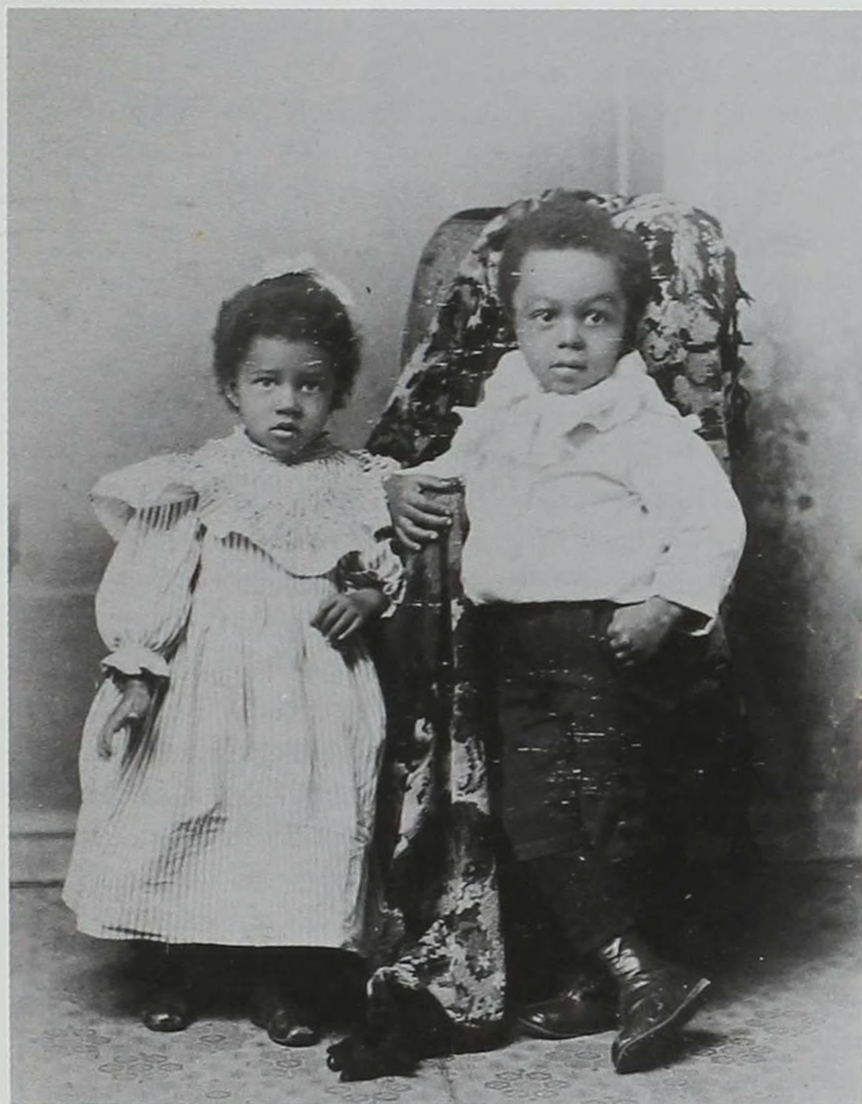
Children and the home were considered the central focus for women, but through club work, they could apply their energies to social problems and civic concerns in their communities.

Reading Club (named for the outspoken black journalist who crusaded against lynching).