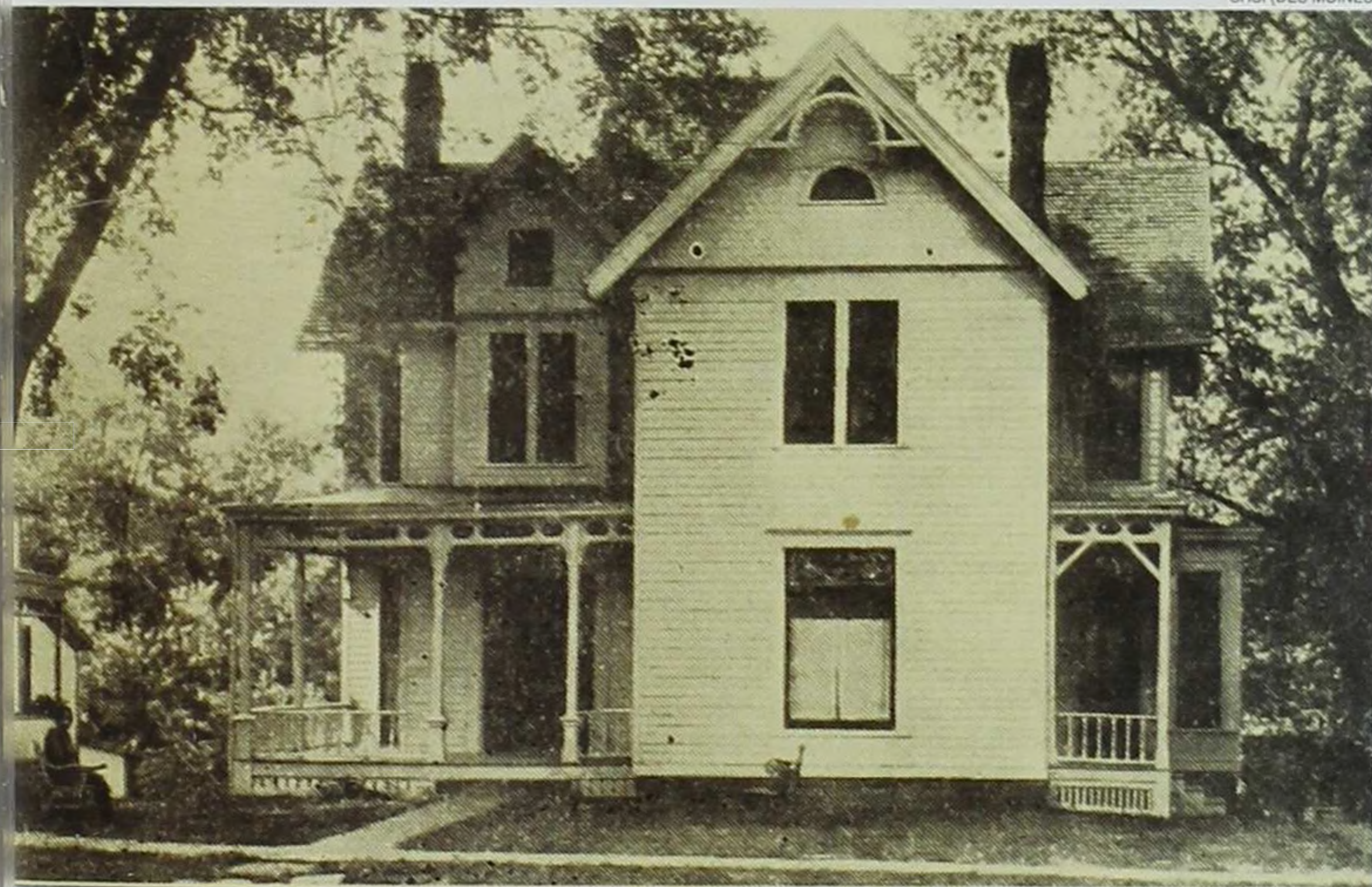
For three decades, the Federation Home at 942 Iowa Avenue in Iowa City housed African American women students enrolled at the University of Iowa.