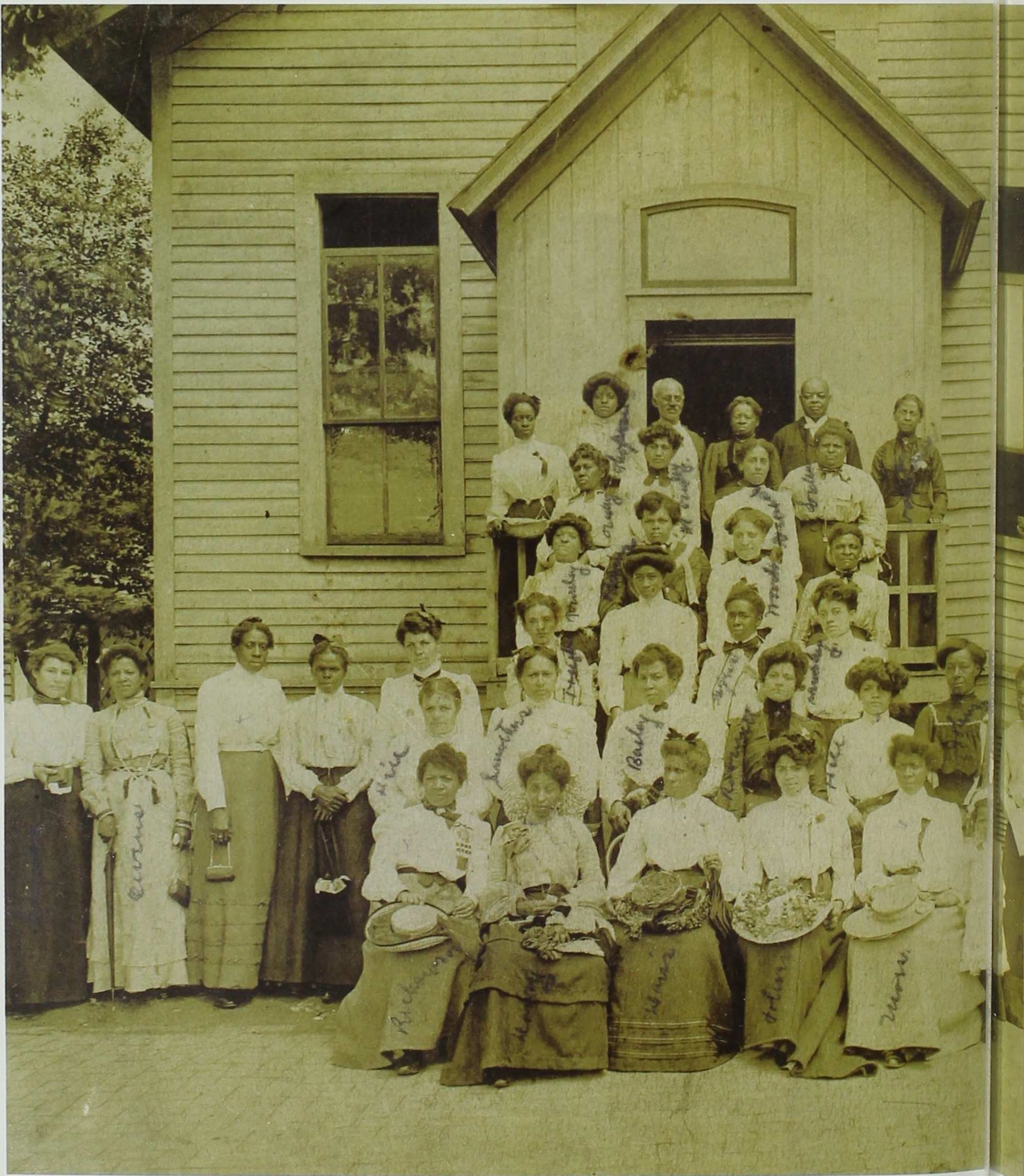
SHSI (DES MOINES)