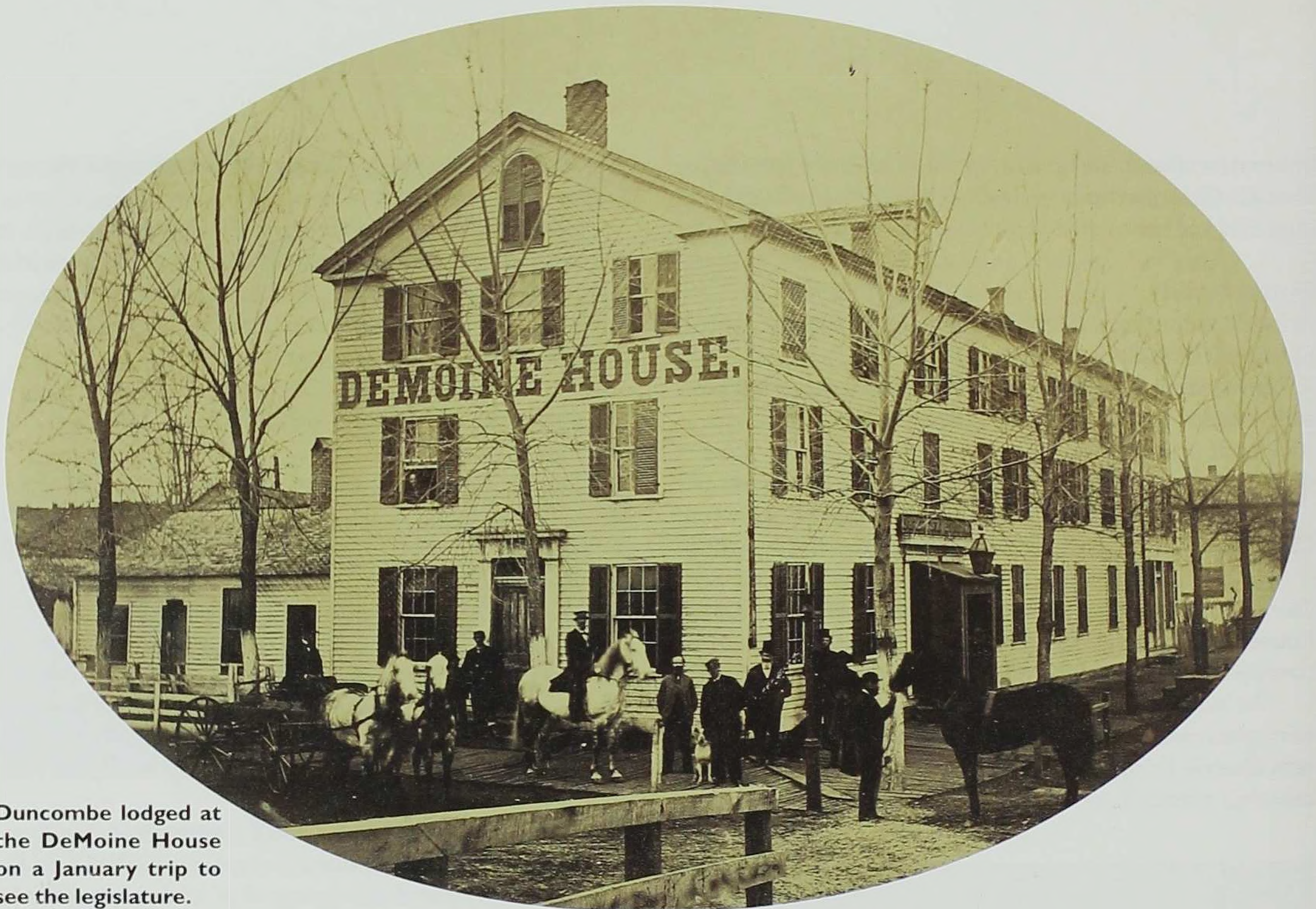
Duncombe lodged at the DeMoine House on a January trip to see the legislature.