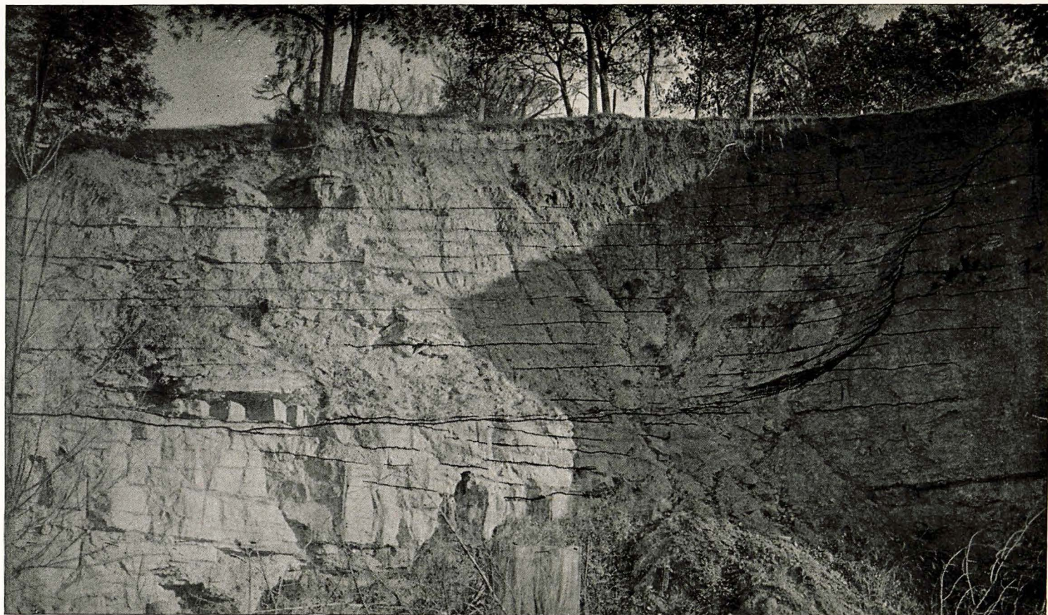
CARBONIFEROUS SANDSTONE IN OLD DEVONIAN GORGE.—IOWA CITY.