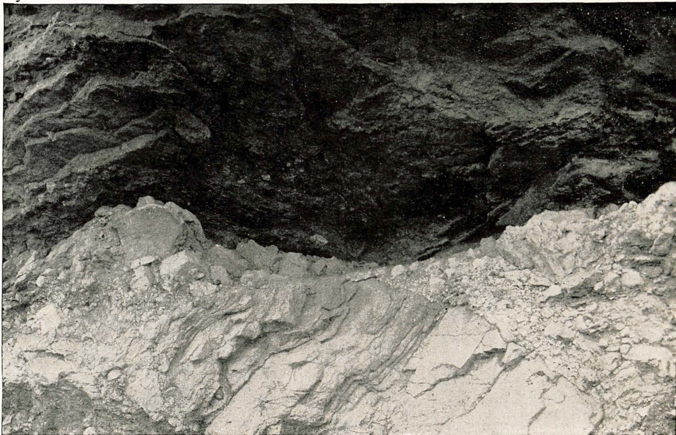
UNCONFORMITY OF COAL MEASURES AND ST. LOUIS LIMESTONE. KEOKUK.