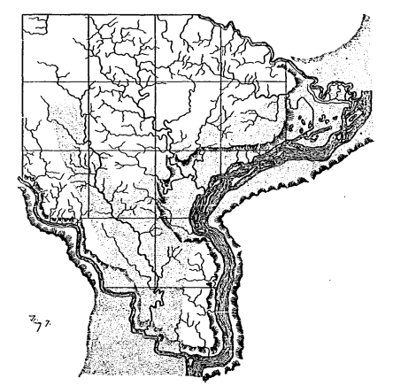
Figure 5. Sketch Map of Lee County, showing courses of old Channels.

along the eastern bank of the stream mark approximately the eastern boundary of the old valley. In a southwest direction from the town no rock appears until the Des Moines river is reached. At the mouth of this stream, on the north side, the limestone stands 100 to 140