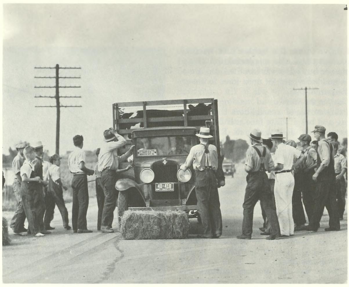
Angry farmers blocked roads to prevent delivery of farm products to the market. Here, farmers use a bale of hay to stop a truck loaded with beef cattle.