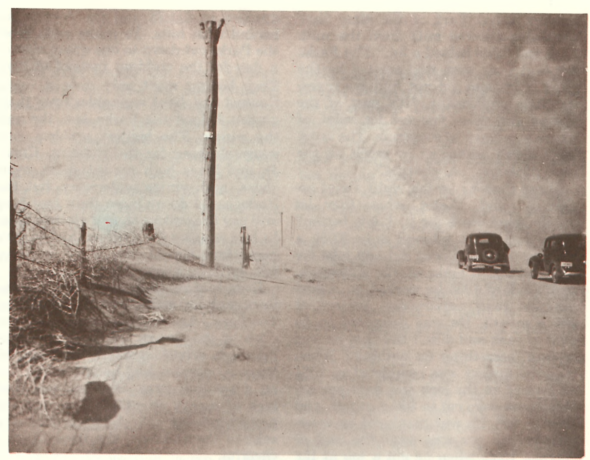
Great clouds of dust blew across Iowa during the droughts in 1934 and 1936.