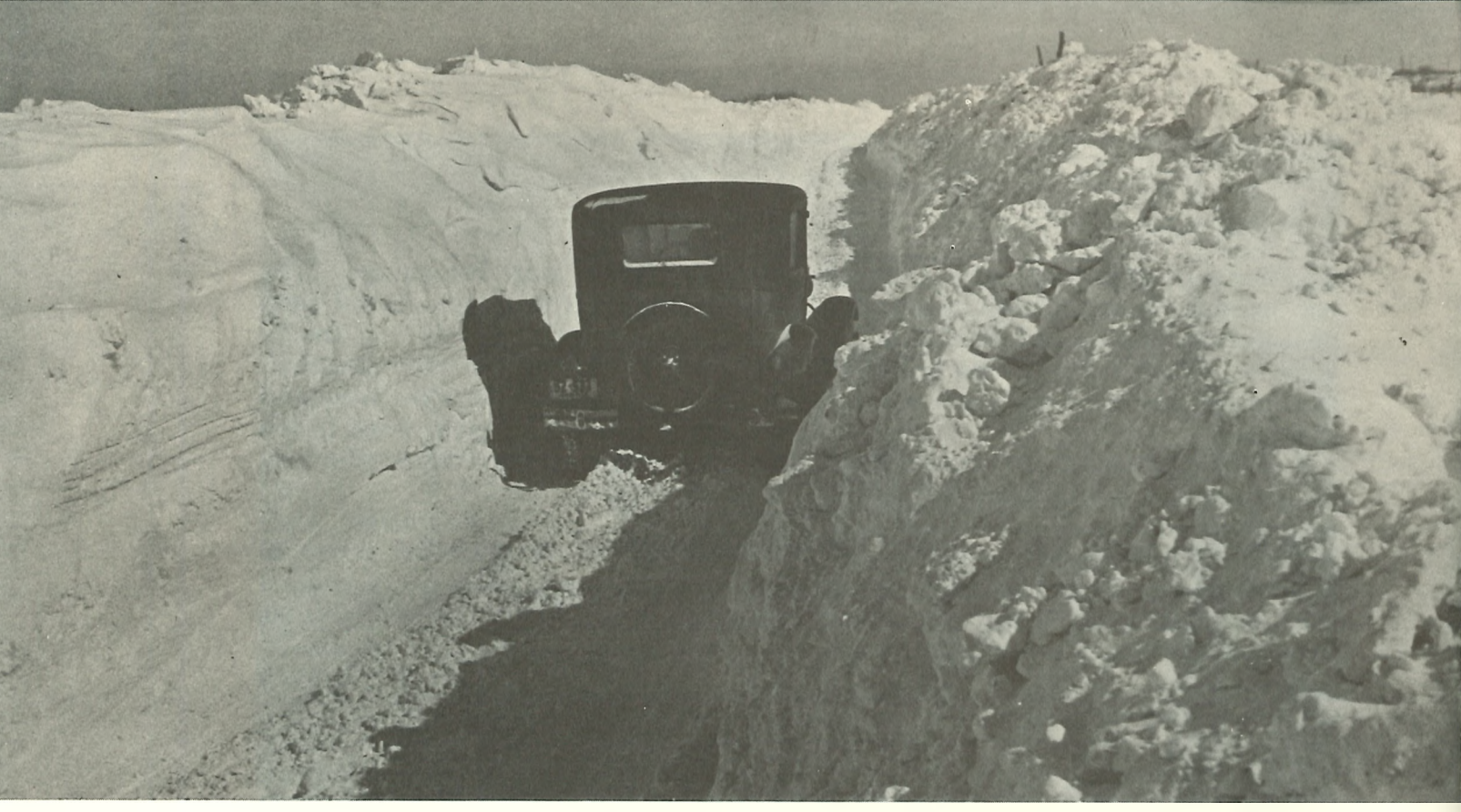
Heavy snowfalls in 1936 made it difficult to keep roads open. The Weather in 1936

Bitter cold—scorching heat. Nature dealt an unkind blow to Iowans in the Depression year of 1936. As if getting by on less money or no money at all wasn't hard enough!