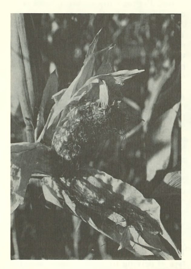
Only a few kernels grew on this ear of corn because of the drought conditions.