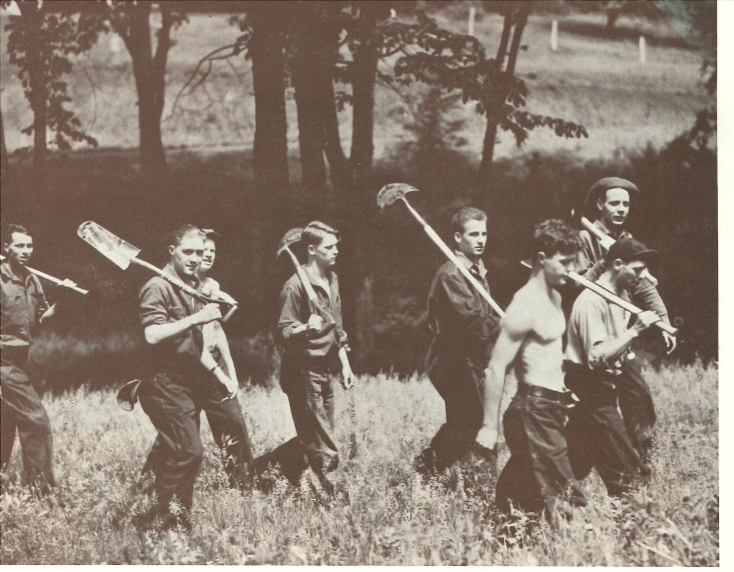
Civilian Conservation Corps (CCC) boys on their way to work.