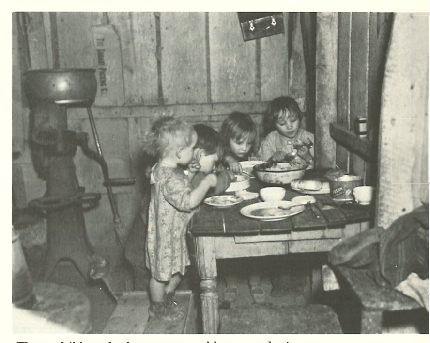
These children had potatoes, cabbage, and pie for their Christmas dinner in 1936.

People who worked in agriculture could no longer earn a good living on their farms. People who had worked in factories and businesses could not find jobs. Life was hard for most Americans. It was hard for most Iowans.