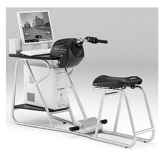
Figure 1. Honda riding simulator

Vidotto et al (2008) provide significant detail describing the Honda Rider Trainer (HRT) simulator (see Figure 1). In brief, the motorcycle interface consists of handlebars with throttle and other controls, with brakes and gear change operable by the user's feet, as is the case for a real motorcycle. A virtual ride is played out on a computer monitor. The rider controls their passage through the scenario, interacting with other road users and infrastructure. Steering at all speeds is controlled via the handlebars only as the motorcycle does not lean for cornering.