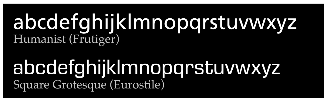
Figure 2. Samples of the typefaces used, scaled to identical capital heights. Figure rendered in Adobe Photoshop CS5

The experimental task consisted of a 1-interval forced choice word recognition task. A single trial of this task is illustrated in Figure 1. Participants were asked to determine whether a briefly presented set of letters formed a word or pseudoword. The difficulty of the task was automatically adjusted based on the participant's performance accuracy, with the goal of keeping mean accuracy at approximately 79.4%. In this way, participants will arrive at different presentation time thresholds for each typeface. A more legible typeface should require less time on screen to be read accurately (a lower threshold).