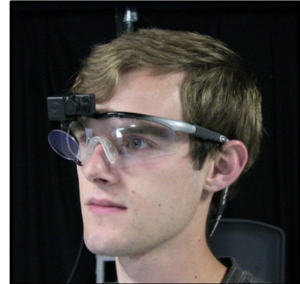
Figure 2. Mobile Eye XG

Eye tracking data was collected using a Mobile Eye-XG platform from Applied Science Laboratories (Figure 2). The advanced Mobile Eye-XG allows the user to not only have unconstrained eye movement but also unconstrained head movement, generating a sampling rate of 30 Hz and an accuracy of 0.5 to 1.0 degree. The subject's gaze is calculated based on the correlation between the subject's pupil position and the reflection of three infrared lights on the surface of the eye. Eye movement consists of fixations and saccades where fixations are points that are focused for more than 100 milliseconds and saccades are when the eye moves to another fixation point.