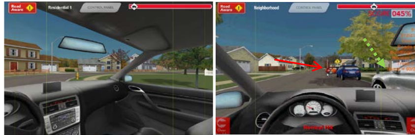
Figure 1: a) View when driver pans to the right; b) Hazard feedback: When a participant clicks on an important potential hazard (e.g., a car pulling out, red, solid arrow), the RA hazard sign appears above it (green, dotted arrow)

environment was used for practice and acclimation to the training program. One drive from each of the three remaining environments was used in this study. Each drive was 10 to 15 minutes in length. Trainees see the drives from the driver's perspective and can visually scan to their left and right sides, over their shoulders, and to the vehicle's rear and side mirrors. The vehicle's speed and lane position are controlled by the program. While driving, trainees are asked to scan the traffic environment and either click with a mouse (Figure 1, panel b) on or pan using the keyboard (panel a) towards objects and areas that present a potential hazard to drivers. Trainees receive auditory and visual feedback on whether, through their clicking and panning, they have identified important potential hazards. At the end of each drive, trainees are given the opportunity to review the most important hazards in each drive.